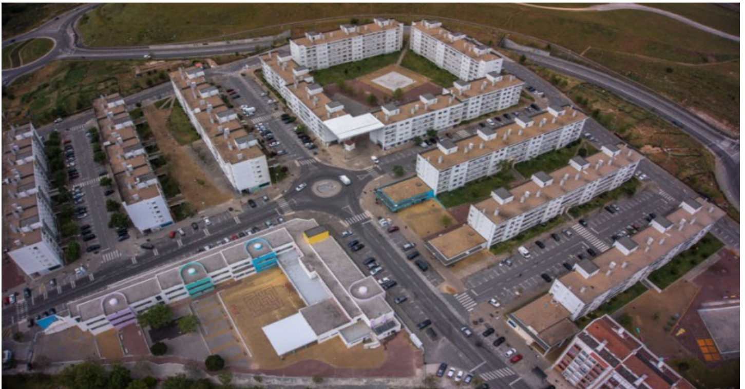
Empreendimento da Boba (Development)