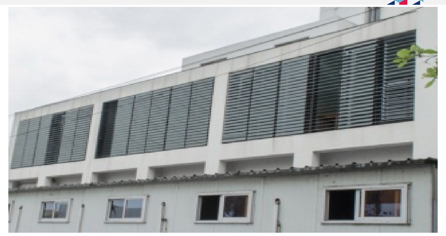
Sagrada Esperança Clinic