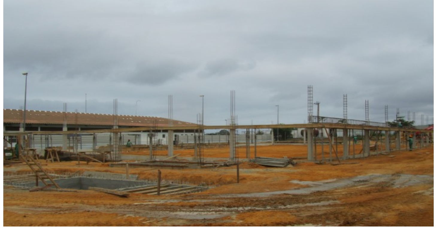
CABINDA'S HEMODYALISIS CLINIC (Edifer Angola)