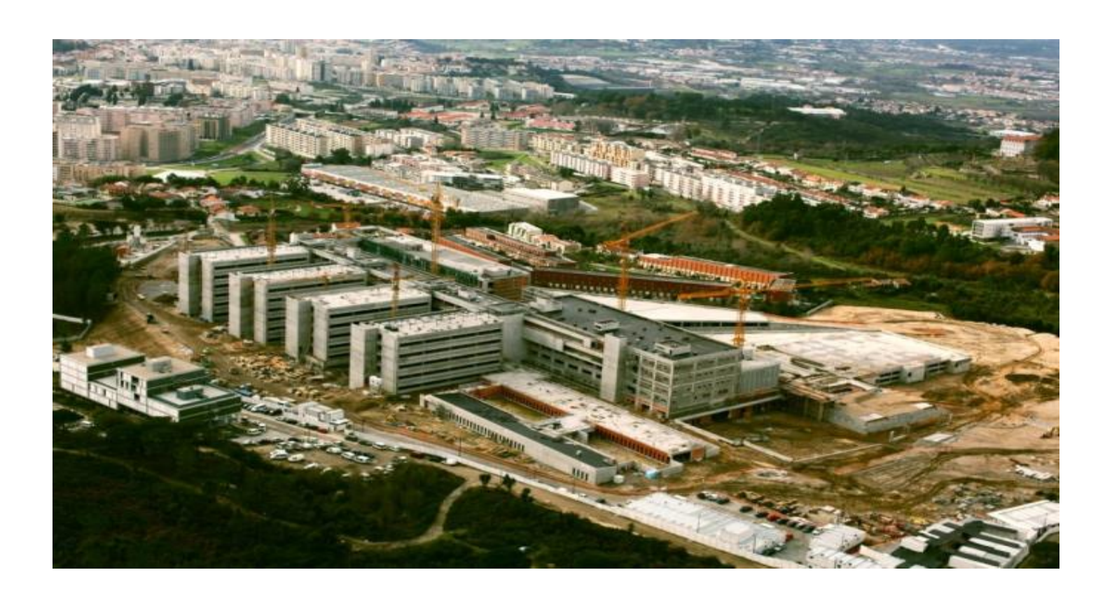
New Hospital in Braga