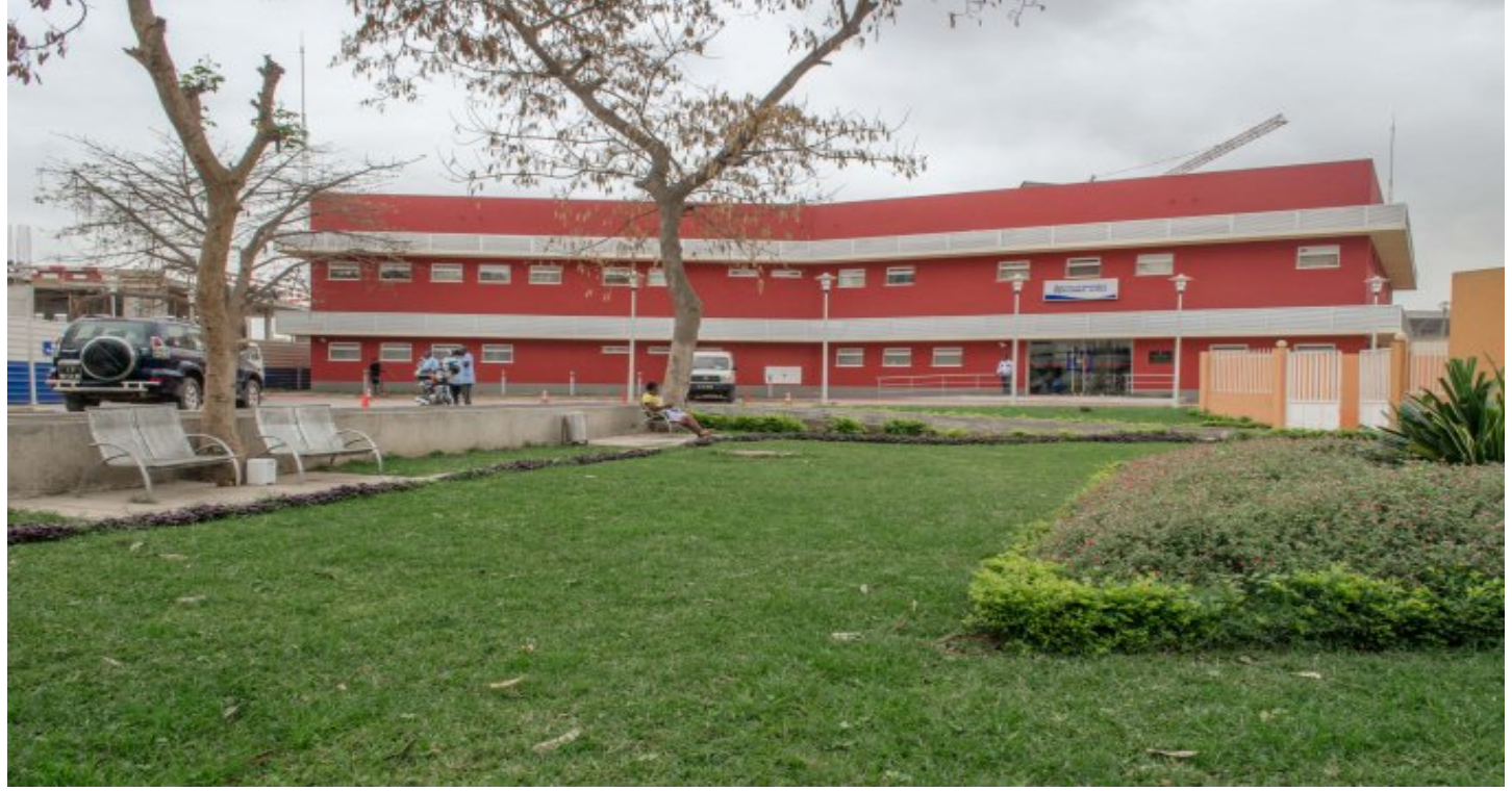
Hemodialysis Clinic CHPA