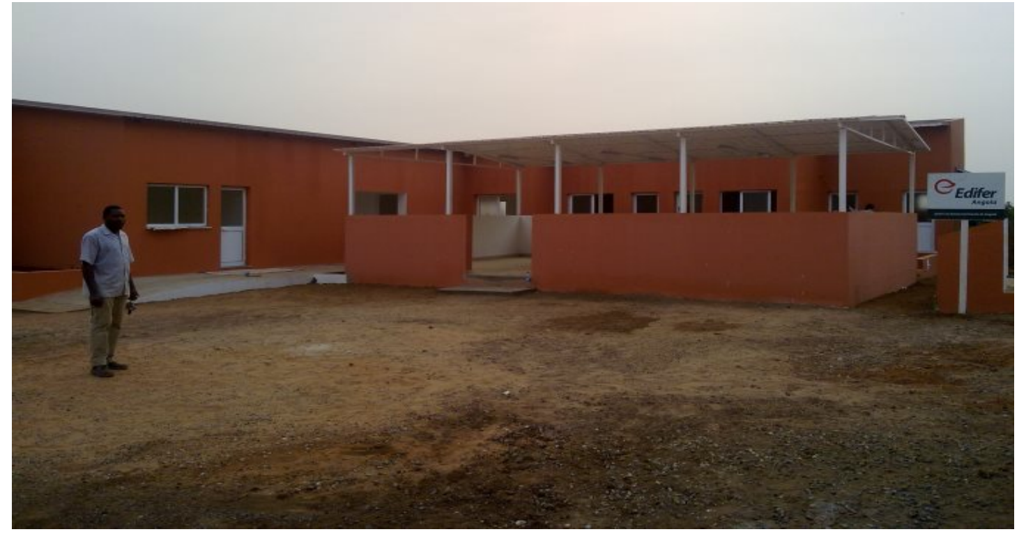
MALANGE HEALTH CENTRE (Edifer Angola)