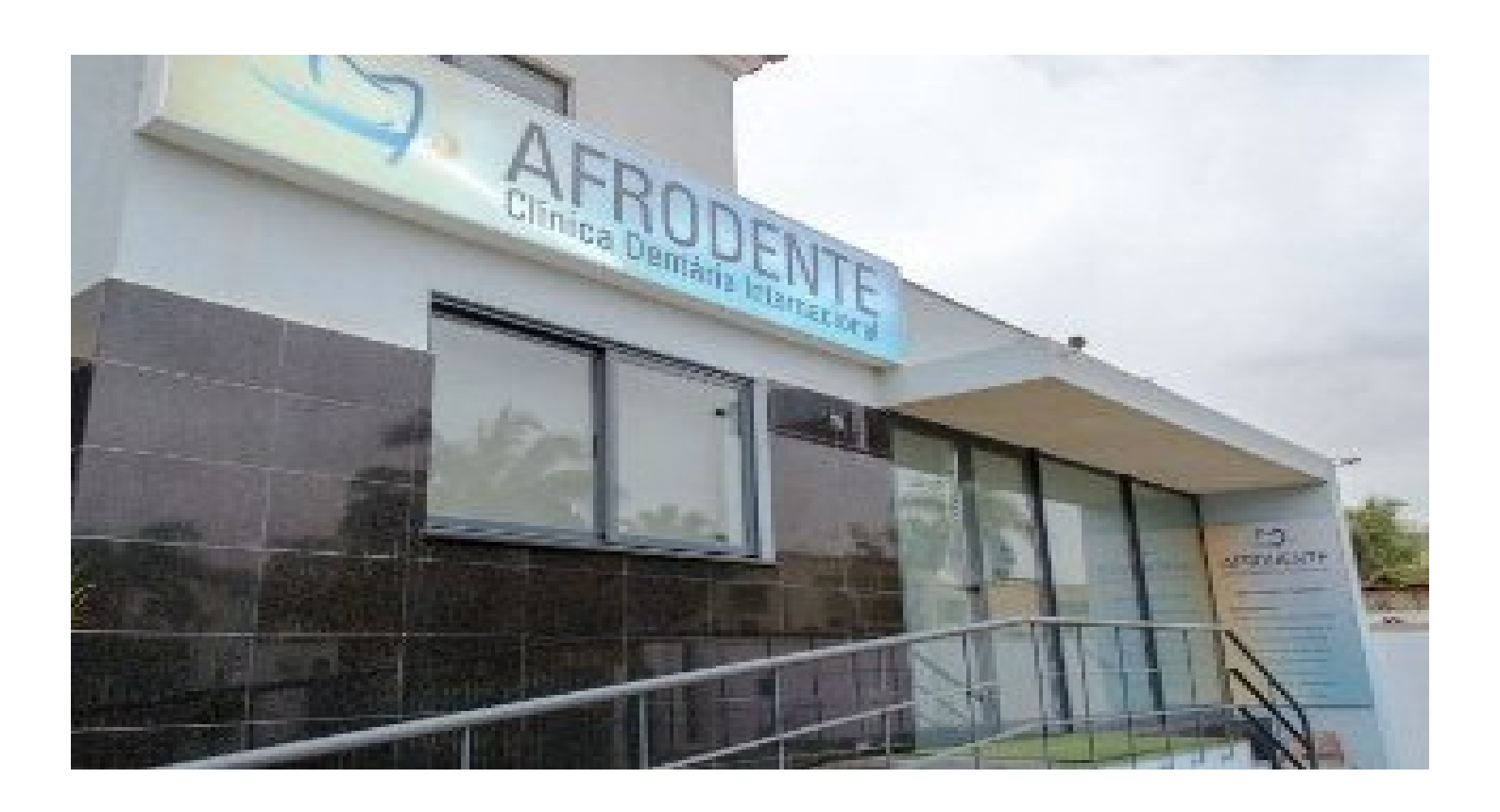
Afrodente Dental Clinic