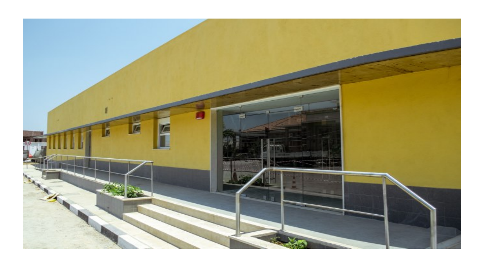
HEMODIALYSIS CLINIC IN LOBITO (Edifer Angola)