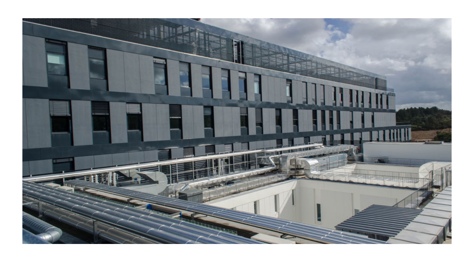
Vila Franca de Xira Hospital