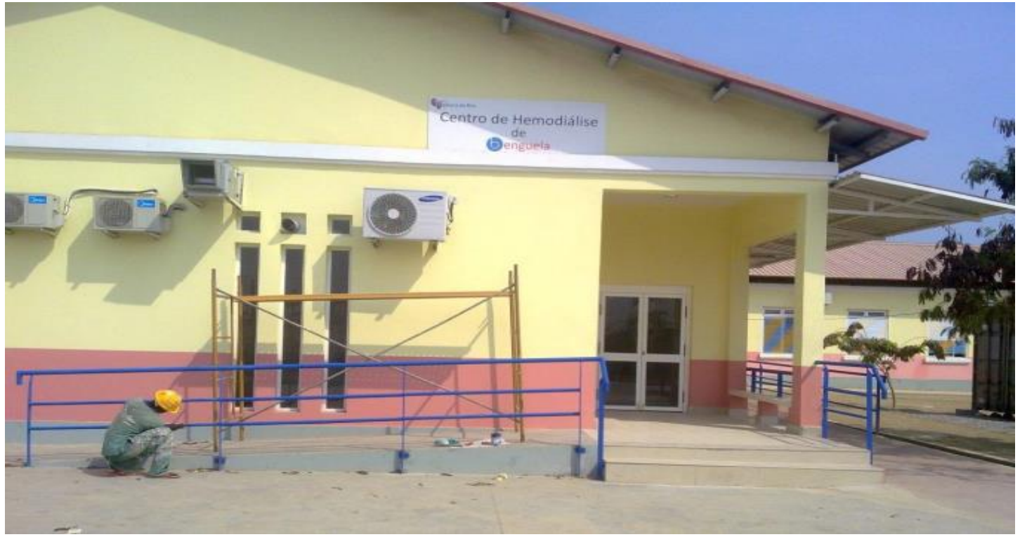
HEMODIALYSIS CLINIC IN BENGUELA (Edifer Angola)