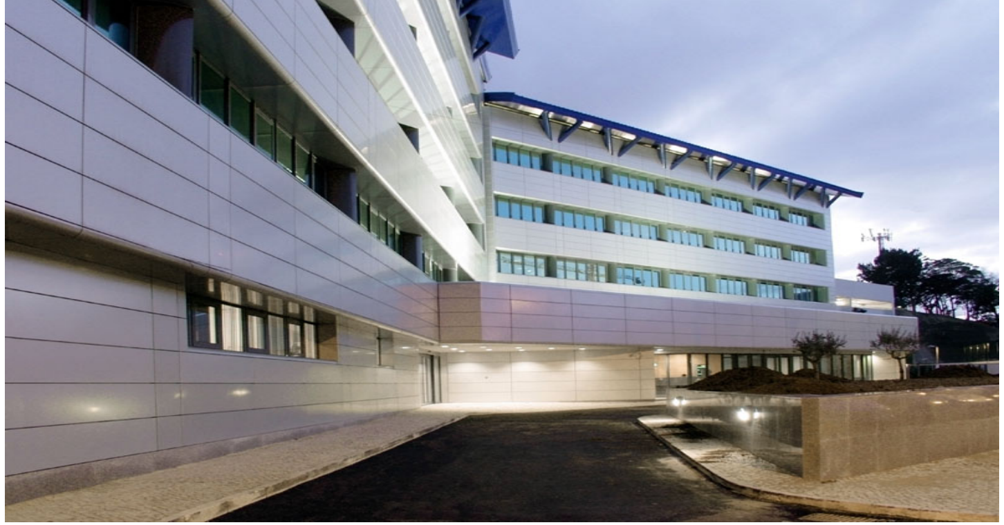
SAMS Ambulatory Clinical Centre