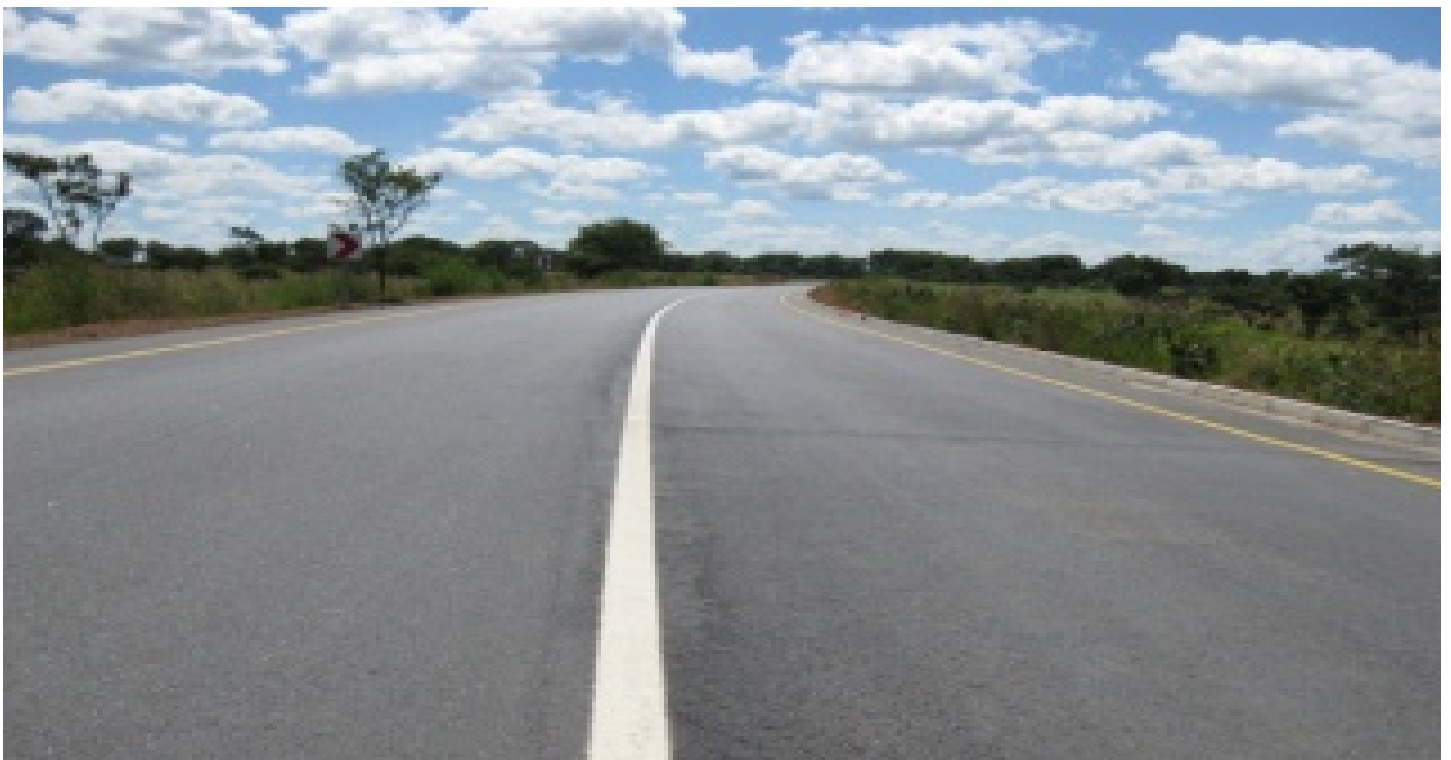
Road Networks Asset Management (SARA project)