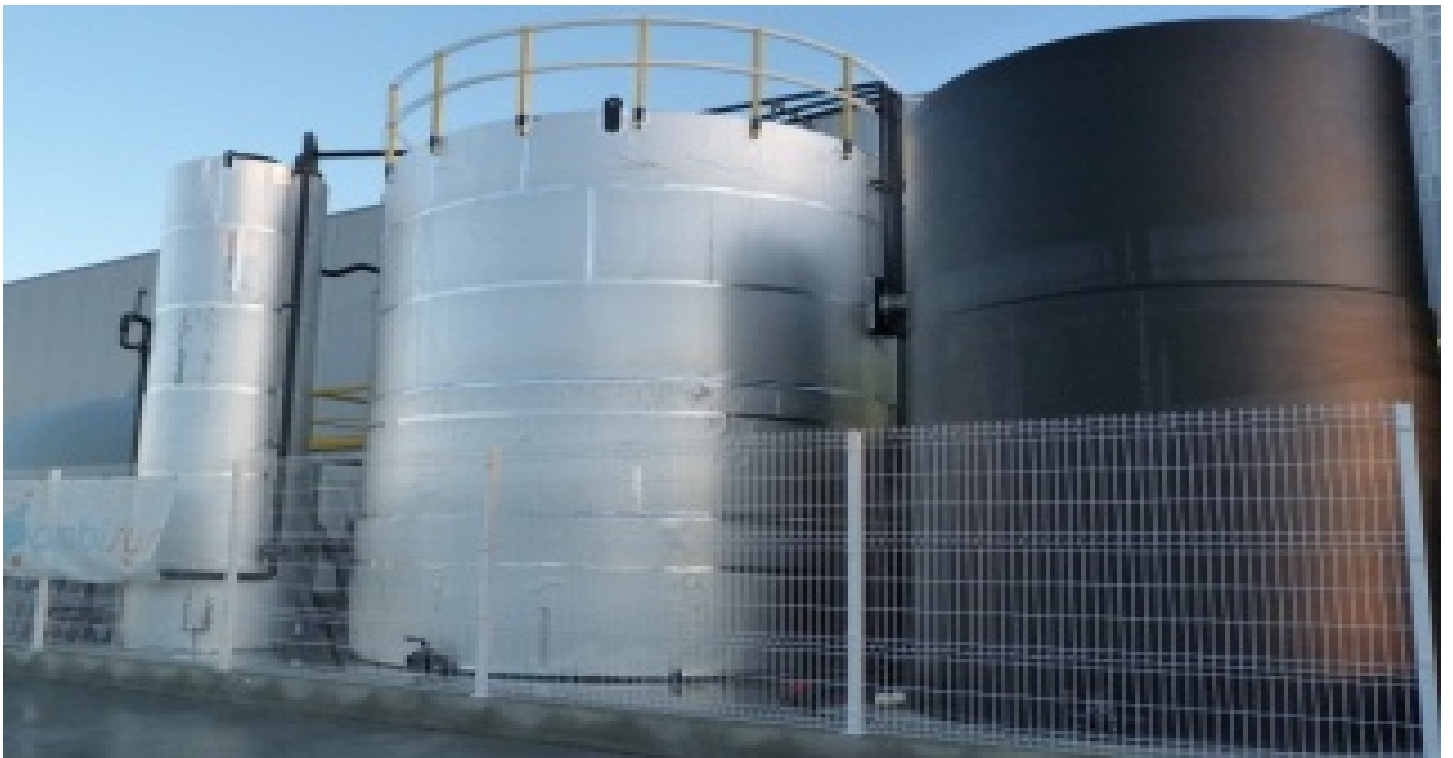
Projects in the Environmental and Energy sectors