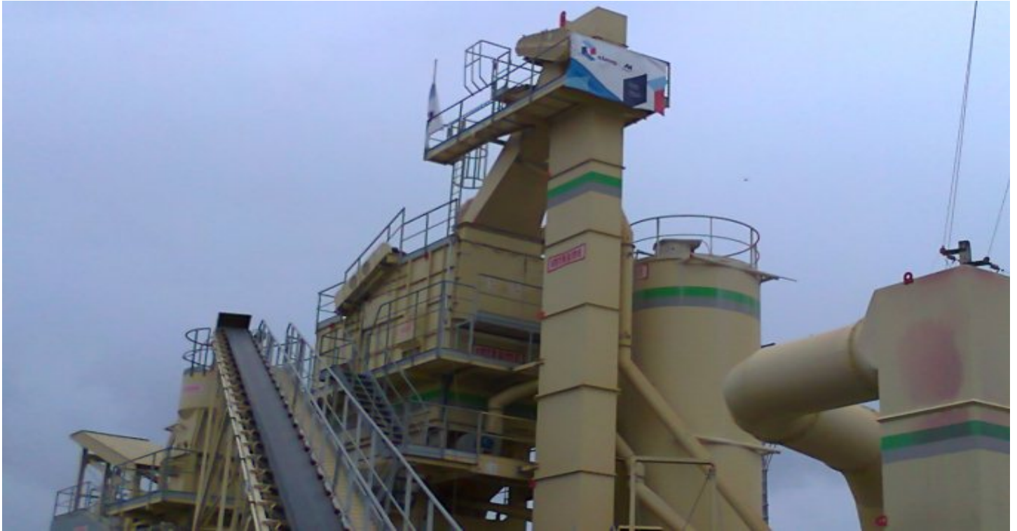
Asphalt Mix with High RAP Content