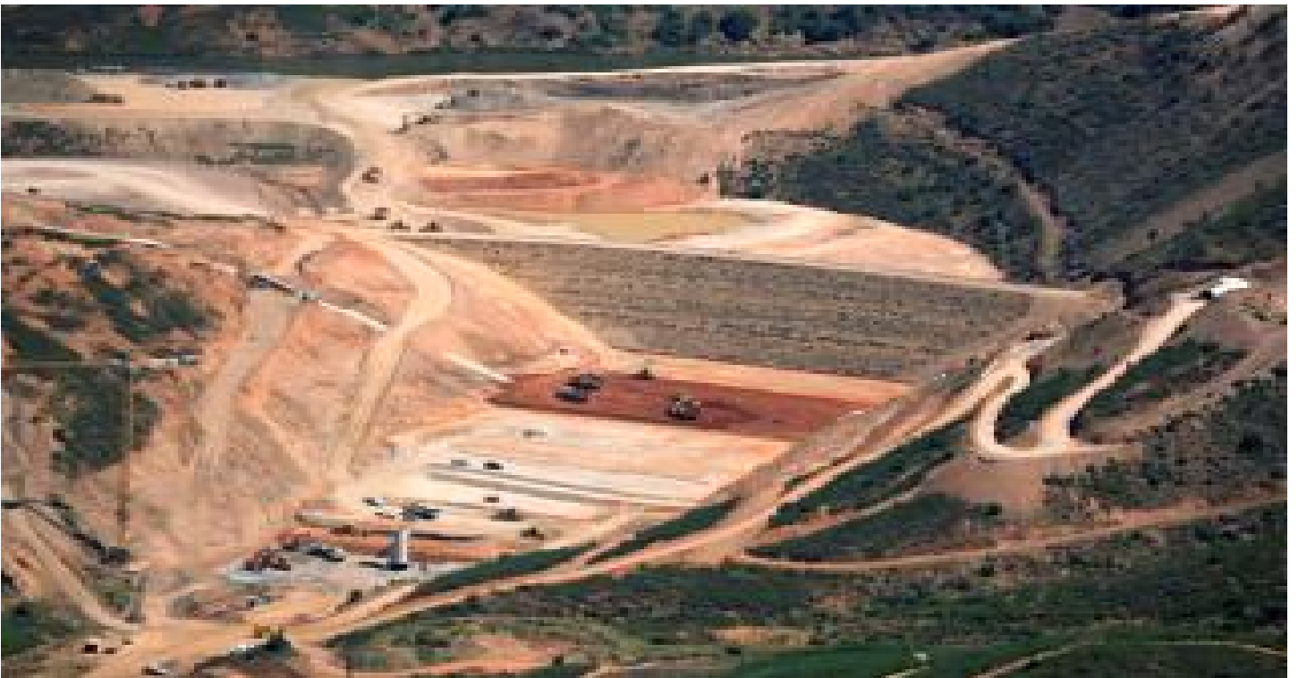
Marine and River Works Projects