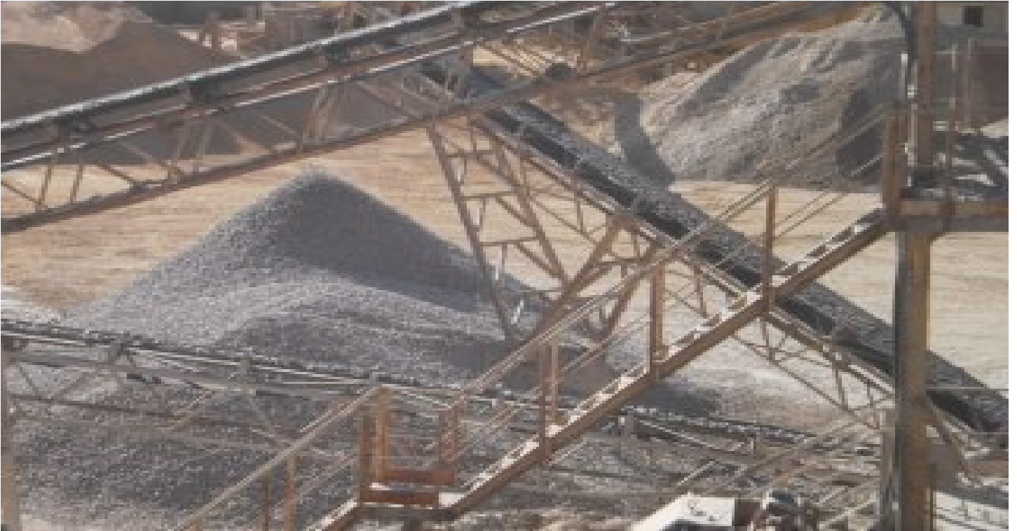
Projects in the Aggregates and Industry sectors