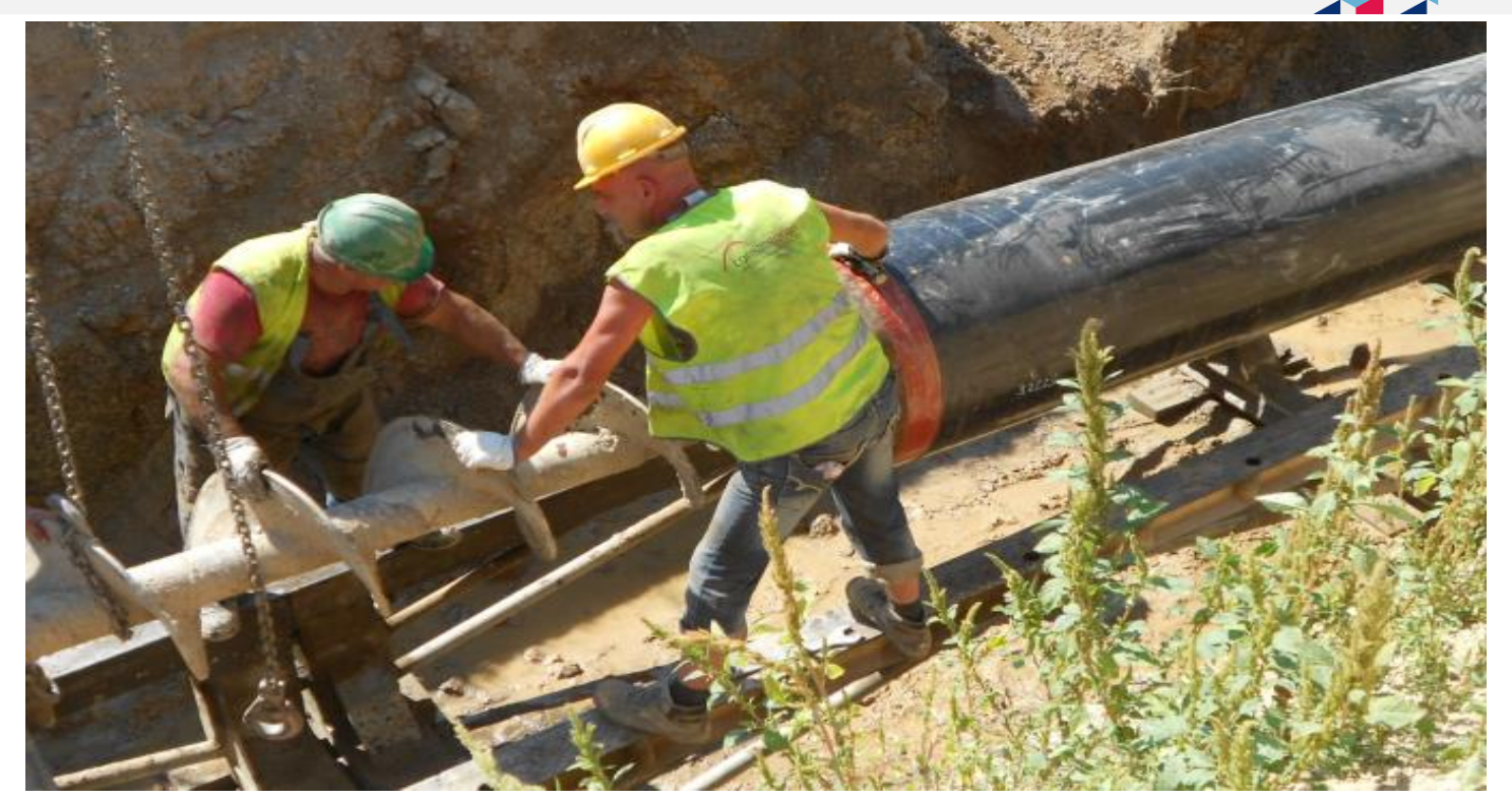
Mangualde Gas Pipeline