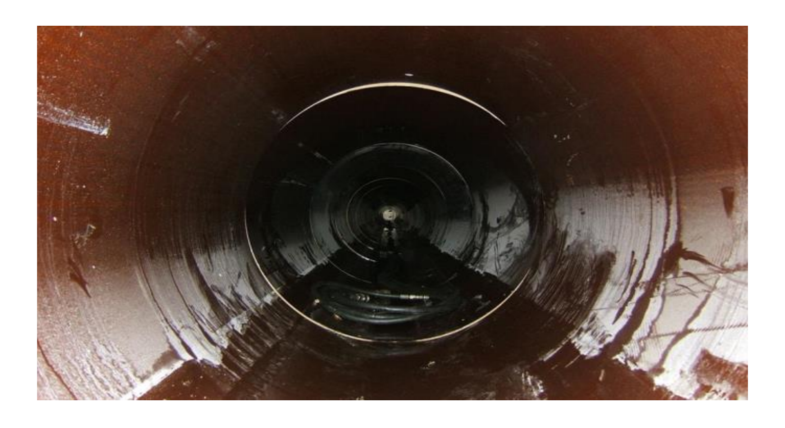
Interceptors, outflows and elev. stations V.F.Xira and Alhandra