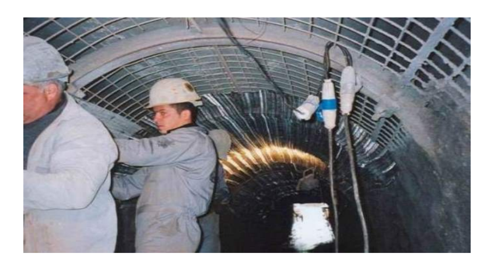
Mini Hydroelectric Plant tunnels