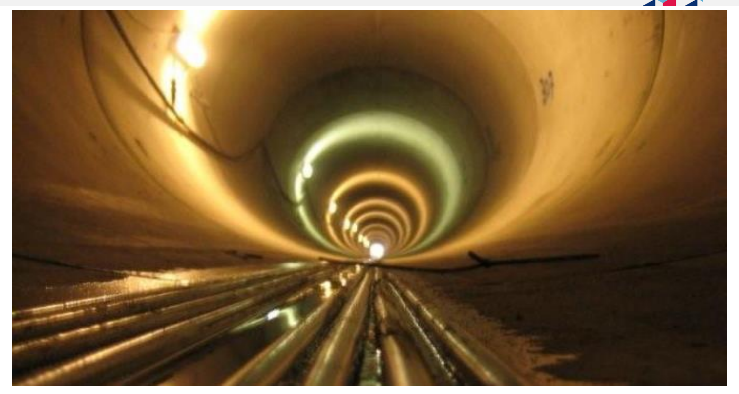
Mira Aquaculture Project