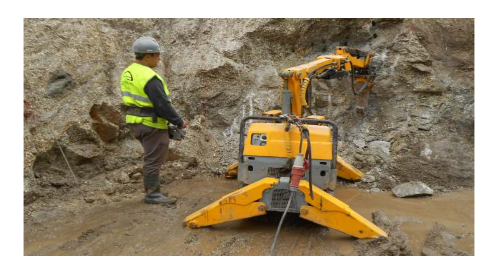
São Salvador Tunnel