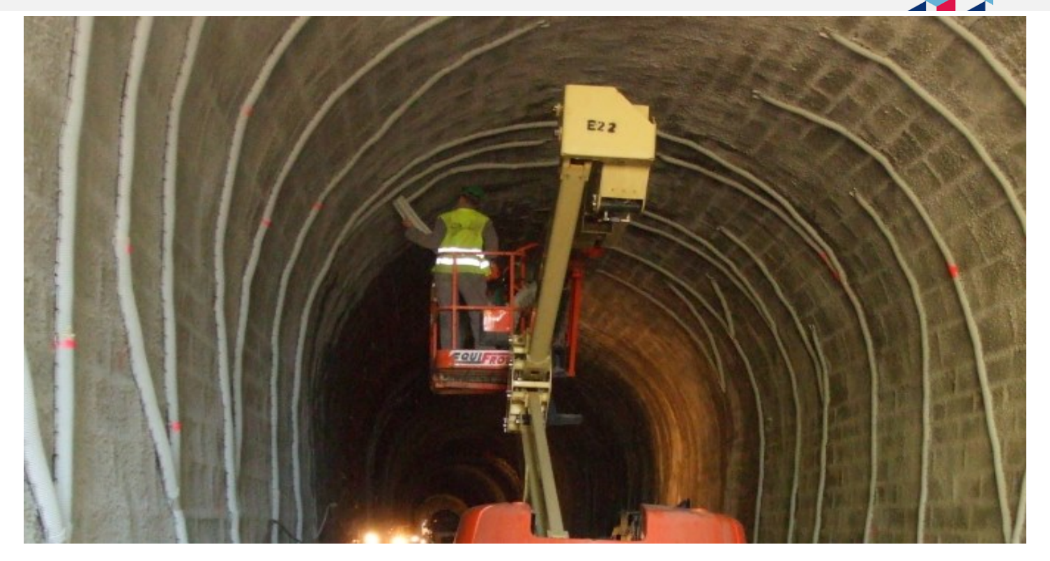
Sabugal tunnel rehabilitation and enhancement