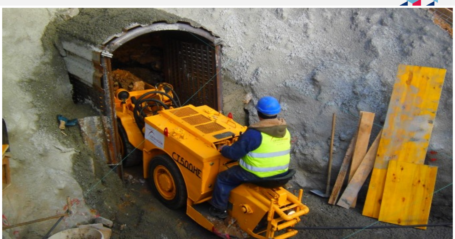
Mini tunnels in Barcelona