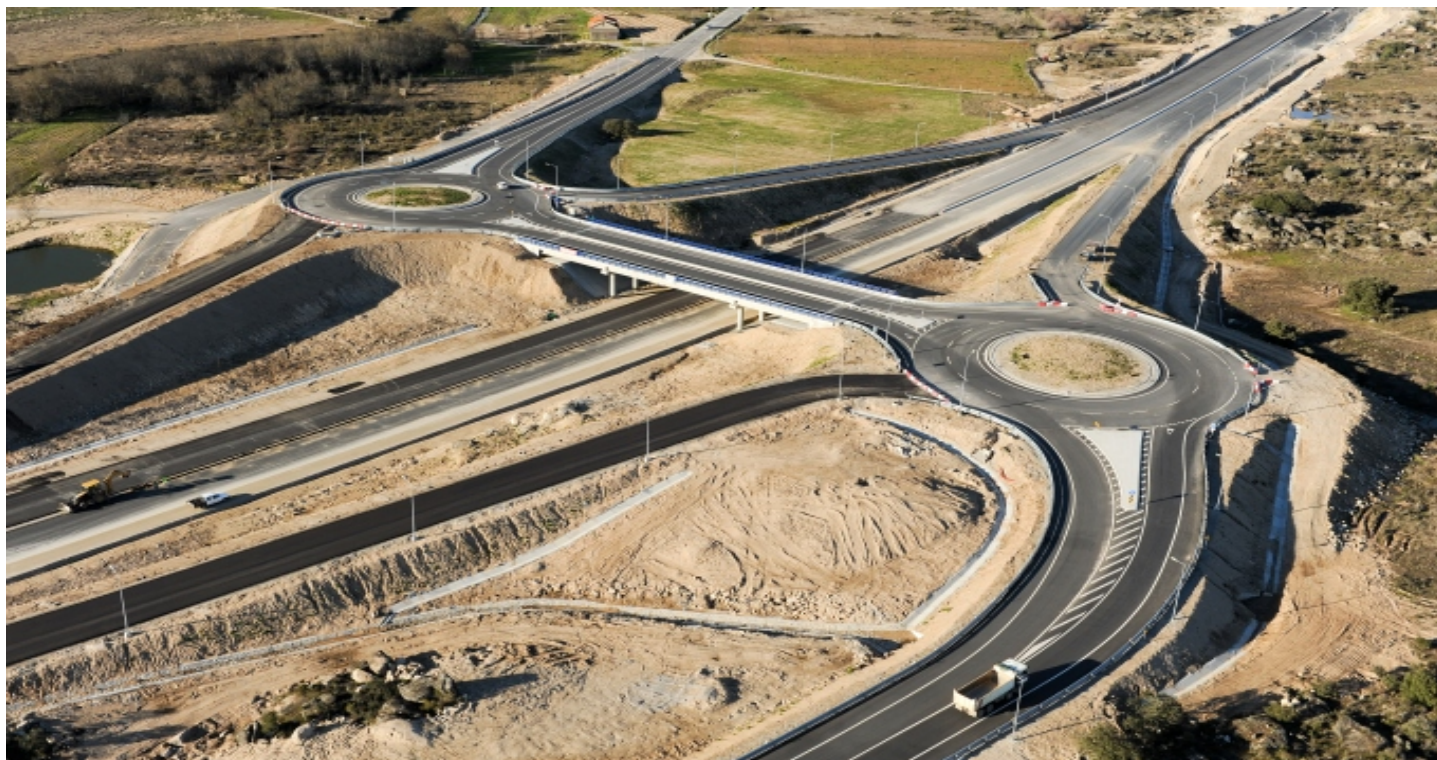
Douro Interior Subconcession