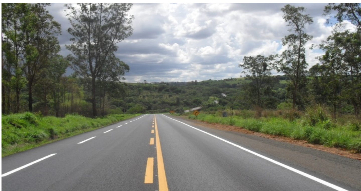
Restoration BR 262 MG - Crema 1st stage