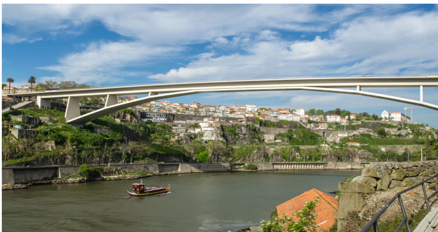
Infante D. Henrique Bridge