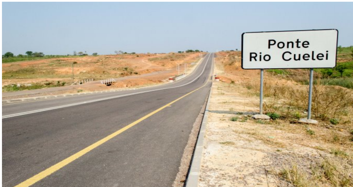
Menongue Roads (Edifer Angola)