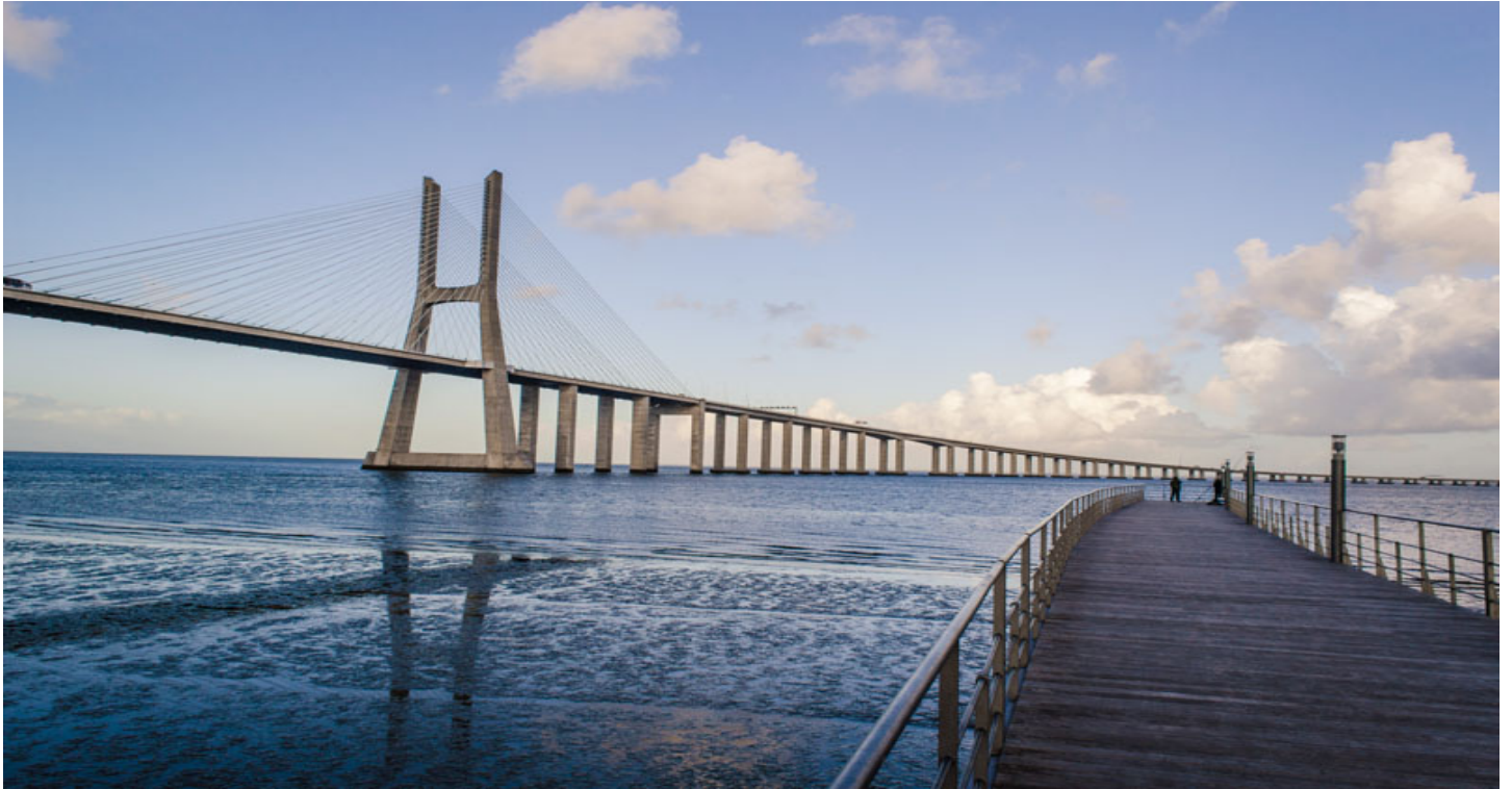
Vasco da Gama Bridge