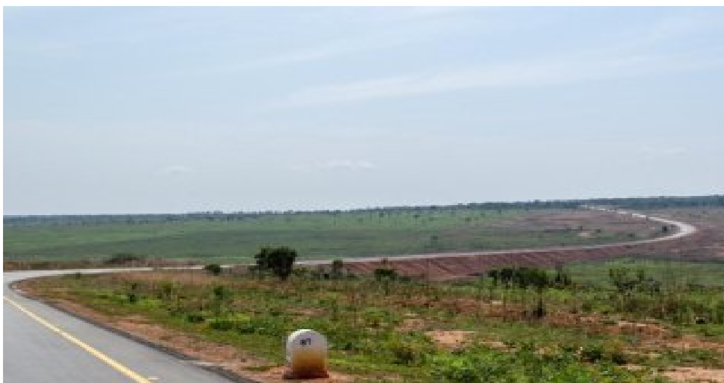
Bailundo - Mungo Road