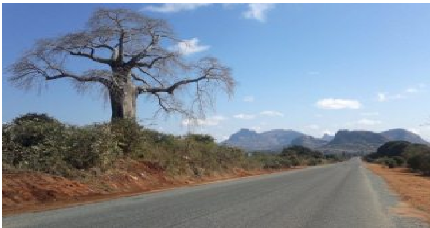
Road N1 Namialo-Lurio