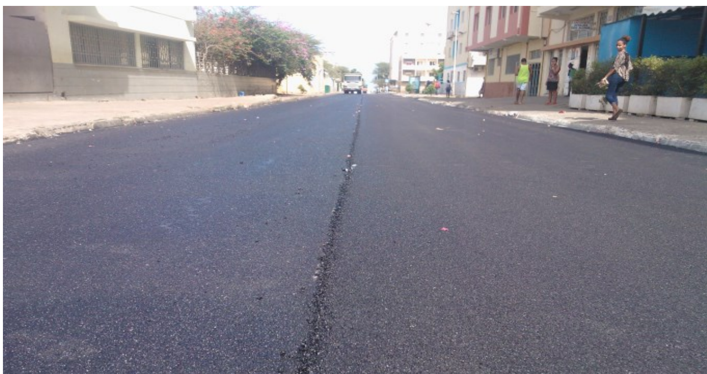
Asphalting works on Bairro de Achada de Santo António