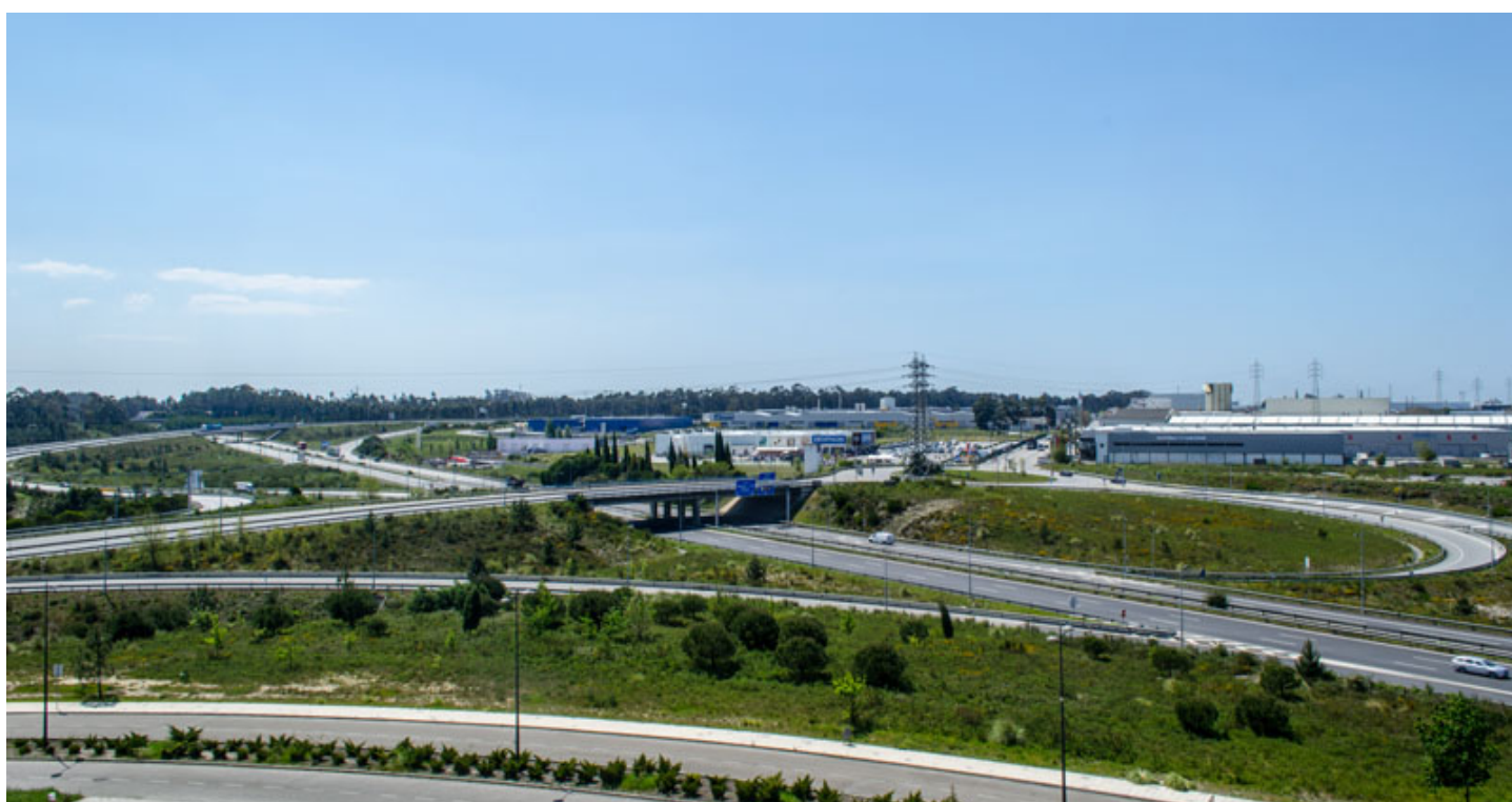
SCUT Costa de Prata - Subsection Mira - Aveiro/Nó do Estádio