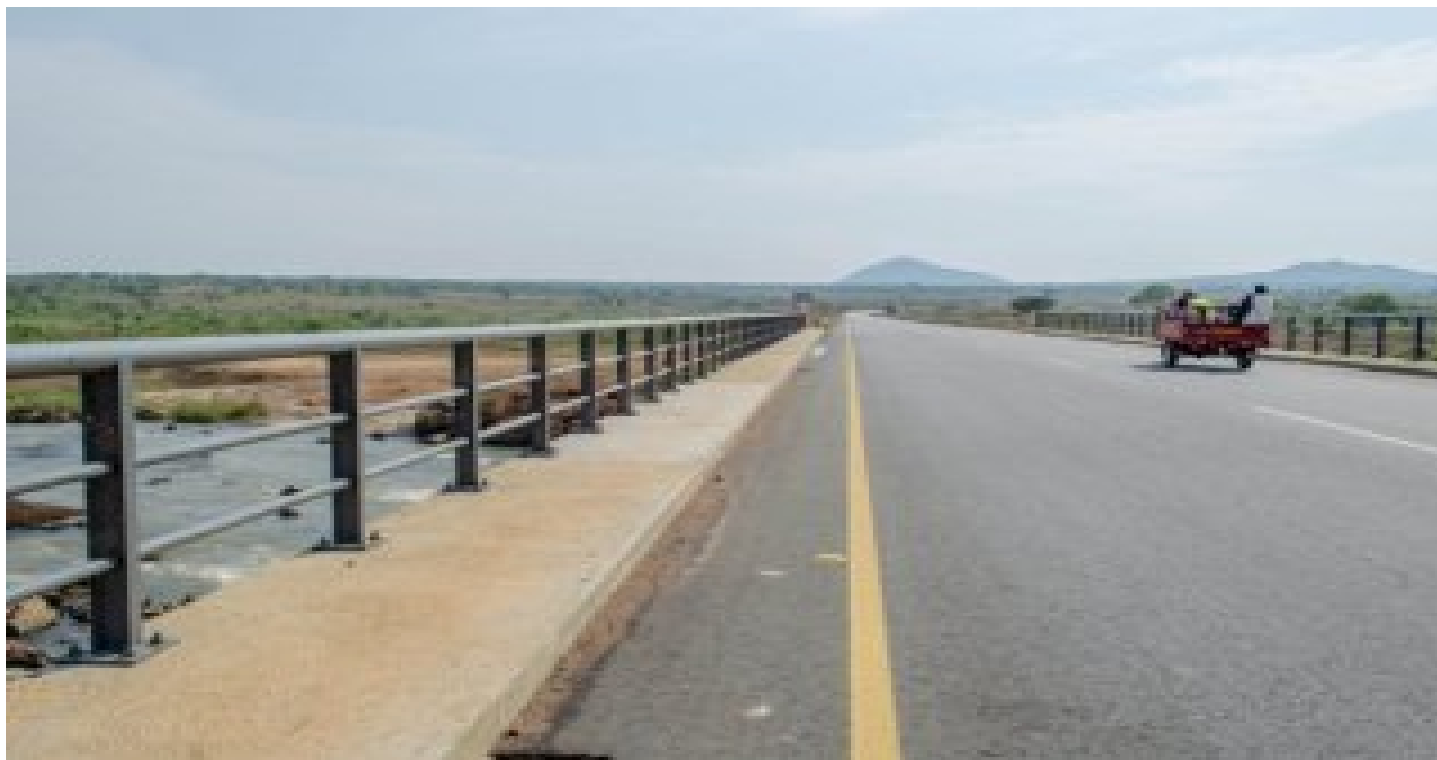
Alto Hama - Bailundo Road