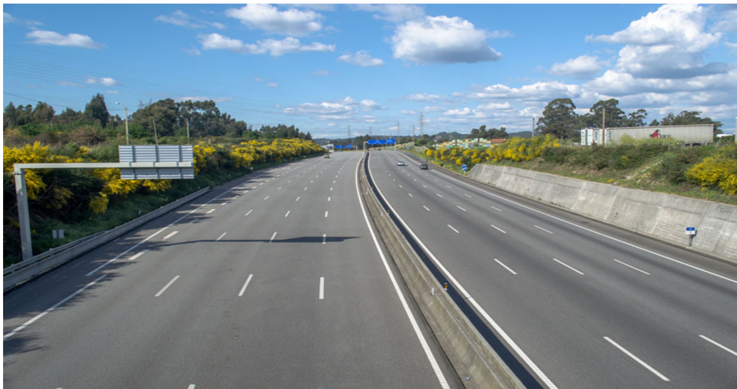
Wider Oporto Motorway