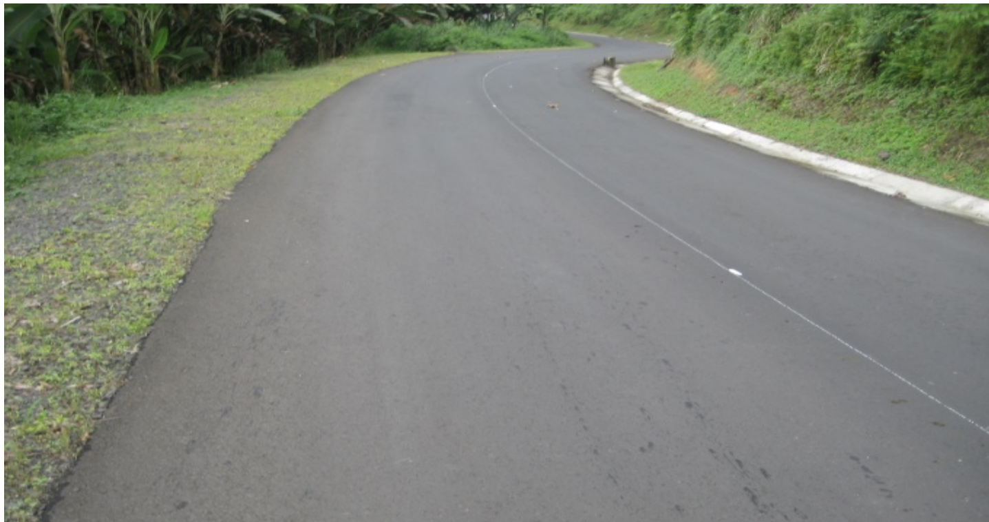
Av. Kwame Nkrumah (EN2) – Ribeira Peixe