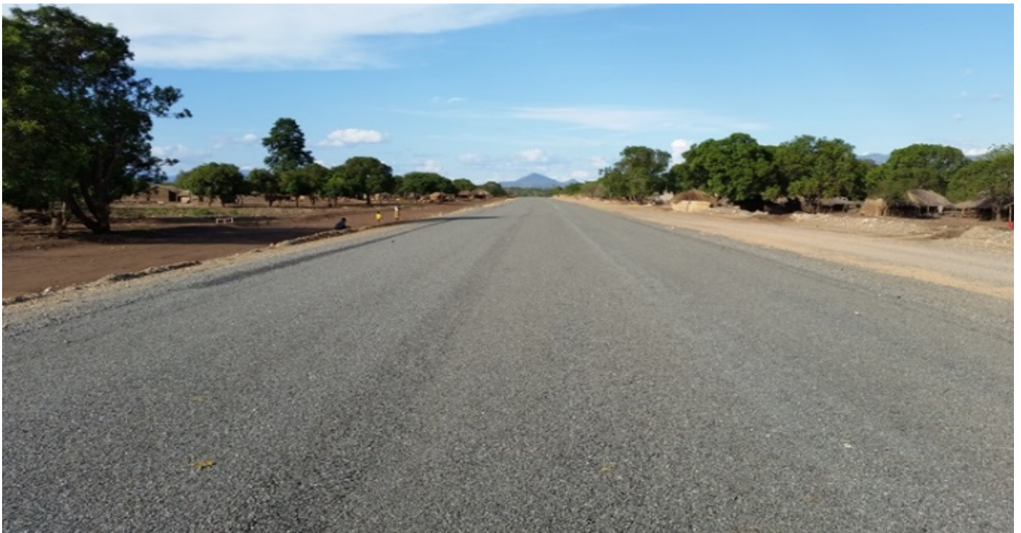
Road N103 and R657: Magige, Etatara and Cuamba