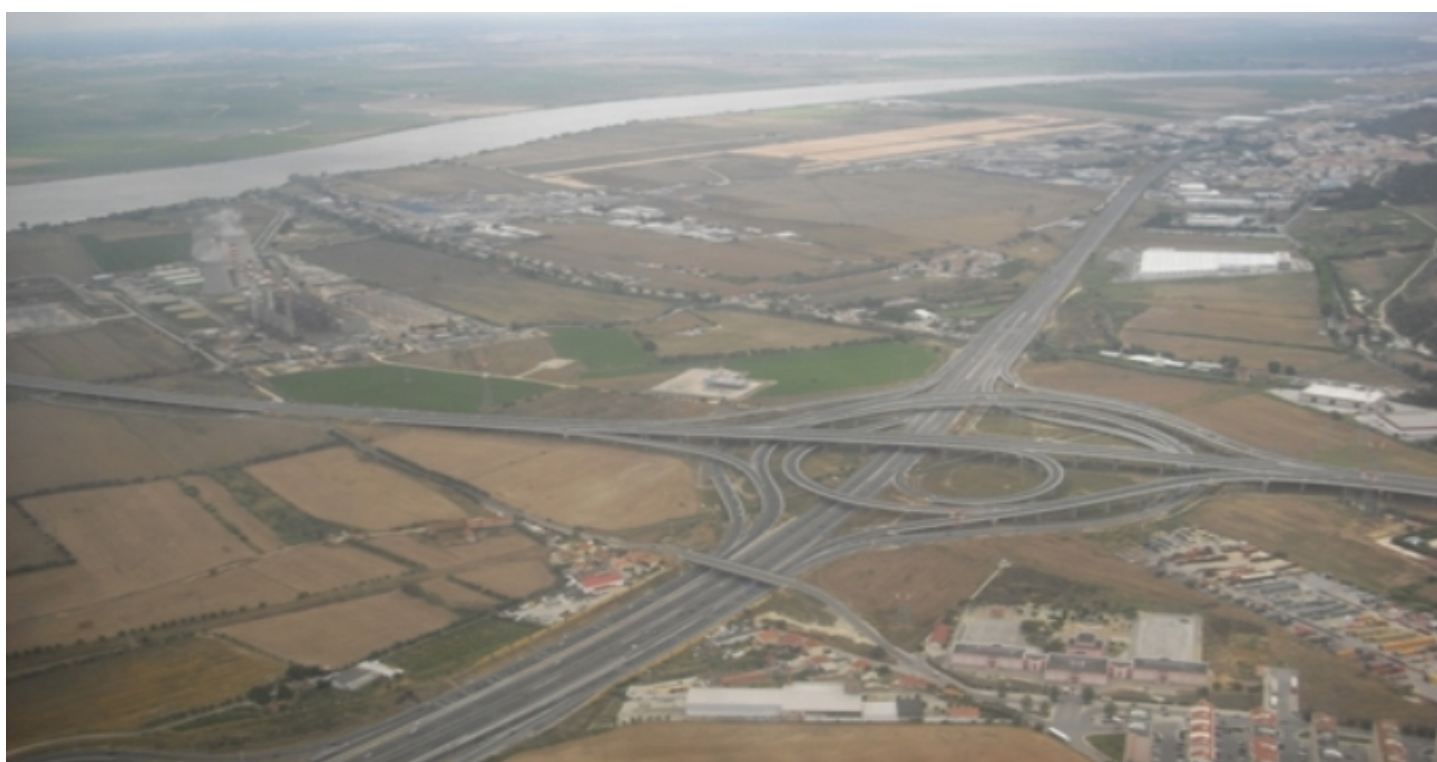
Logistics Platform of North Lisbon (PLLN)