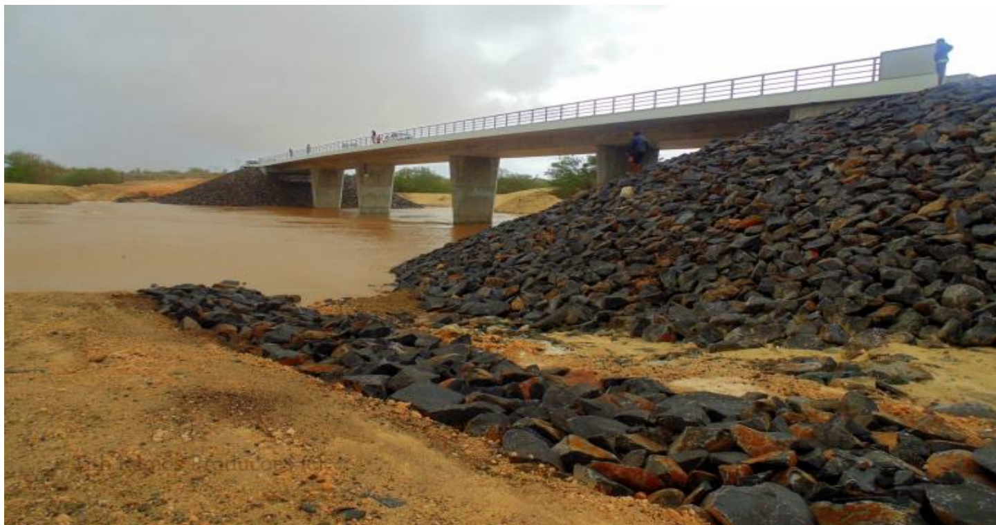
NEW RIBEIRA D'ÁGUA BRIDGE