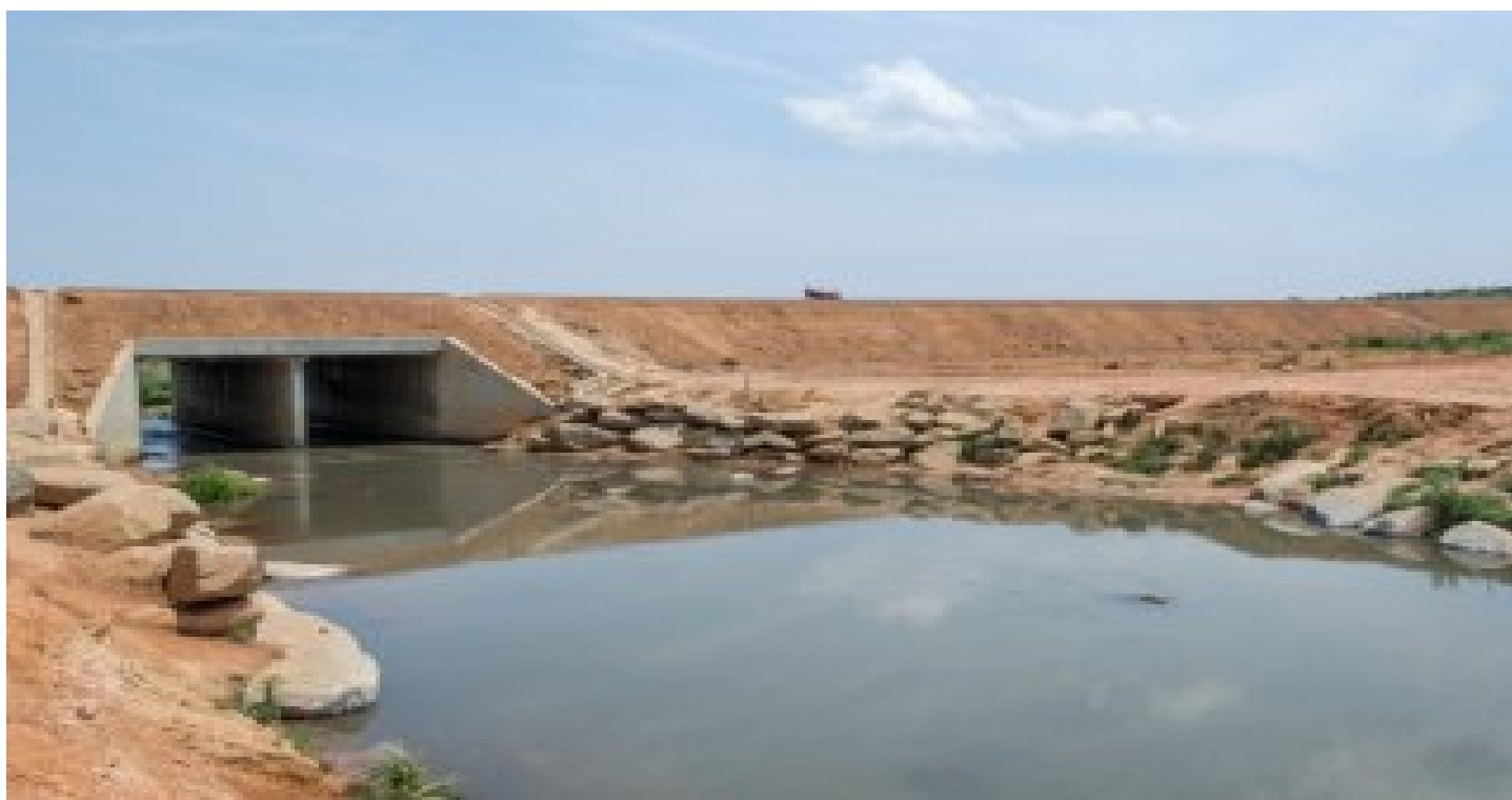
Mungo - Calucinga Road