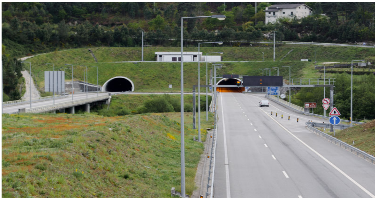
IP3 - Variante de Castro Daire (Bypass Road)