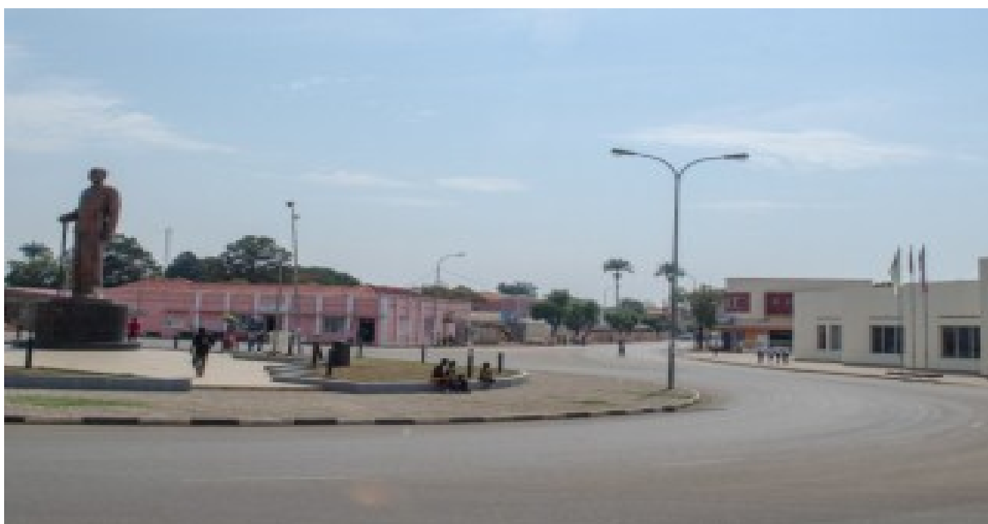
Roadways of Bailundo