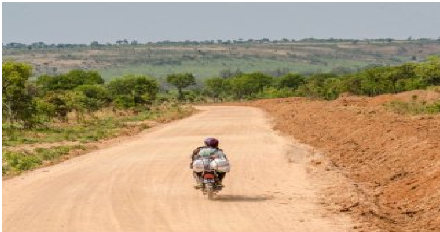
Tertiary Kuito Road