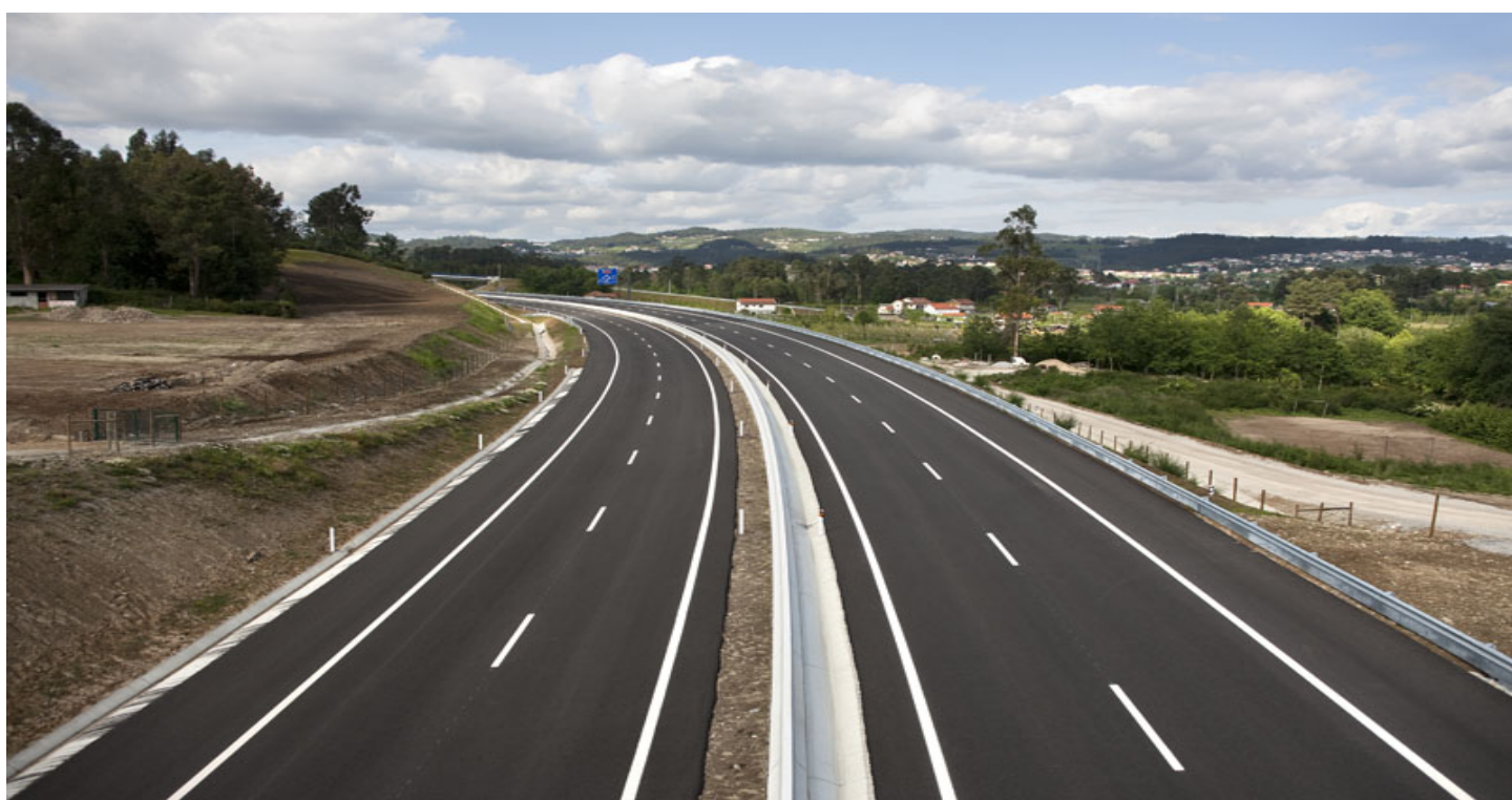
Bypass Road to EN207 IP9 Longra - Felgueiras