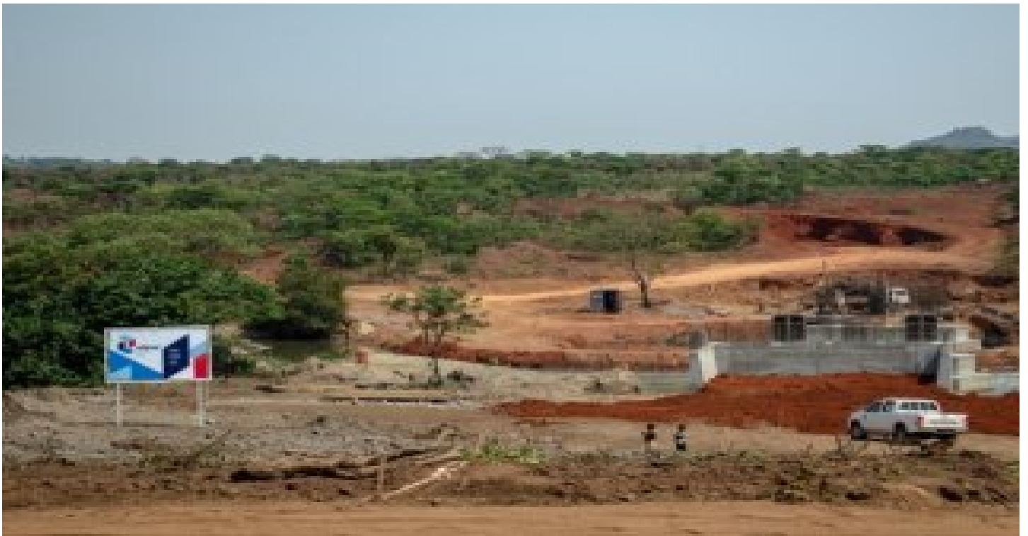
Bridge River Keve