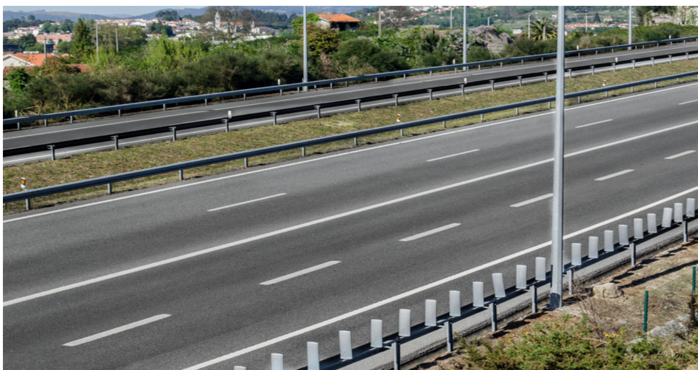
A7-Sublanco Selho-Calvos (Subsection)