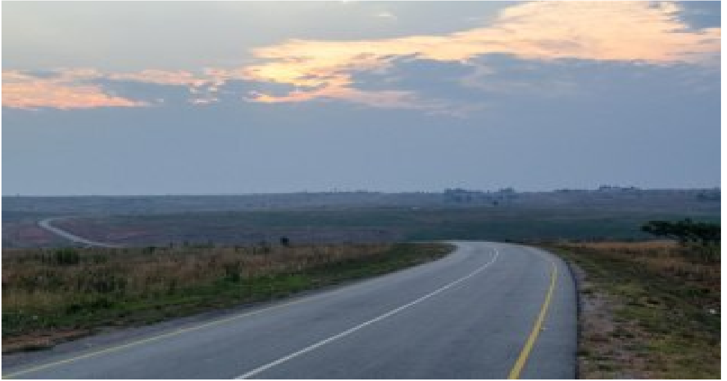
Kuito / Huambo Road