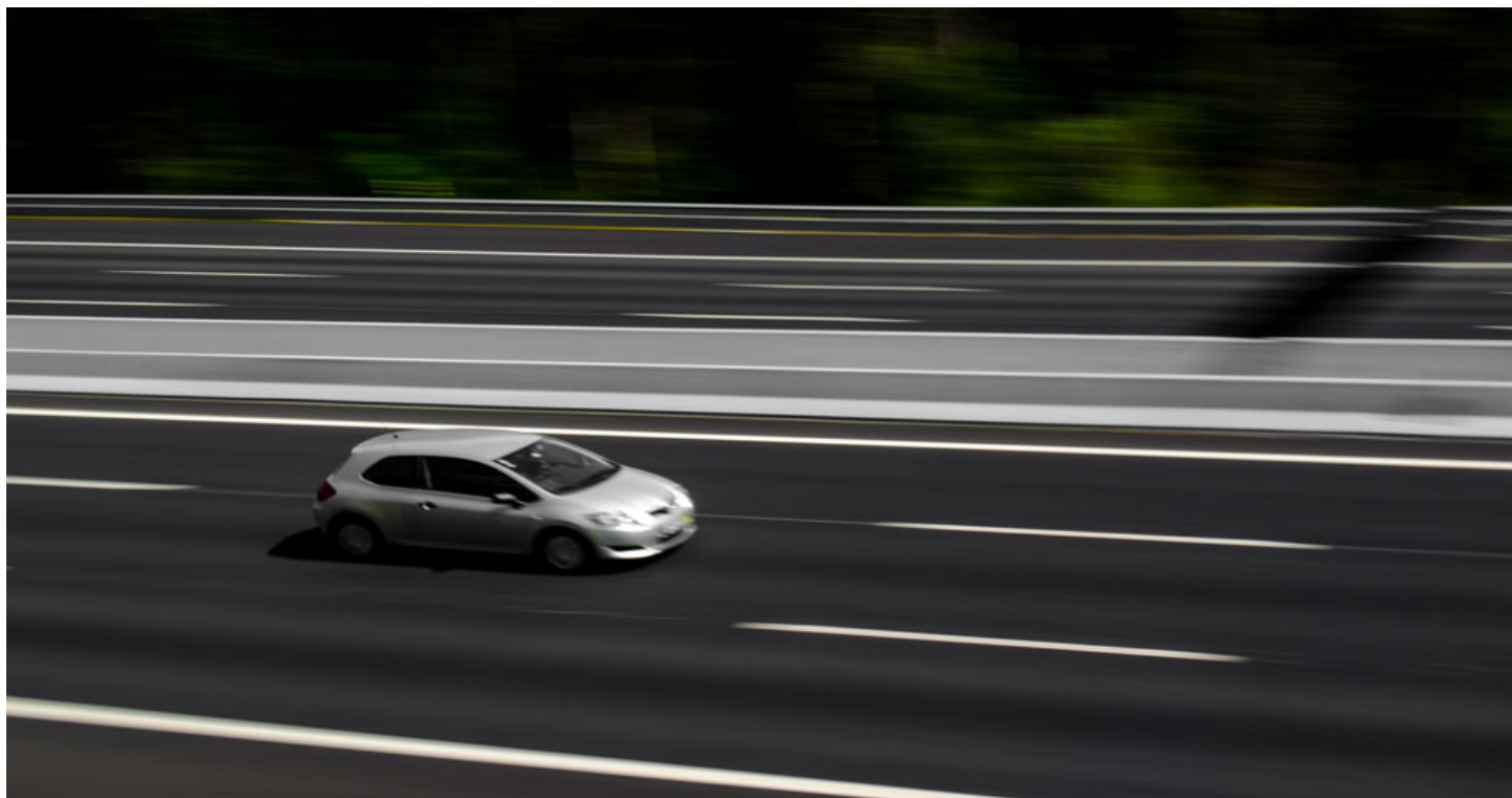
A3 Porto-Maia (Motorway)