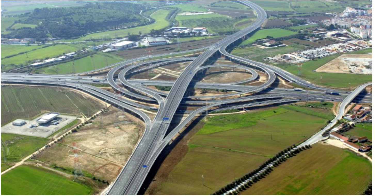
Junction in Carregado