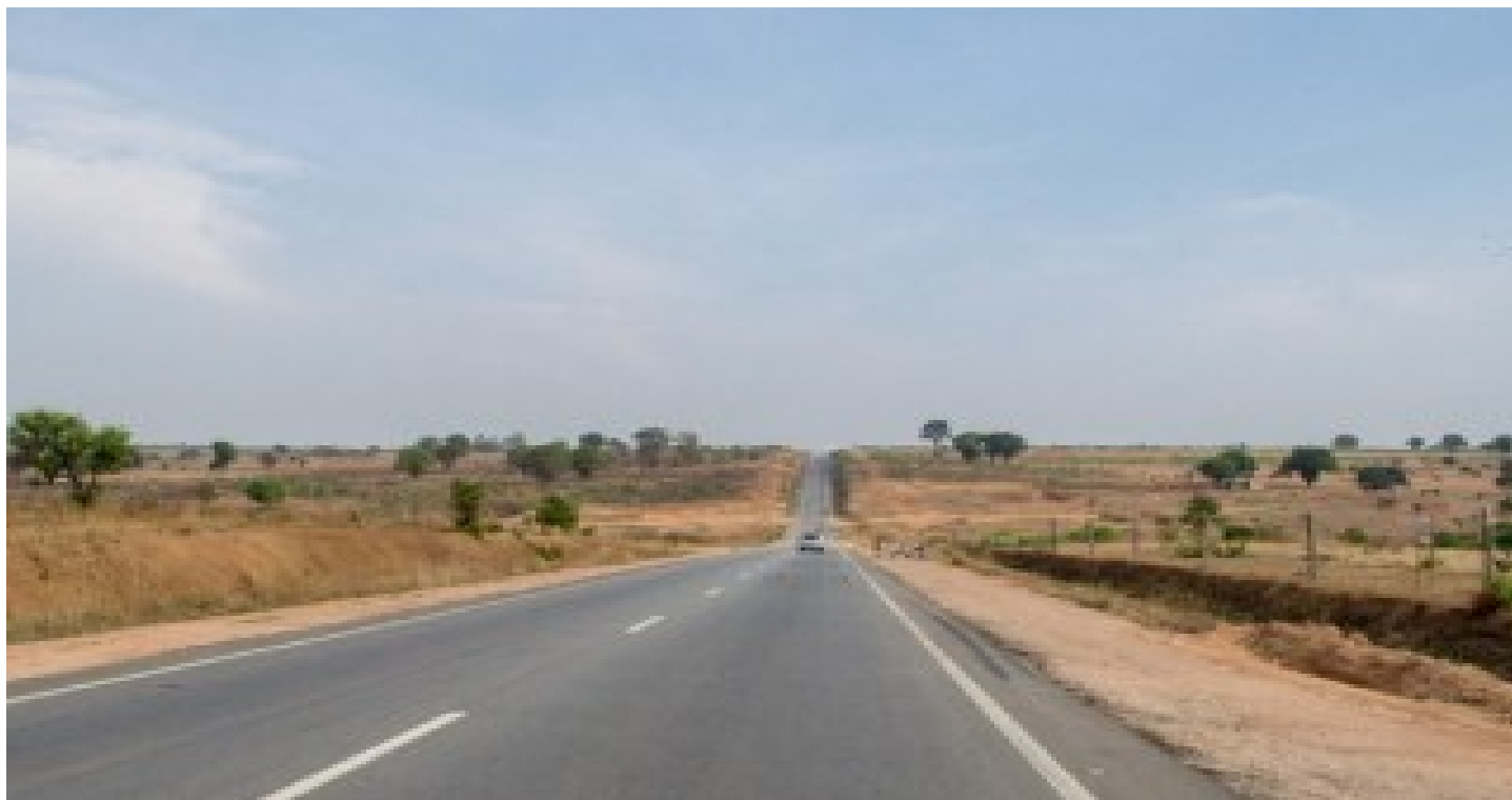
Huambo - Alta Hama Road