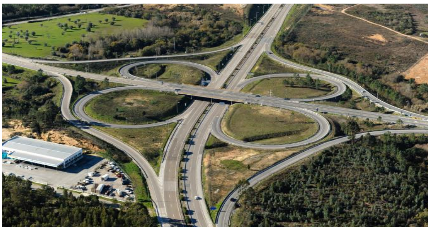
Pinhal Interior Subconcession