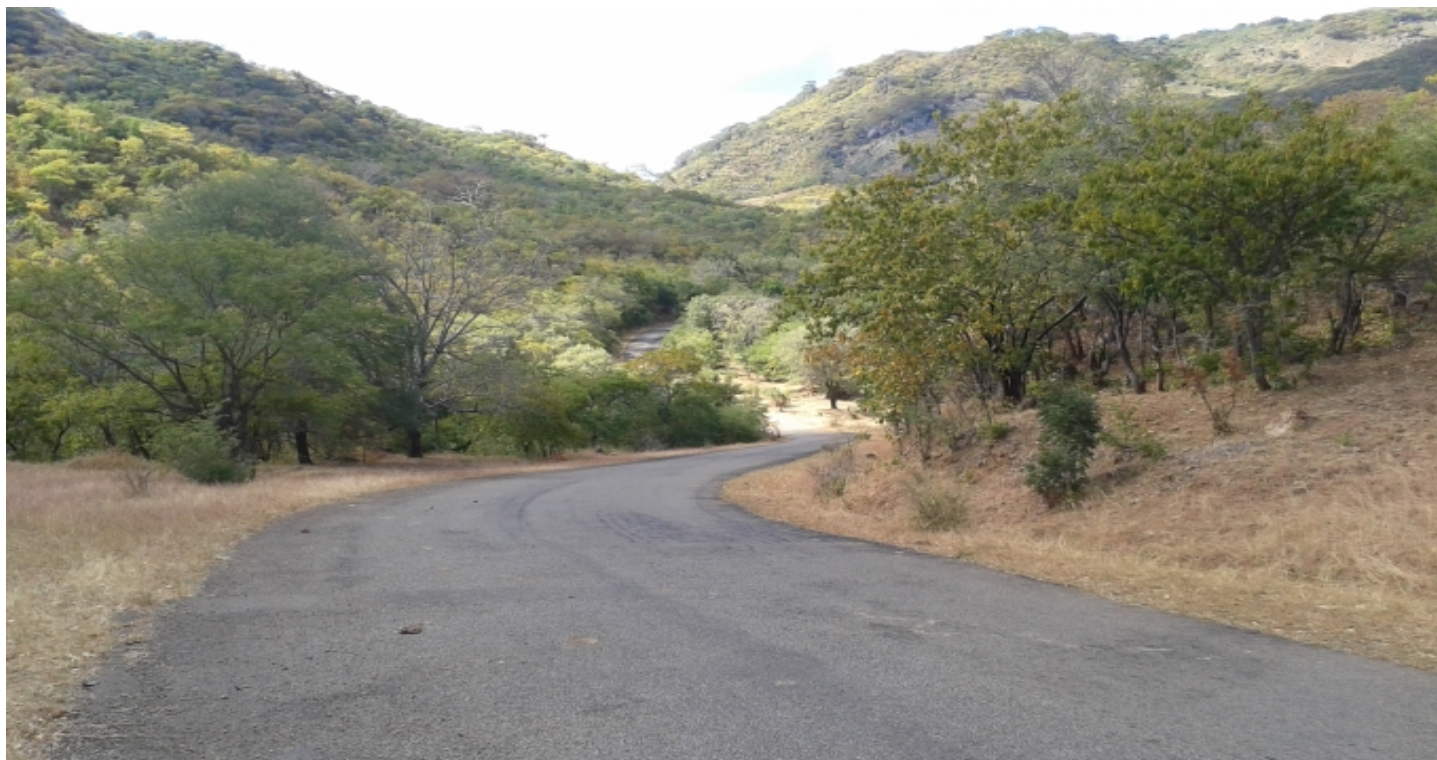
Road Magoé/Mucumbura and Road Estima/Maraoeira