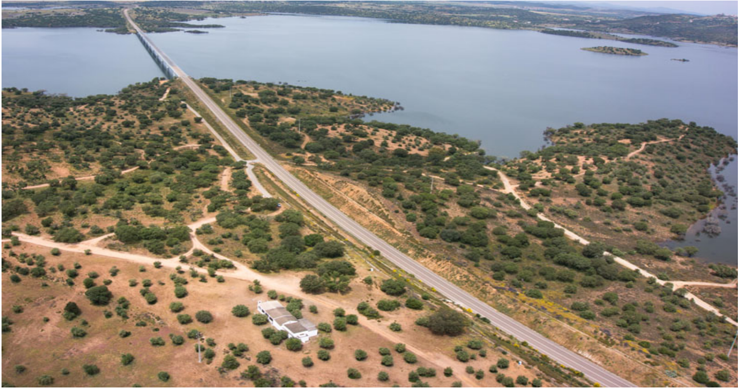
Alqueva Road Network