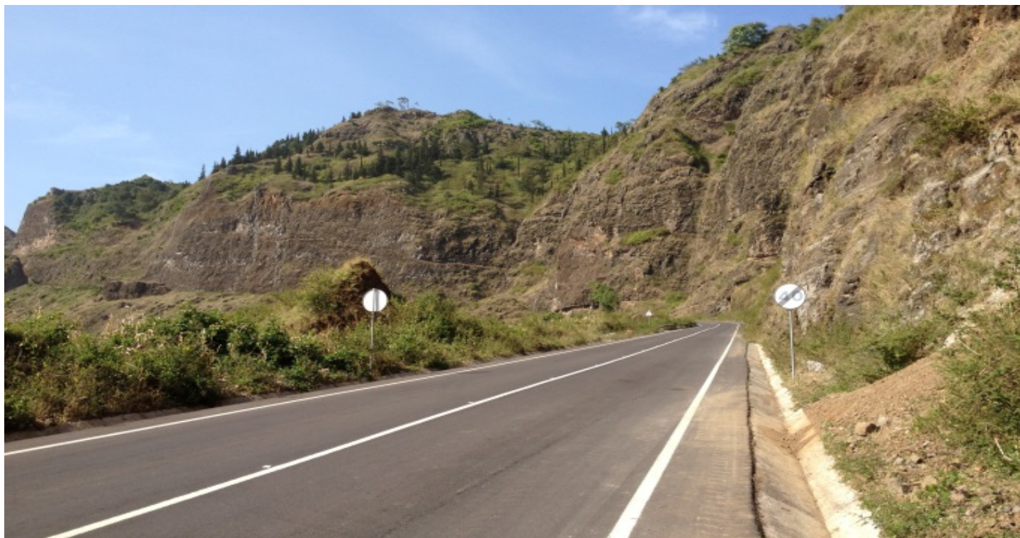
Asphalting of the Assomada / Tarrafal Road