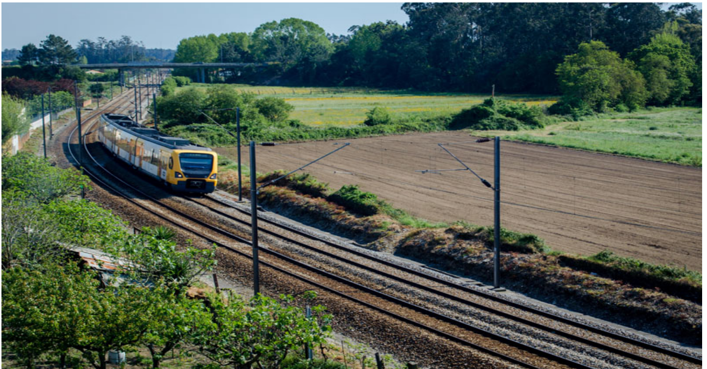
Northern Railway Line