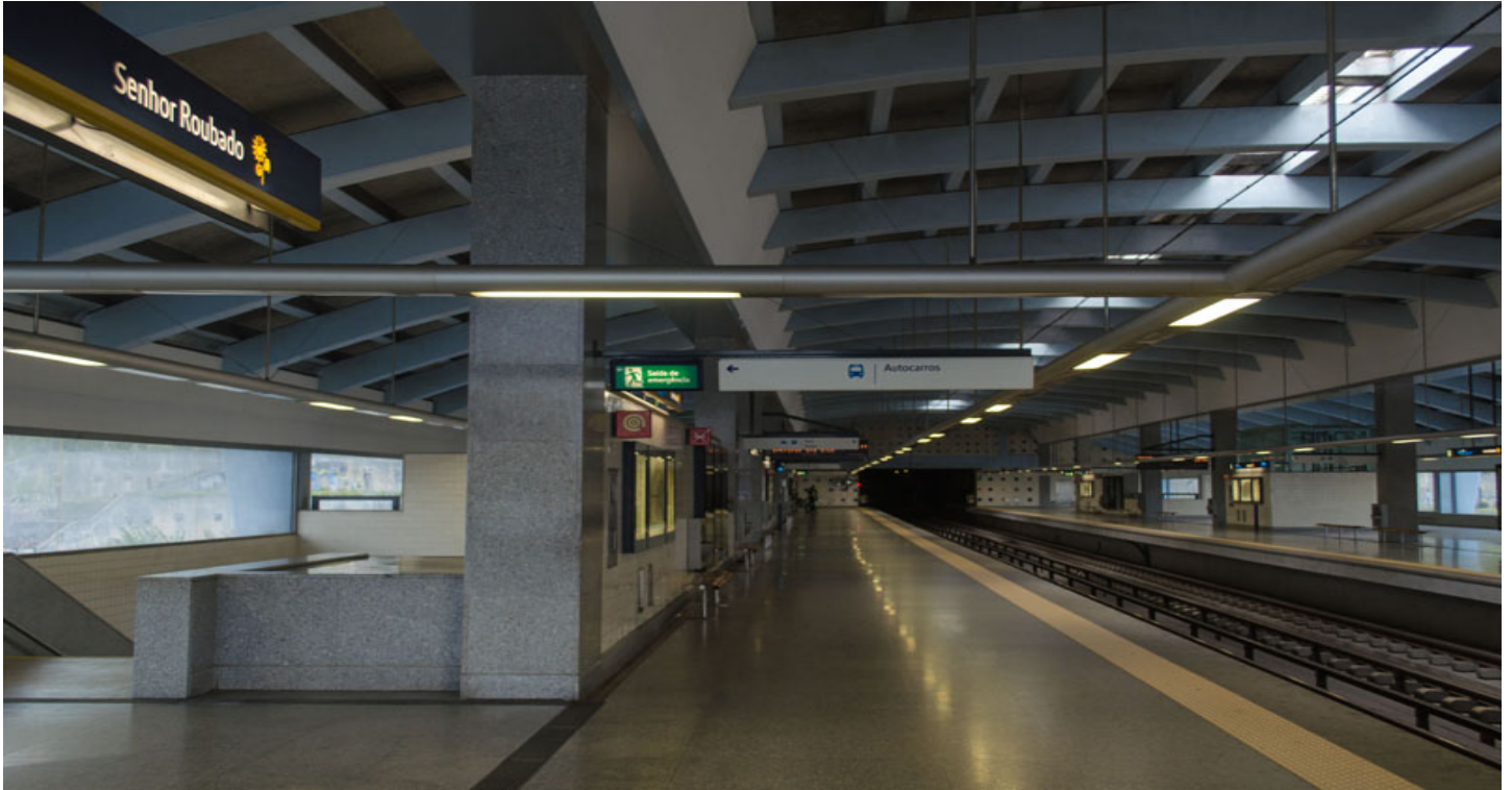
Lisbon Metro - Yellow Line