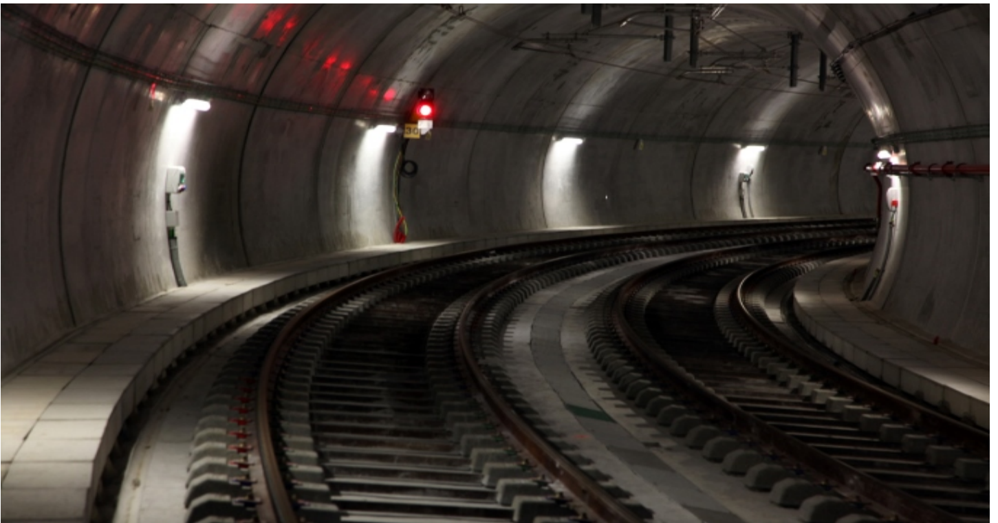
Construction of the Gondomar line