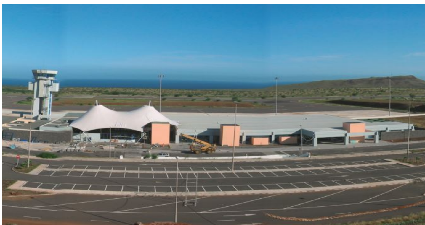
Praia International Airport