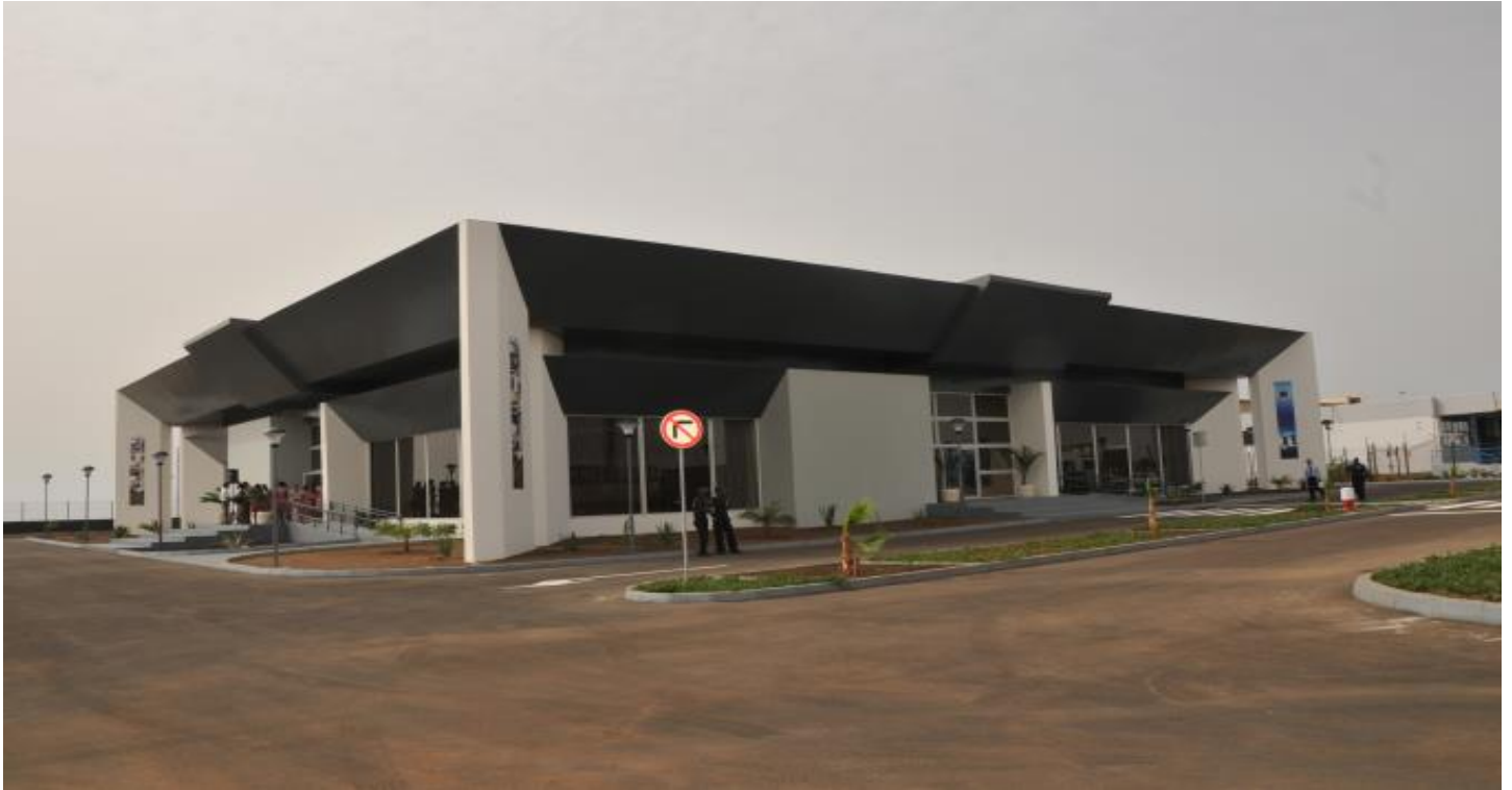
VIP Terminal and Expansion of the Parking Lot of the Praia Airport