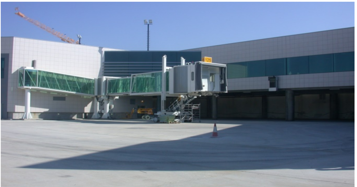
ALS - New North Pier