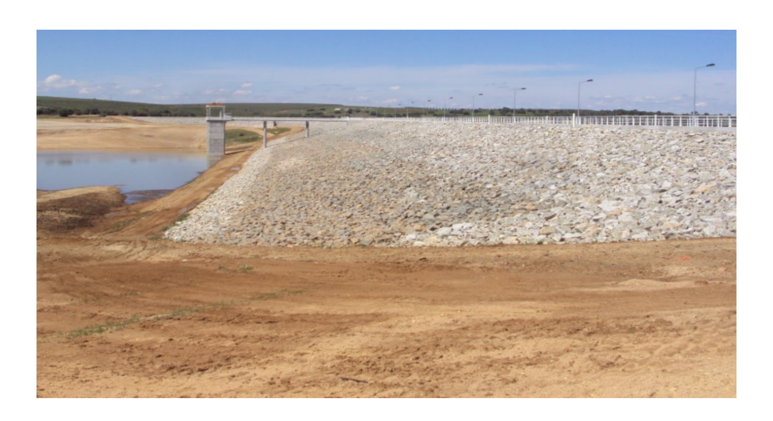
St. Peter's Dam and Pedrógão Aqueduct