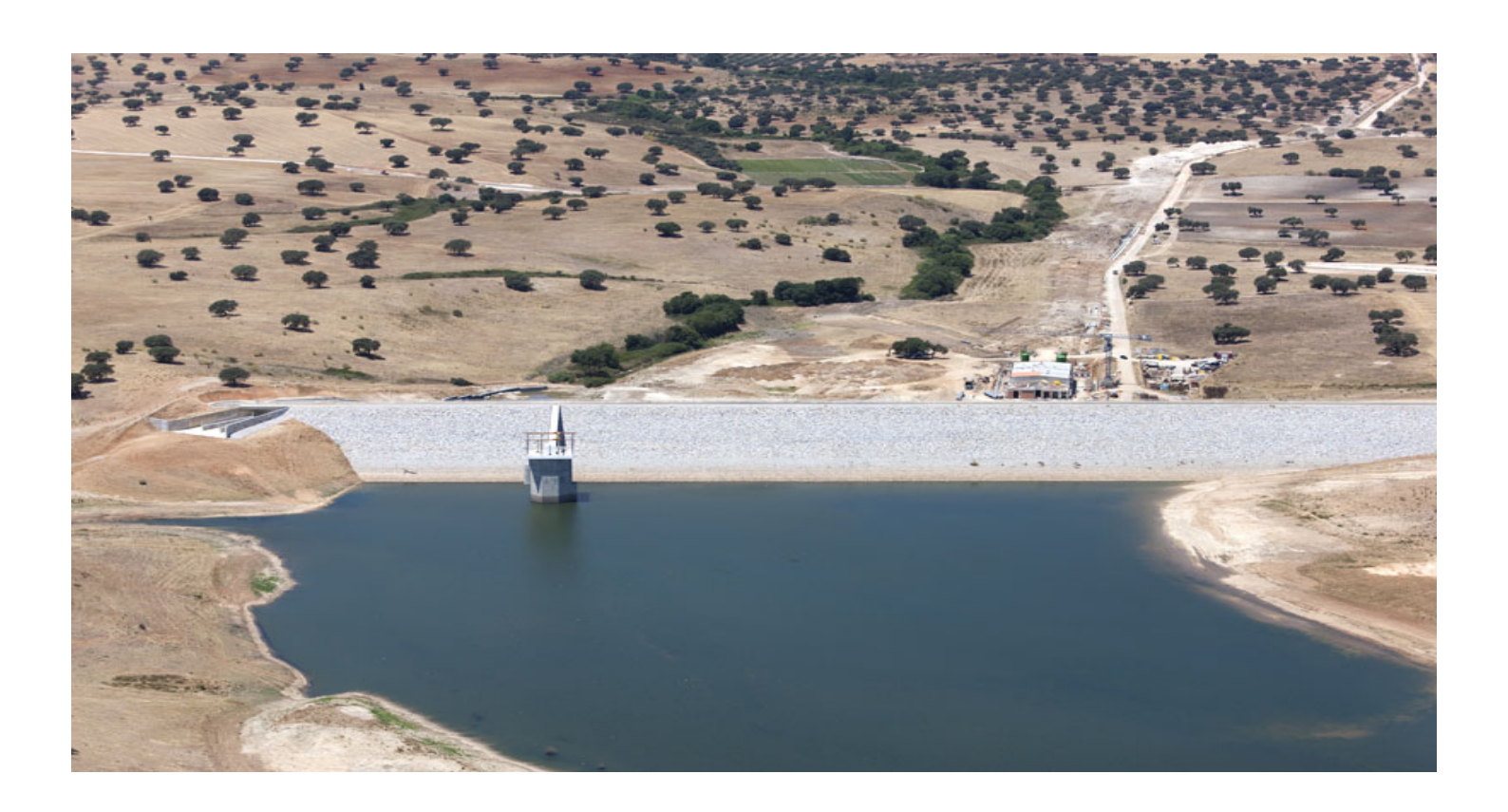
Amoreira and Brinches Dams