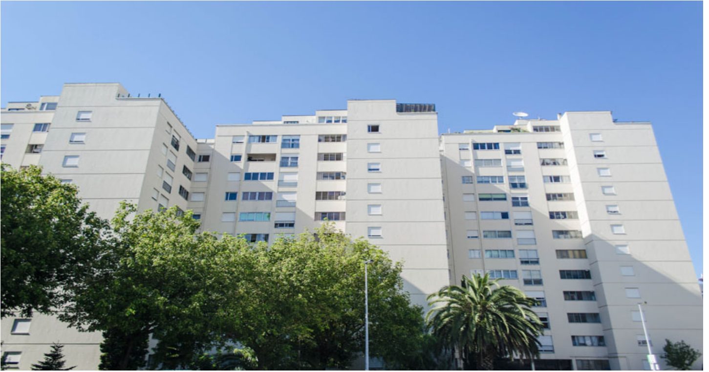
Empreendimento Santa Luzia (Development)