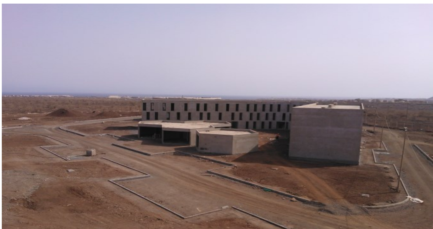
Casa Para Todos CPT - Palha Sé