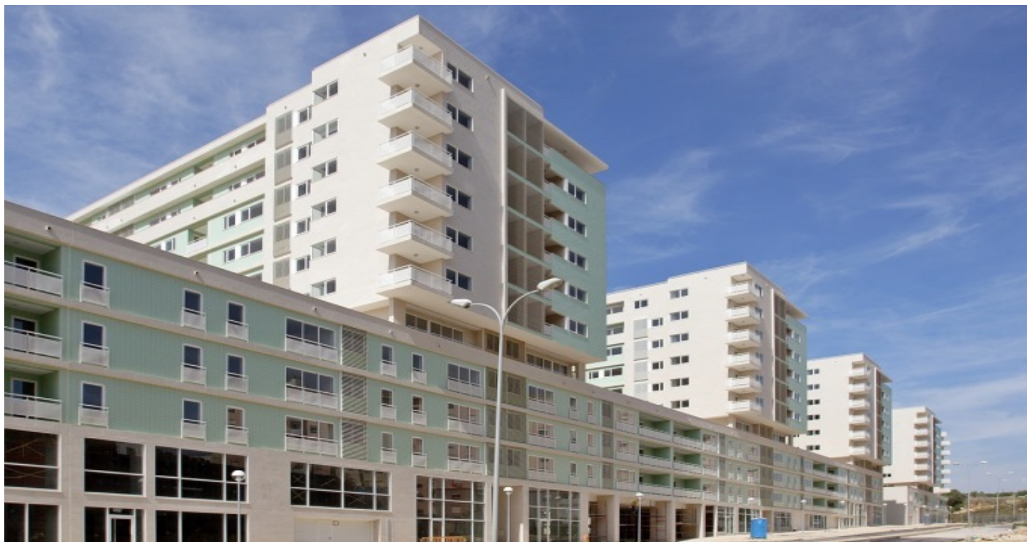
Colinas de São Gonçalo for SGAL