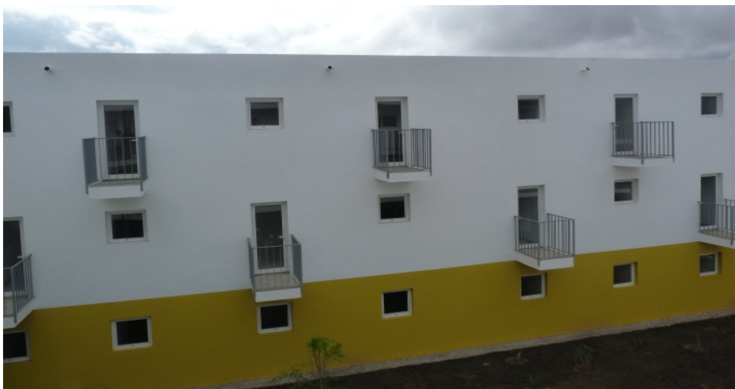
Casa Para Todos CPT – Tira Chapéu