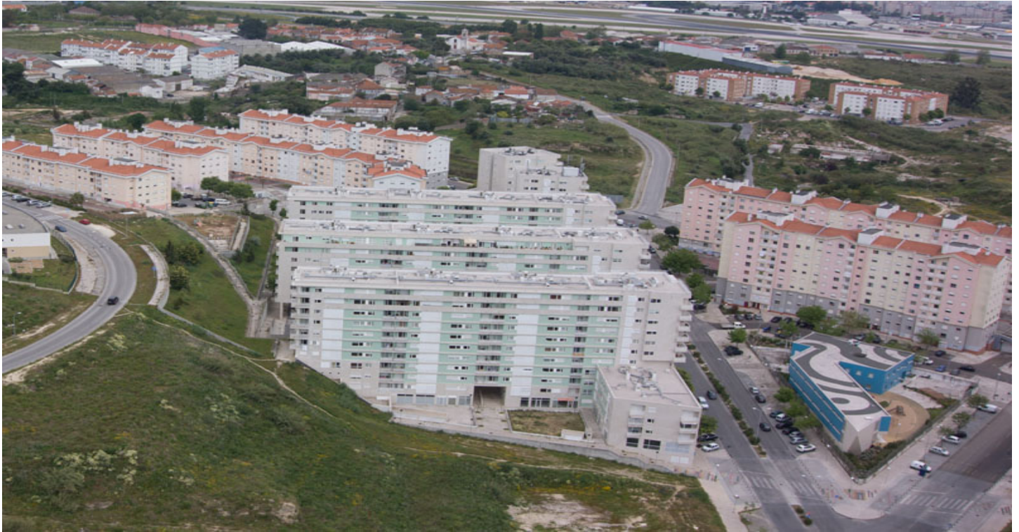
Alto do Lumiar (Development)