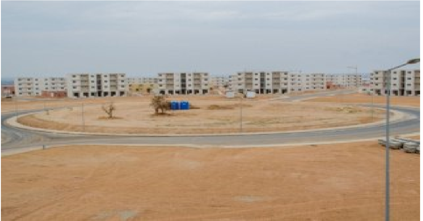
KORA Huambo Infrastructures