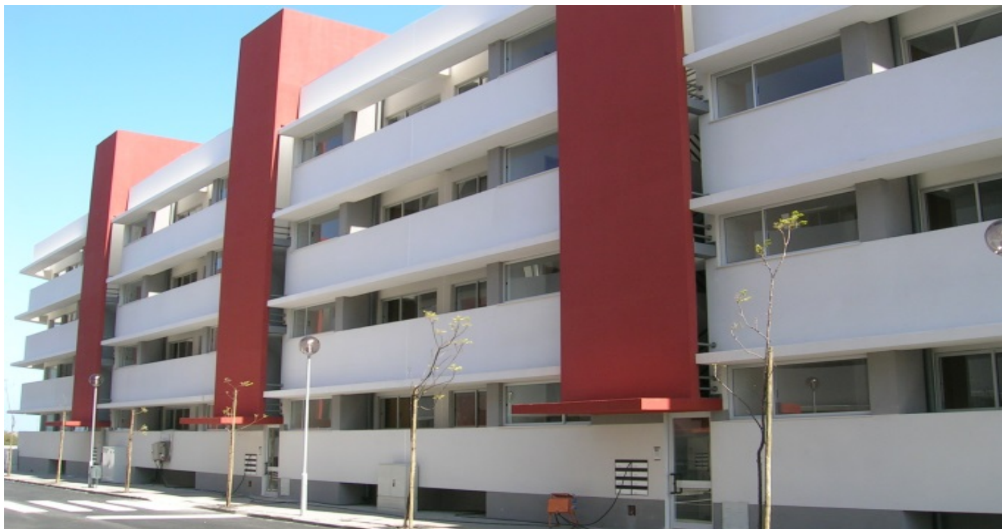
Bairro da Floresta