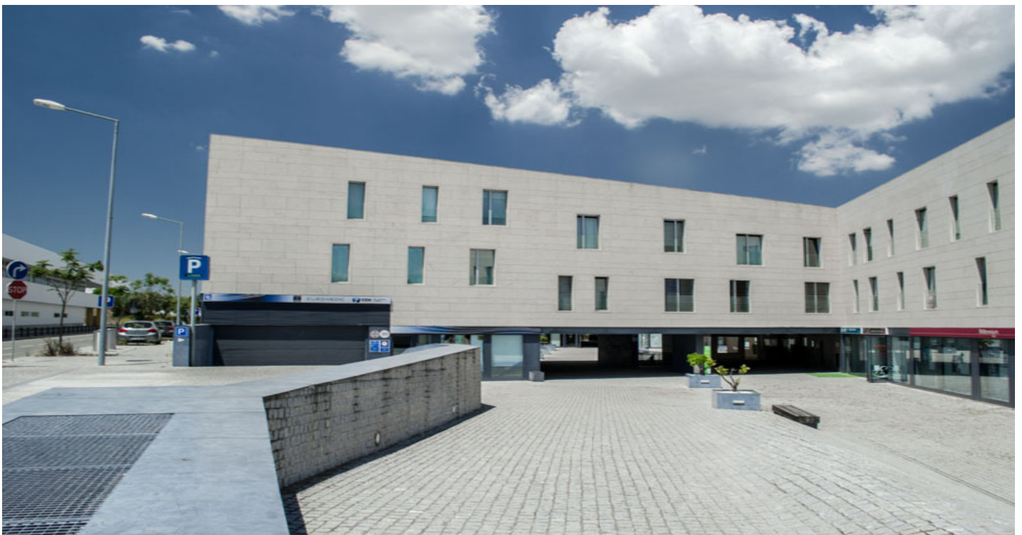
Horta dos Telhais (Controlled-cost Housing Development)