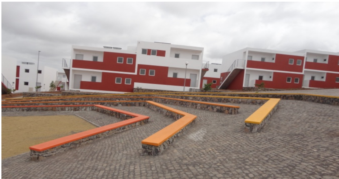
Casa Para Todos CPT – Santa Cruz