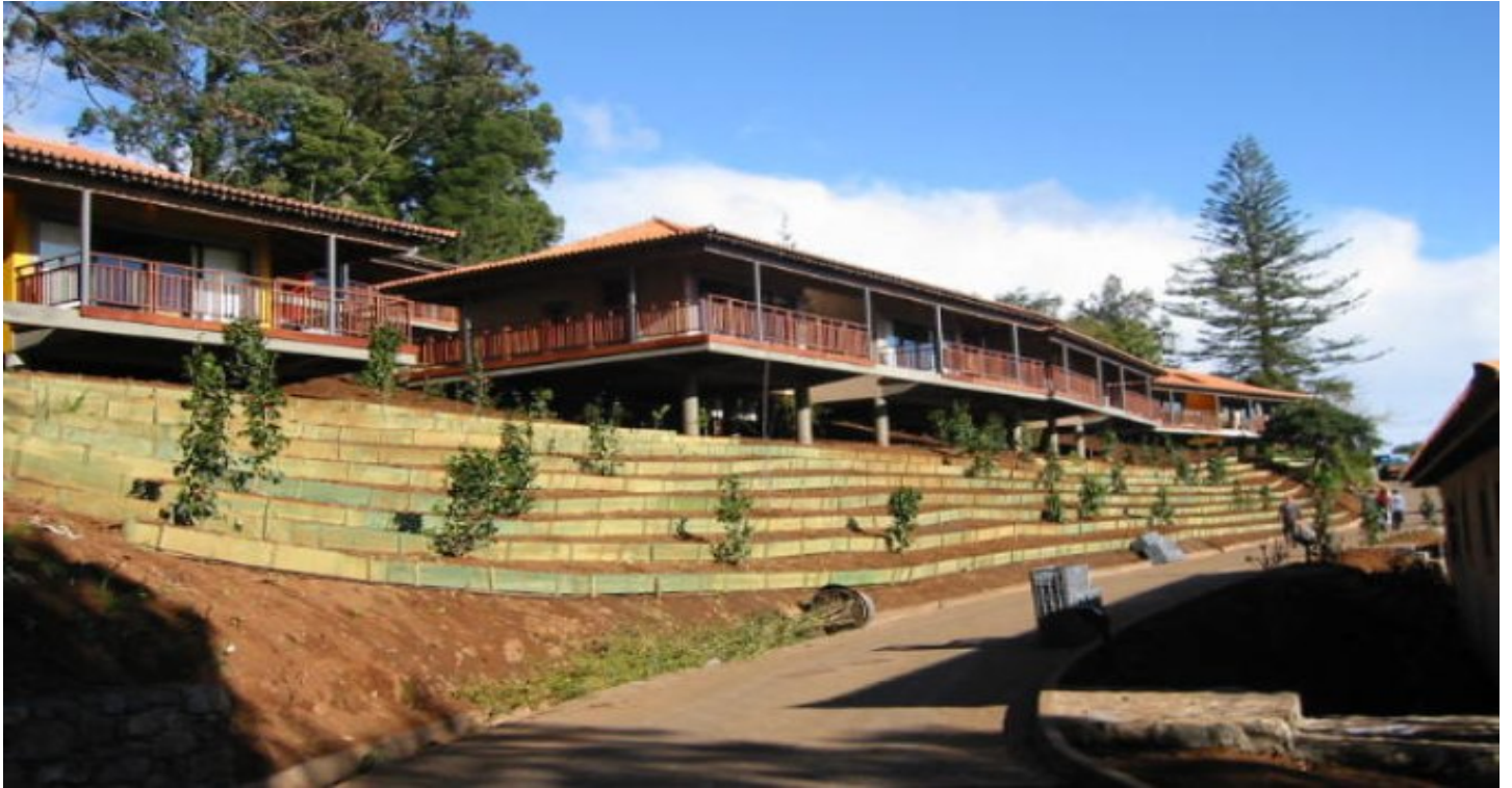
Choupana Hills Resort & SPA