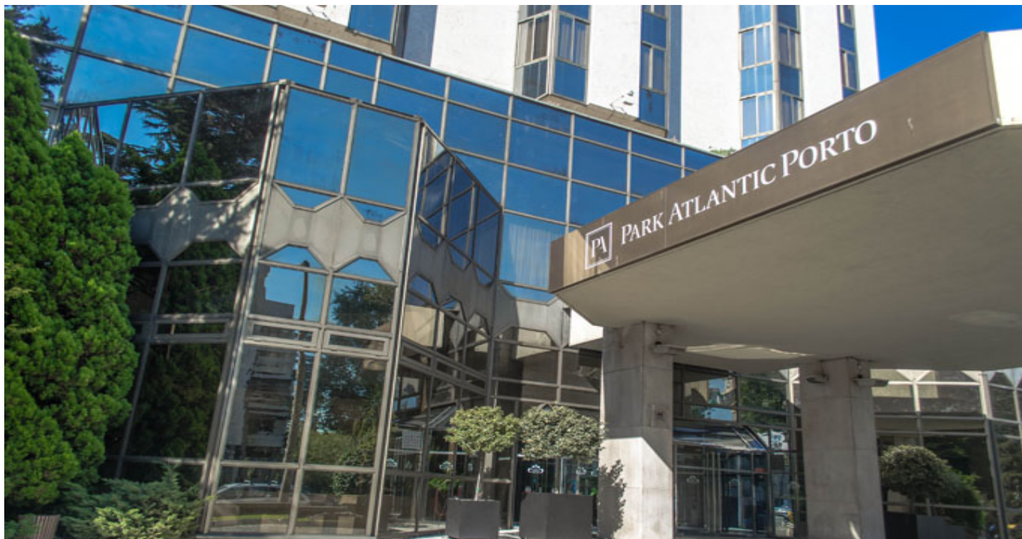
Tiara Park Atlantic Porto Hotel