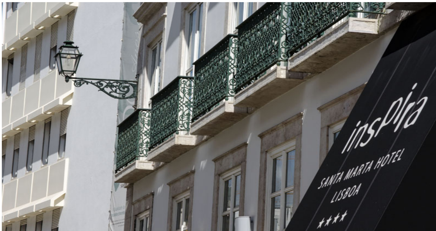
Inspira Santa Marta (Hotel)