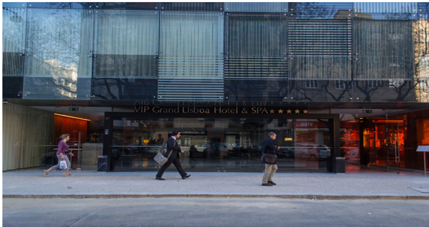
Vip Grand Hotel Lisbon