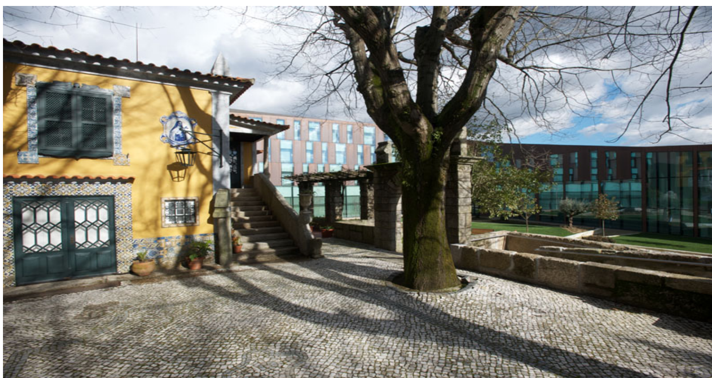
Sênior Camélia Hotel