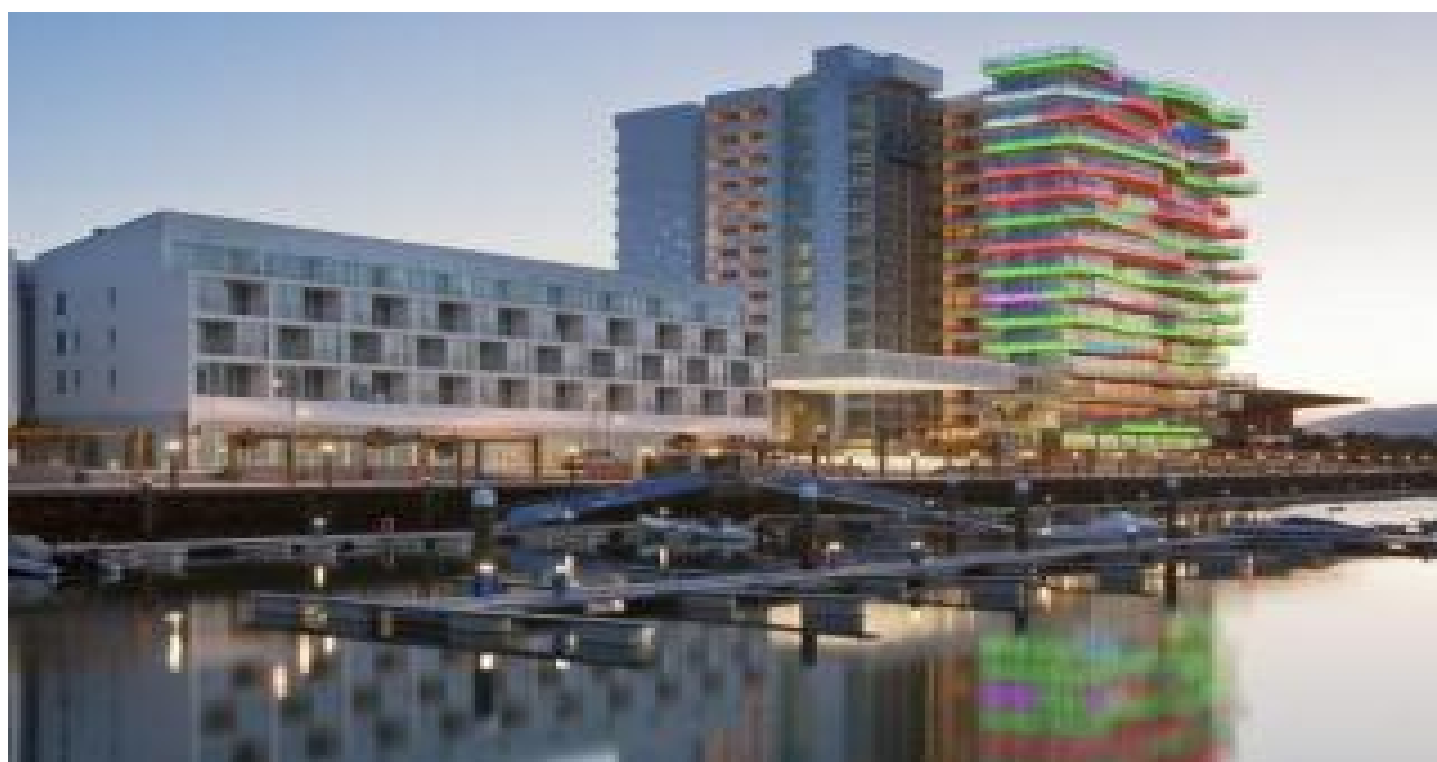
Troia Design Hotel