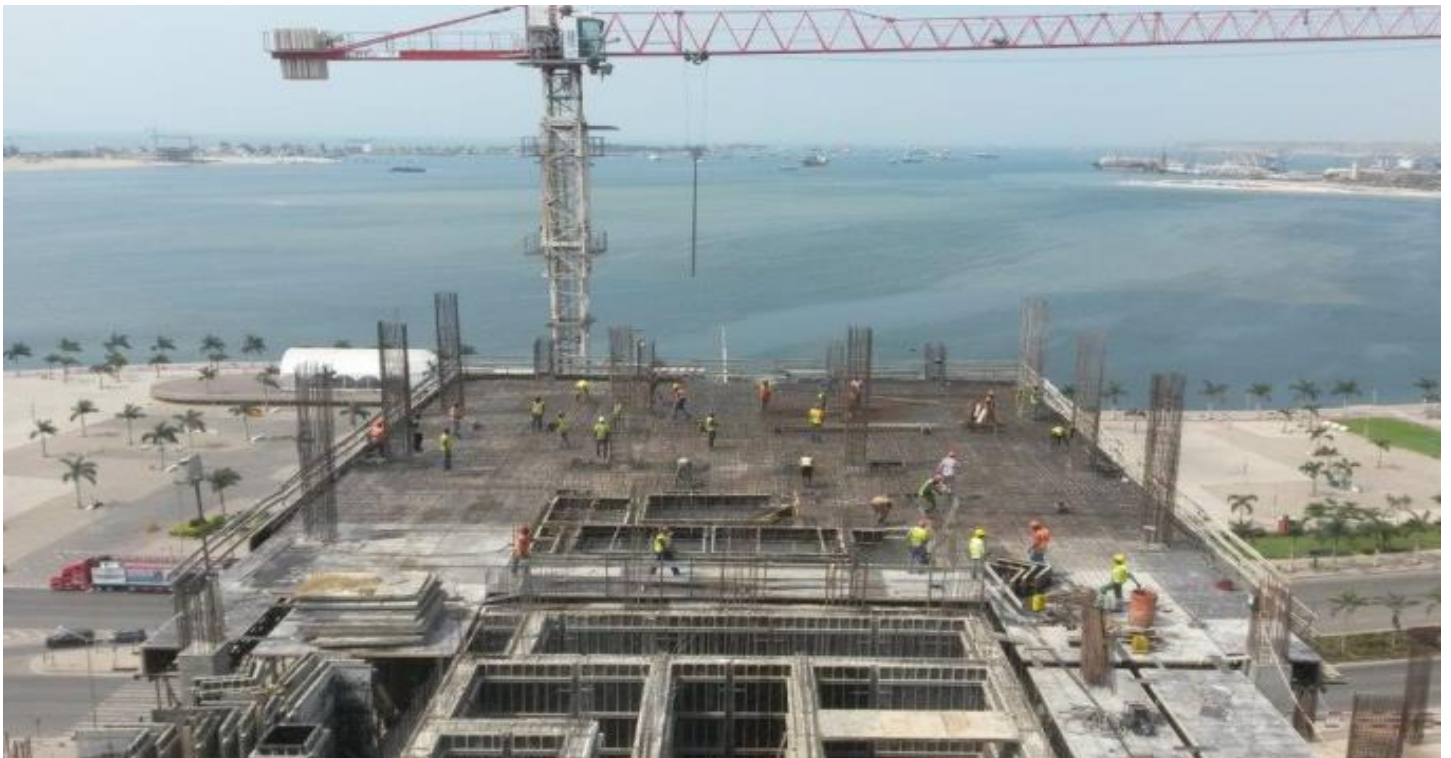
Tykhe Hotel-Sofitel (Edifer Angola)