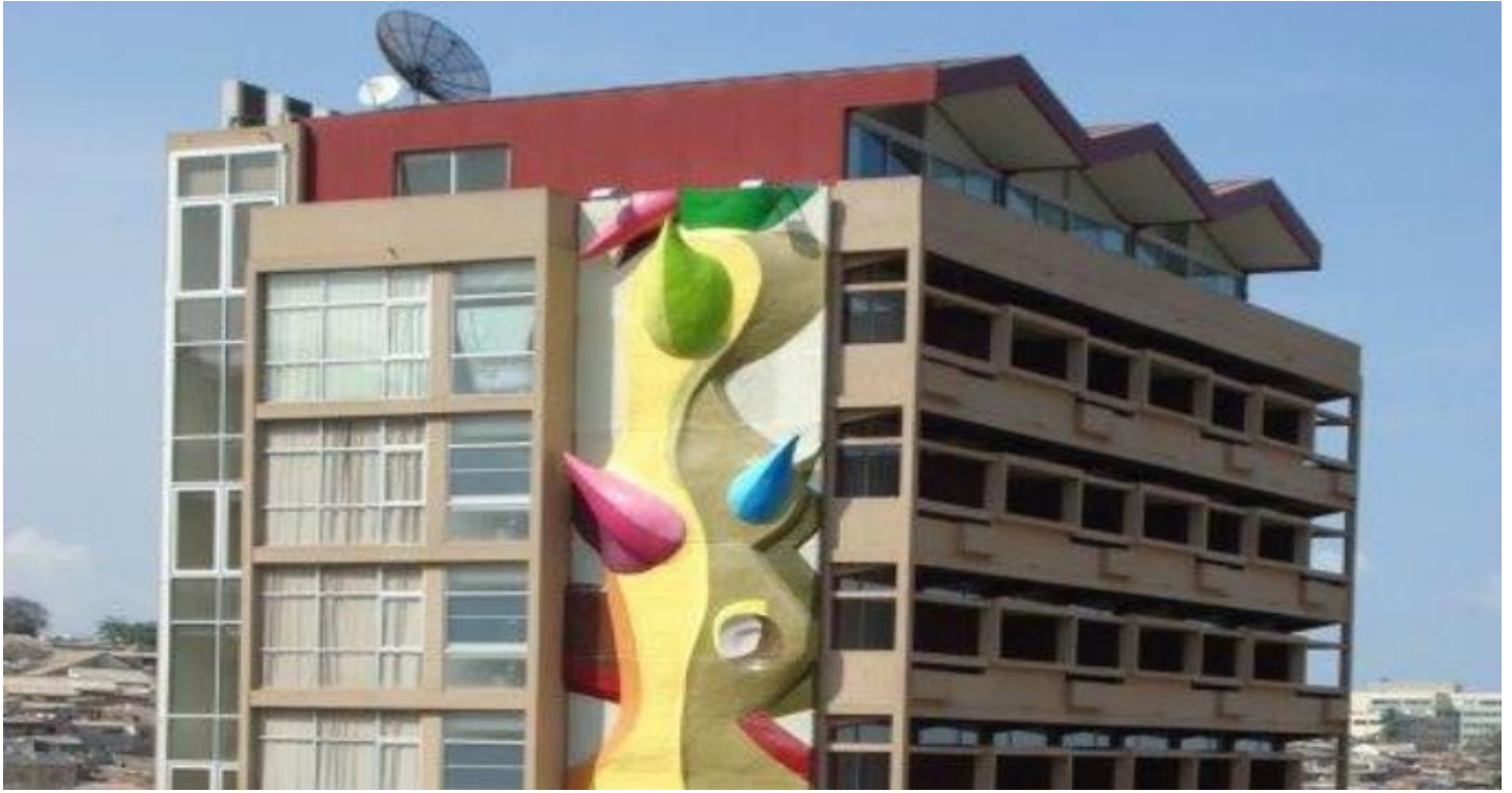
Refurbishment of Hotel Maianga (Edifer Angola)