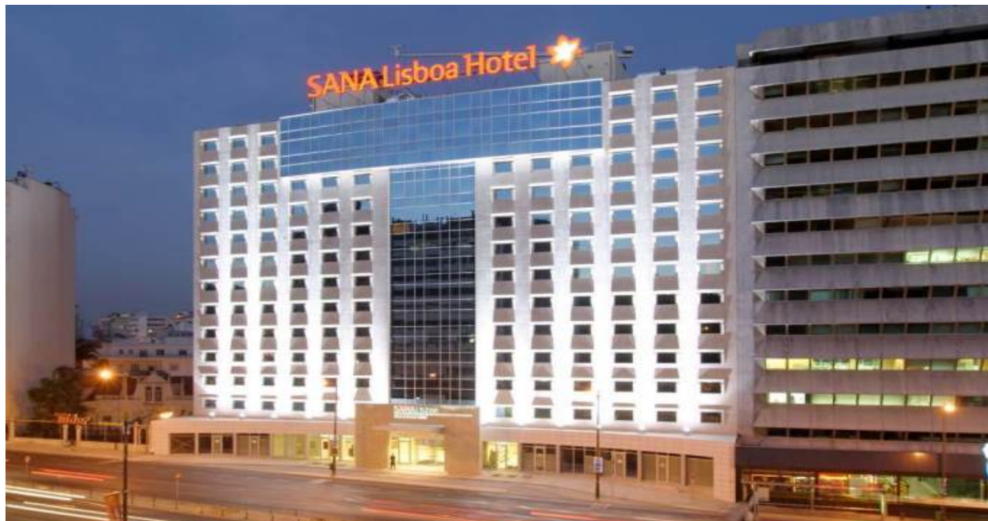
Sana Park Lisboa Hotel