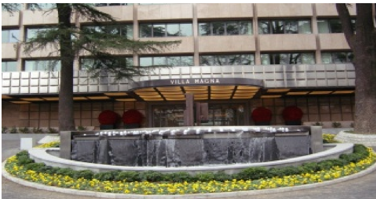
Villa Magna Hotel