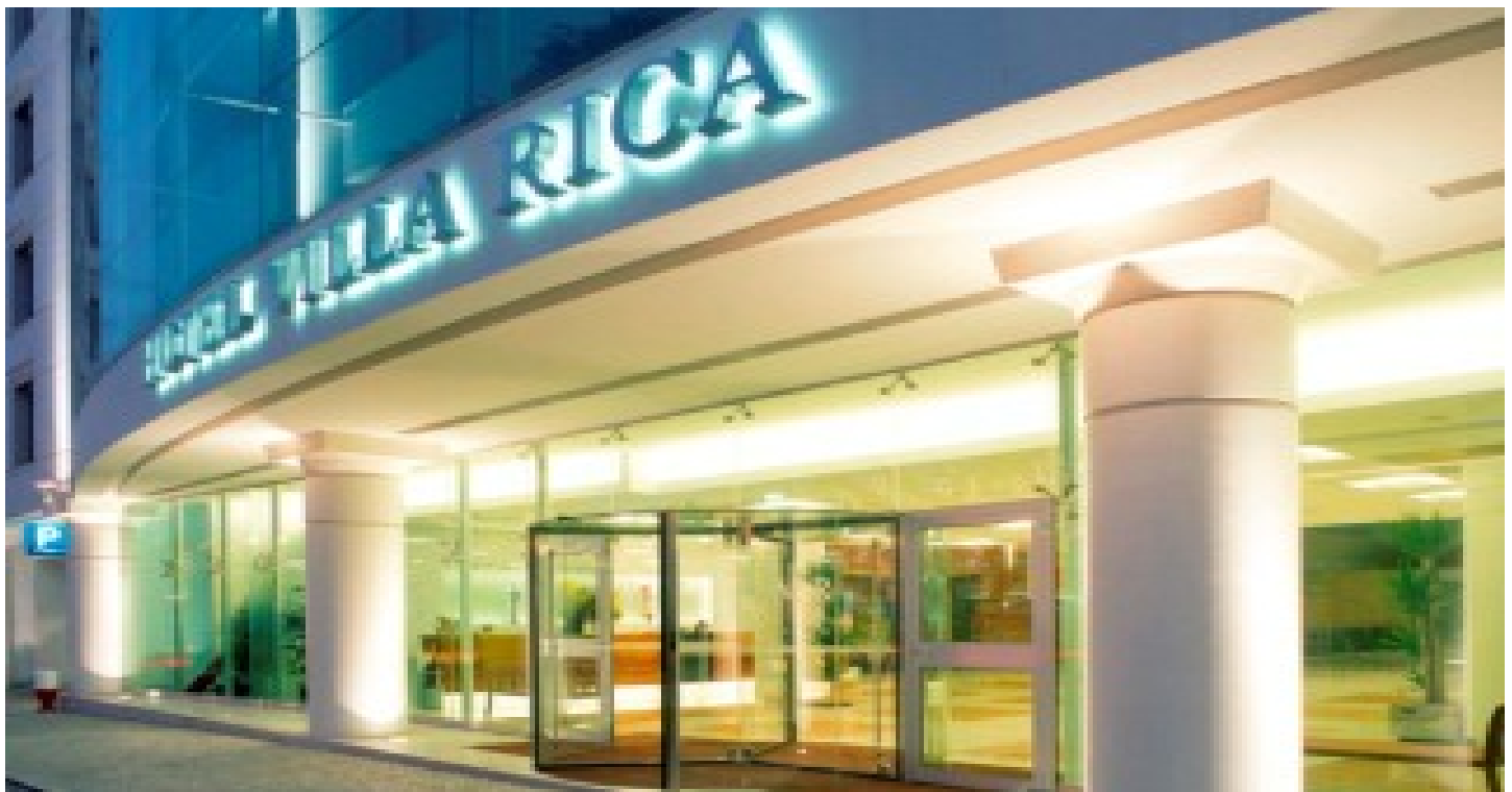
Villa Rica Hotel