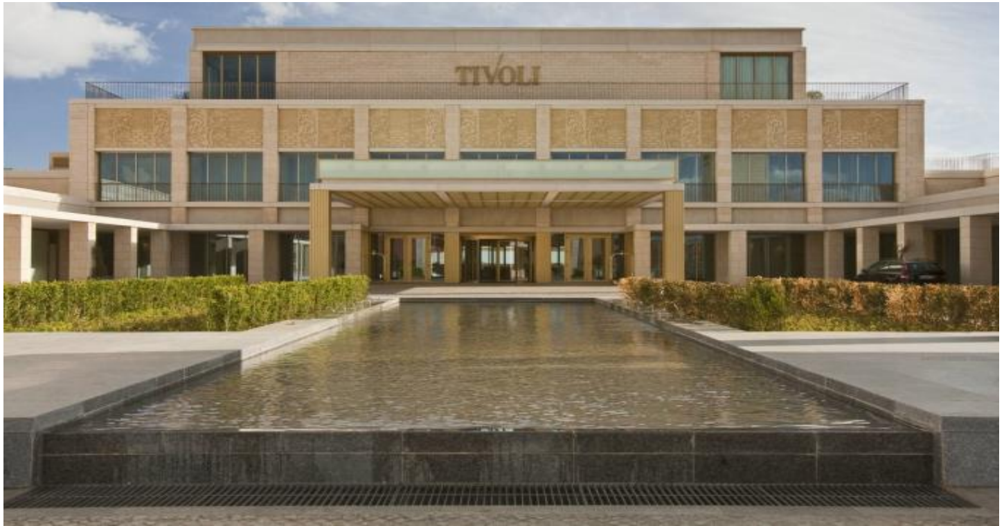
Tivoli Victoria Hotel