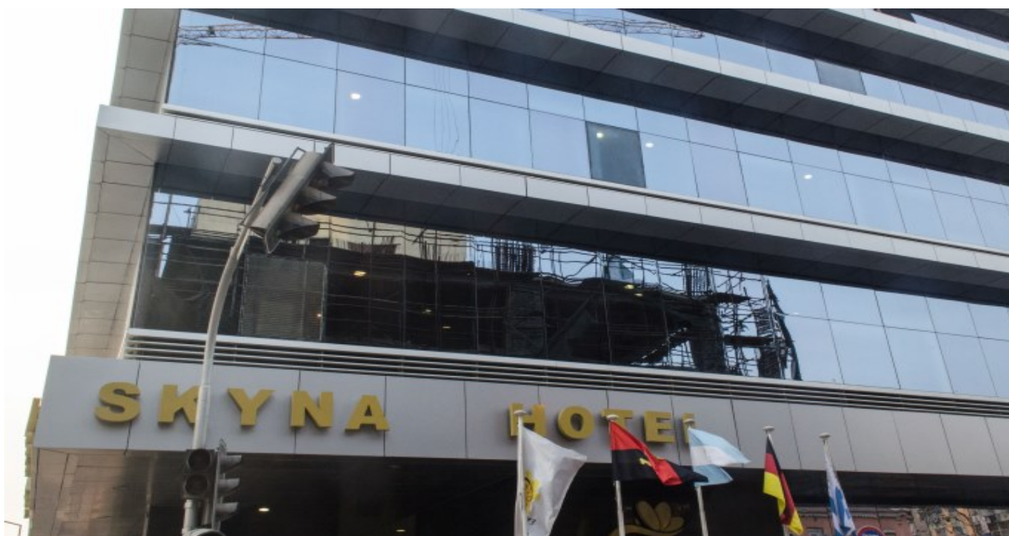
Skyna Hotel (Edifer Angola)