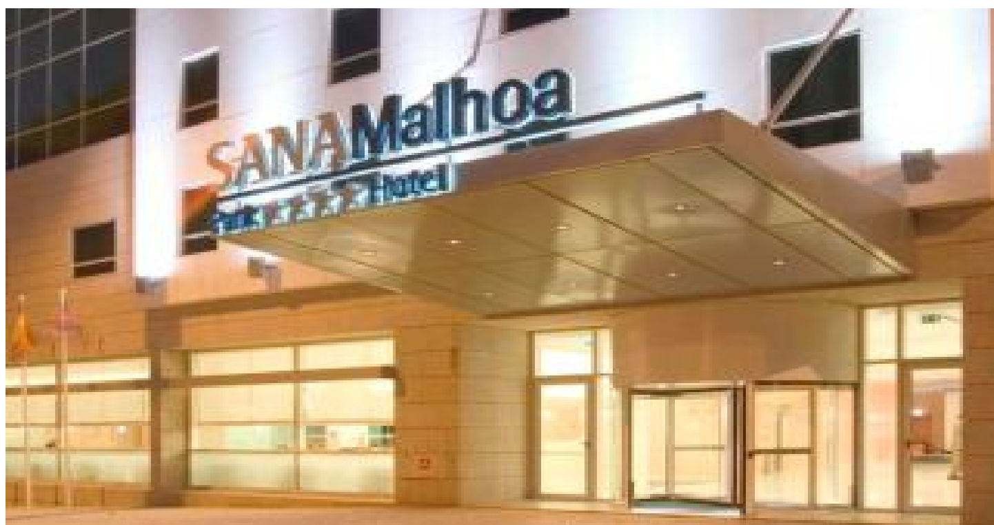
Sana Park Malhoa Hotel