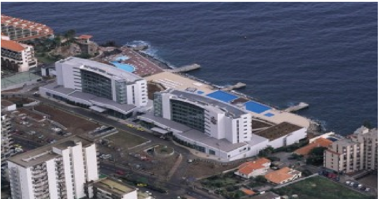
Crowne Plaza Resort Madeira