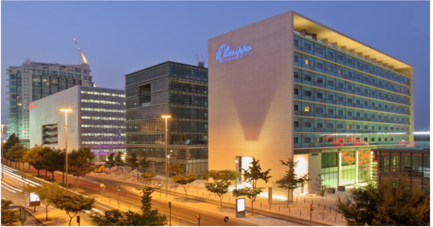
Olíssipo Oriente Hotel