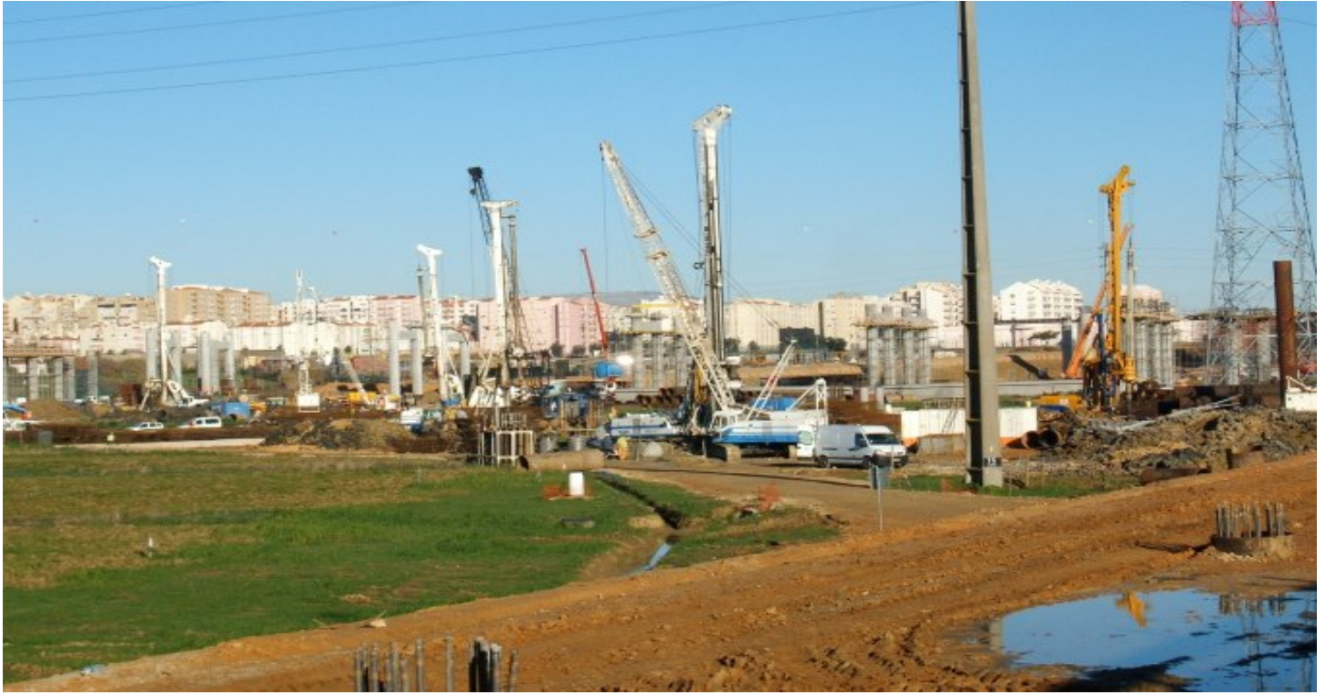
A10 - Carregado Interchange