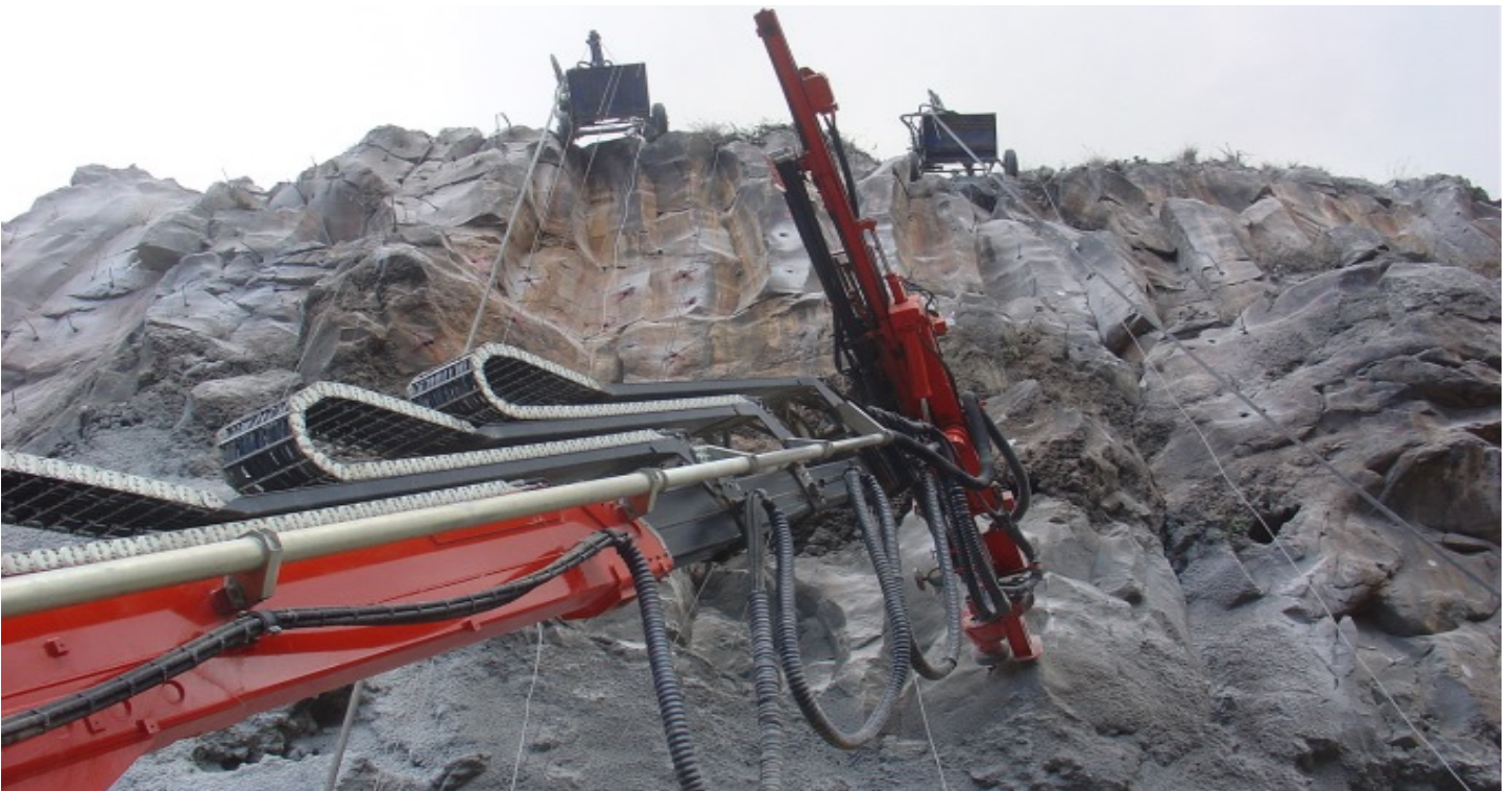
Peugeot Complex in Madeira