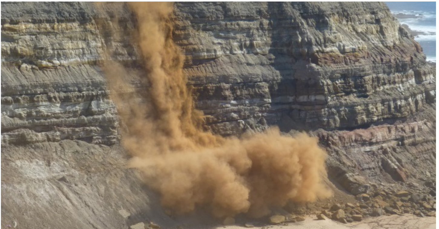
Stabilisation of an Escarpment at Praia da Calada