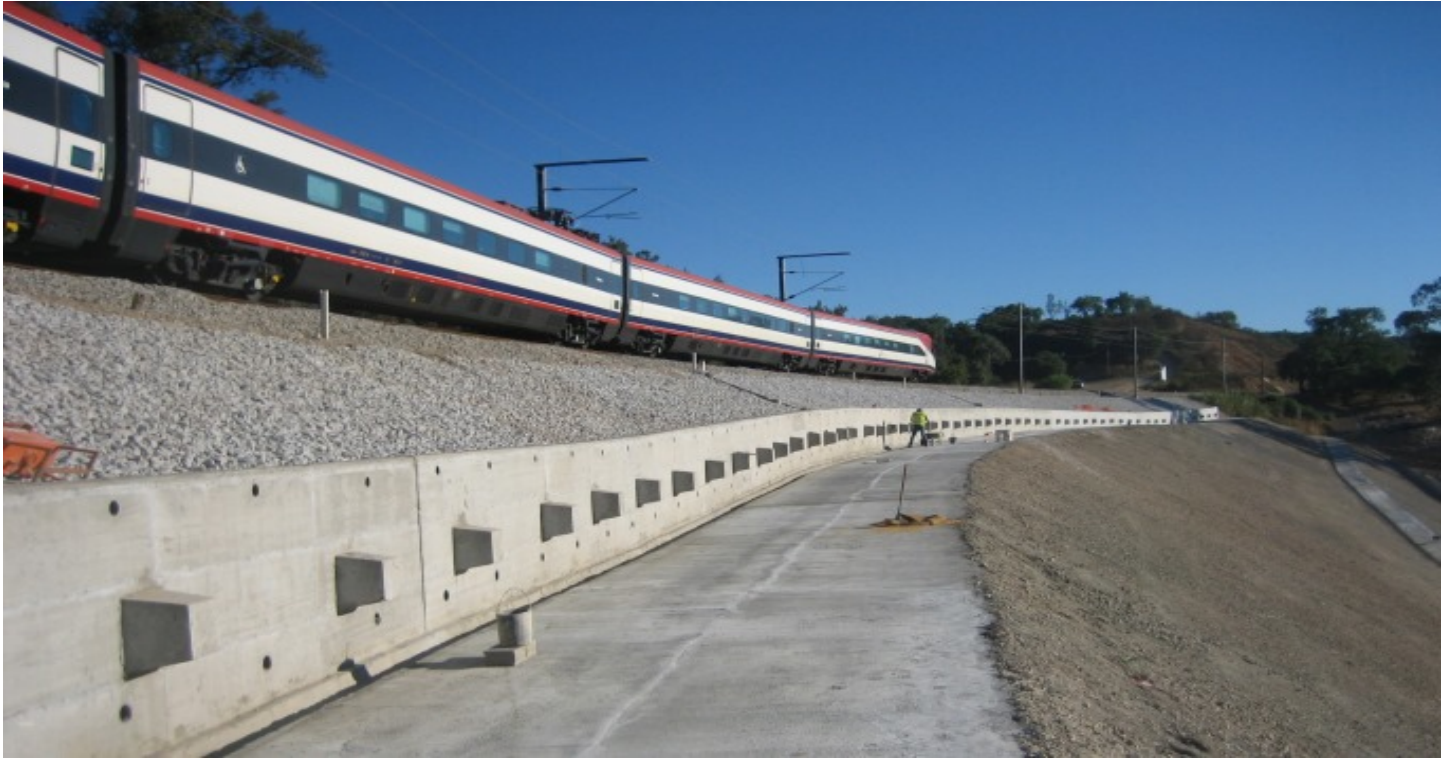
Southern railway line