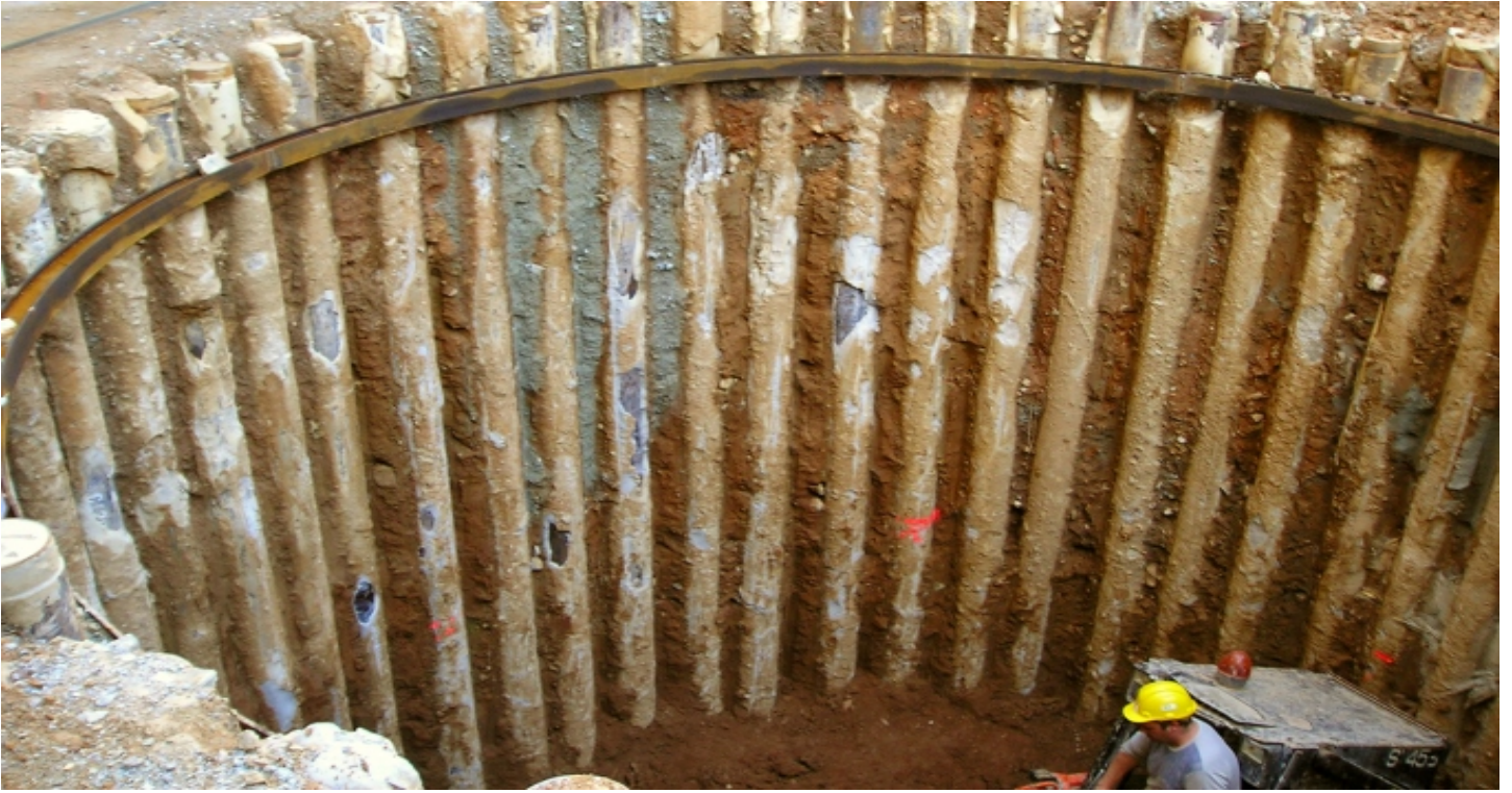
Barcelona Metro - Line 9