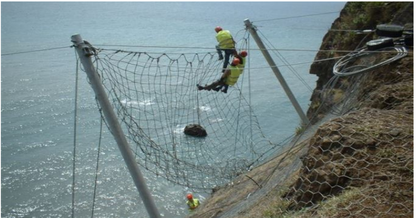
Madalena do Mar