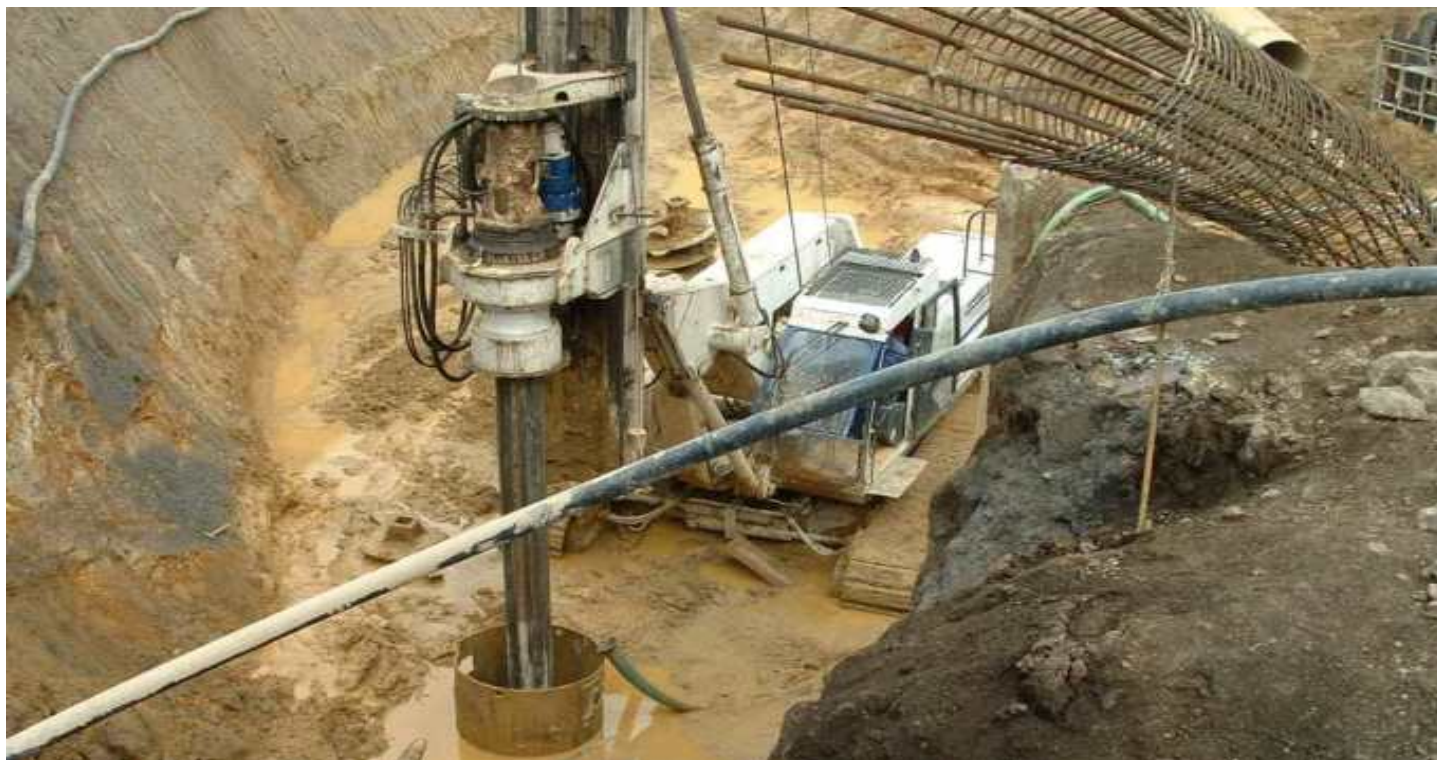
Braga Branch Line, Nine