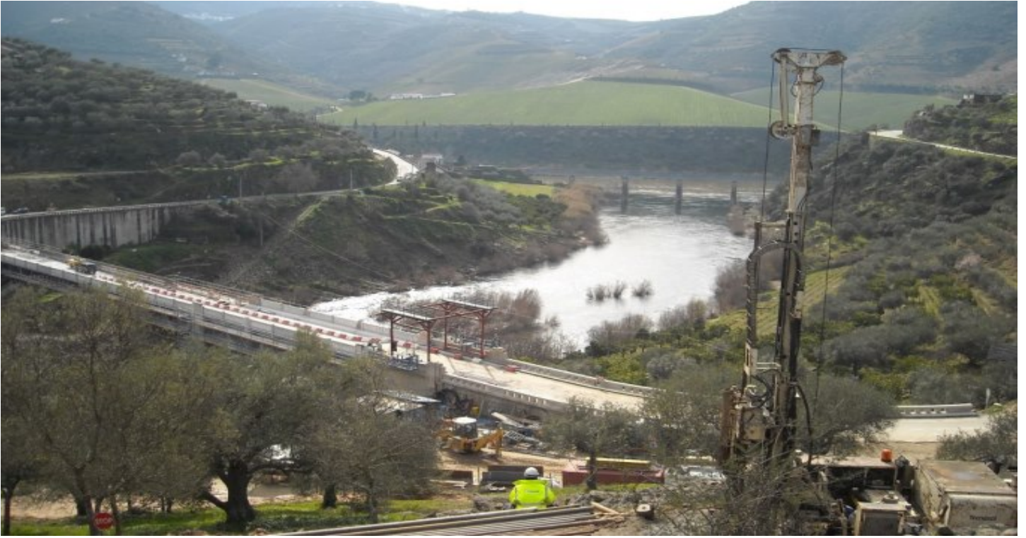
Foz Tua Dam