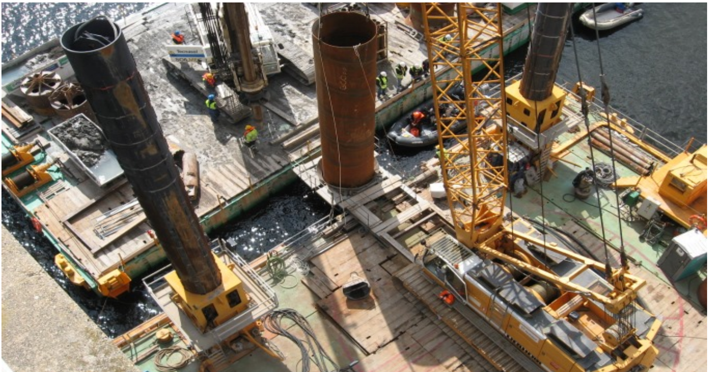
IP3 -New Dão River Bridge