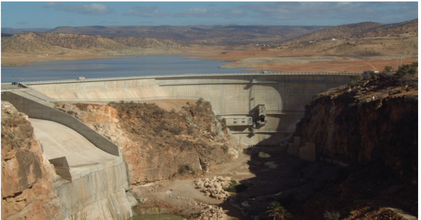
Ait Hammou Dam