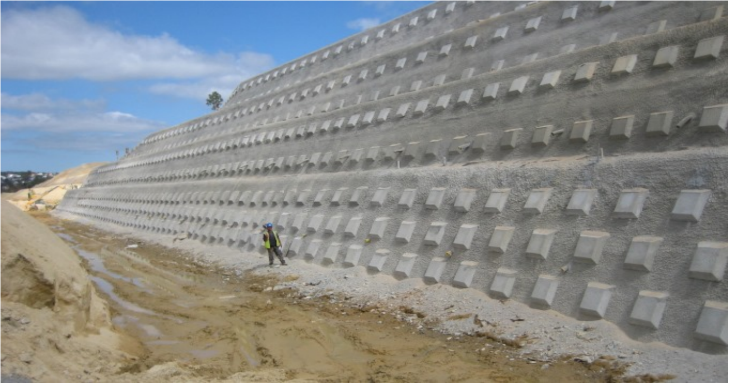
West Coast (Litoral Oeste) Concession