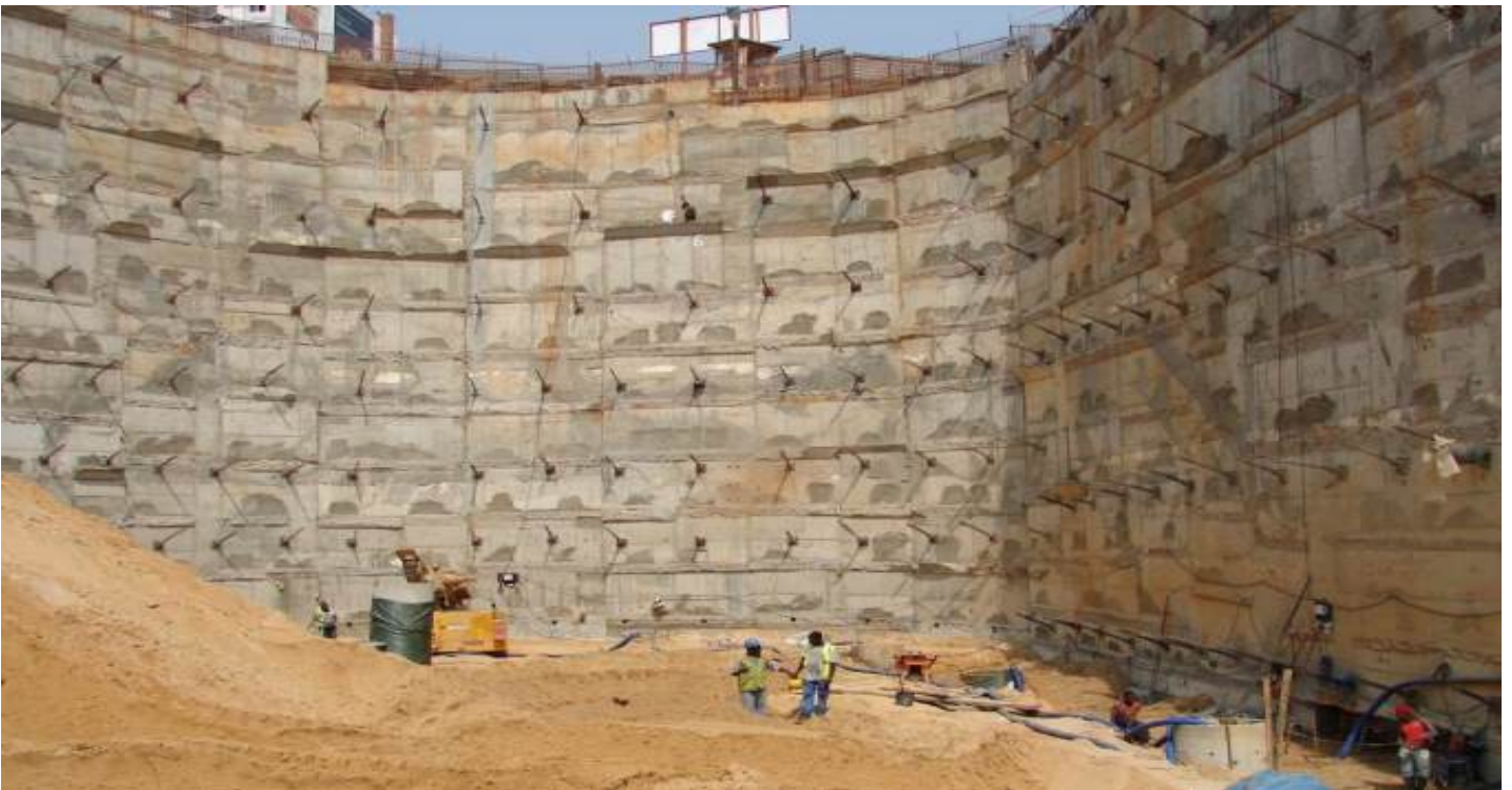
Sana Luanda Royal Hotel