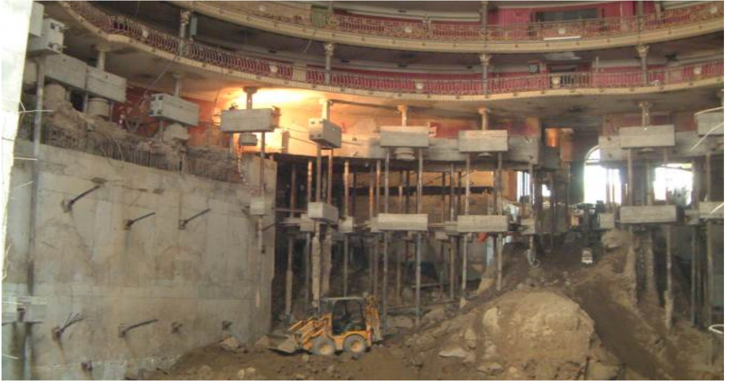
Refurbishment of the Circo Theatre in Braga