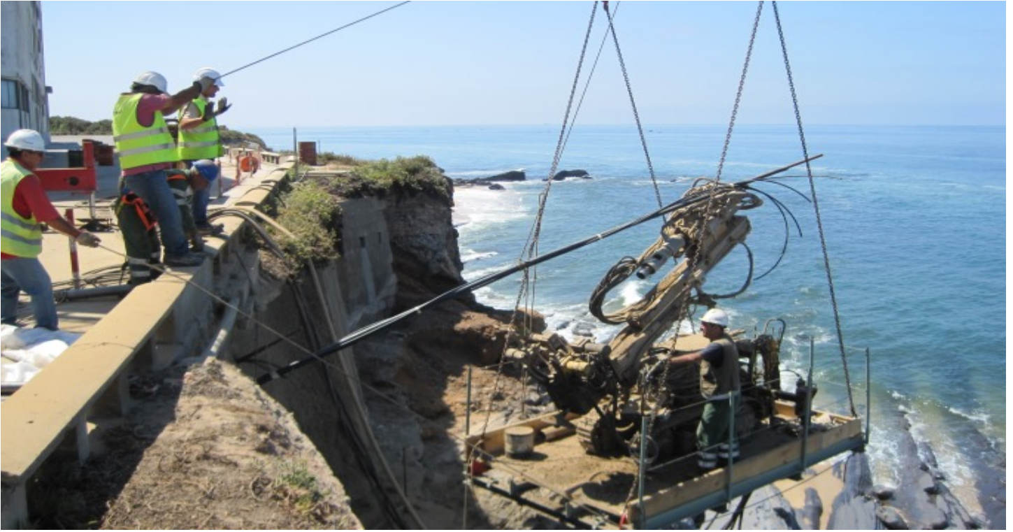
Containment at a Lime Factory