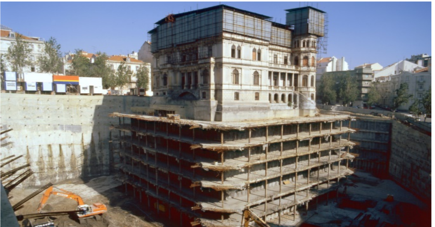
Sotto Mayor Palace