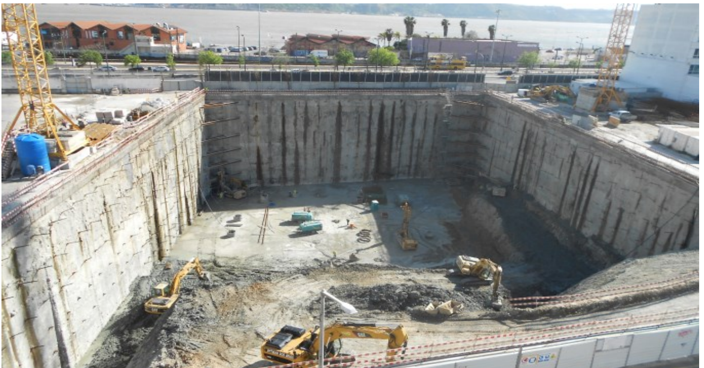
New EDP Head Offices in Lisbon