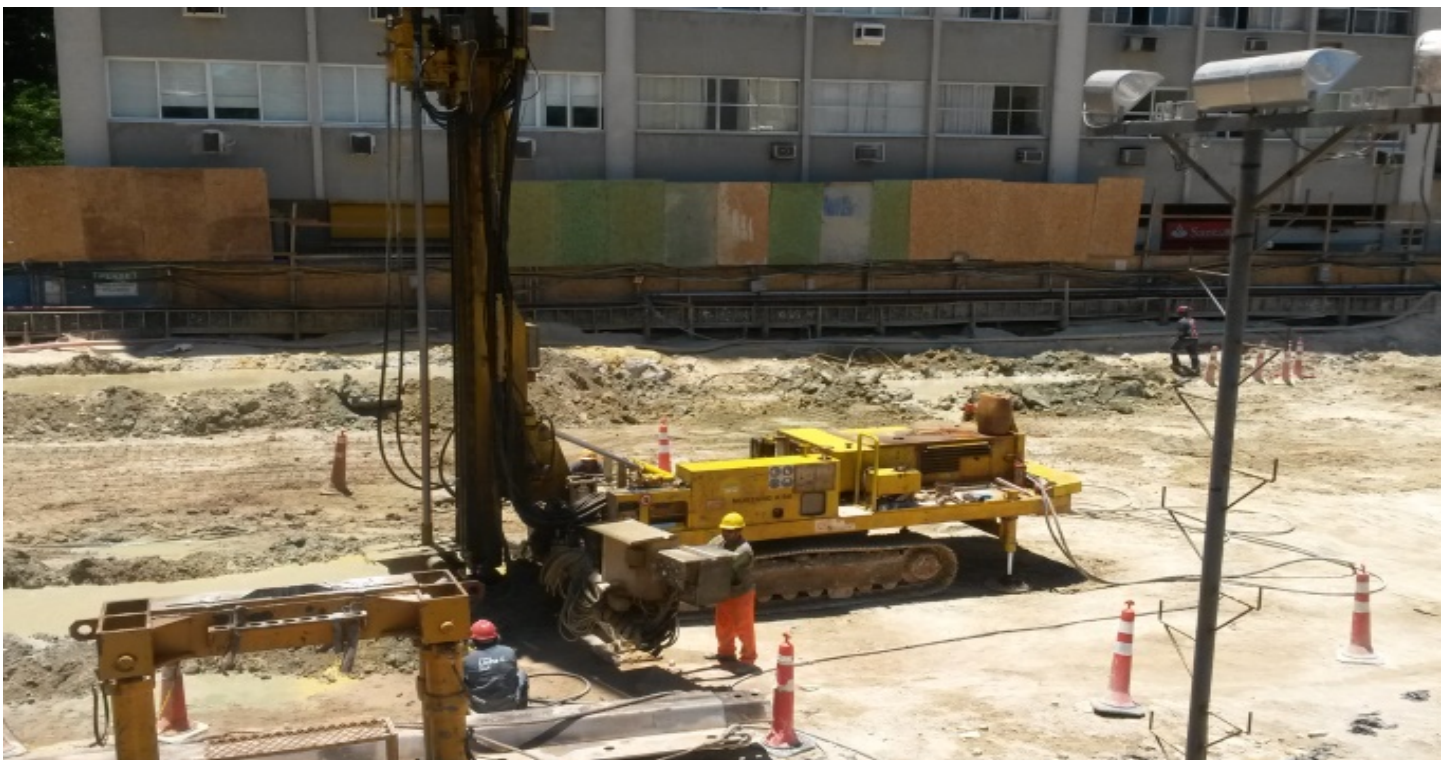
Antero de Quental Station - Line 4