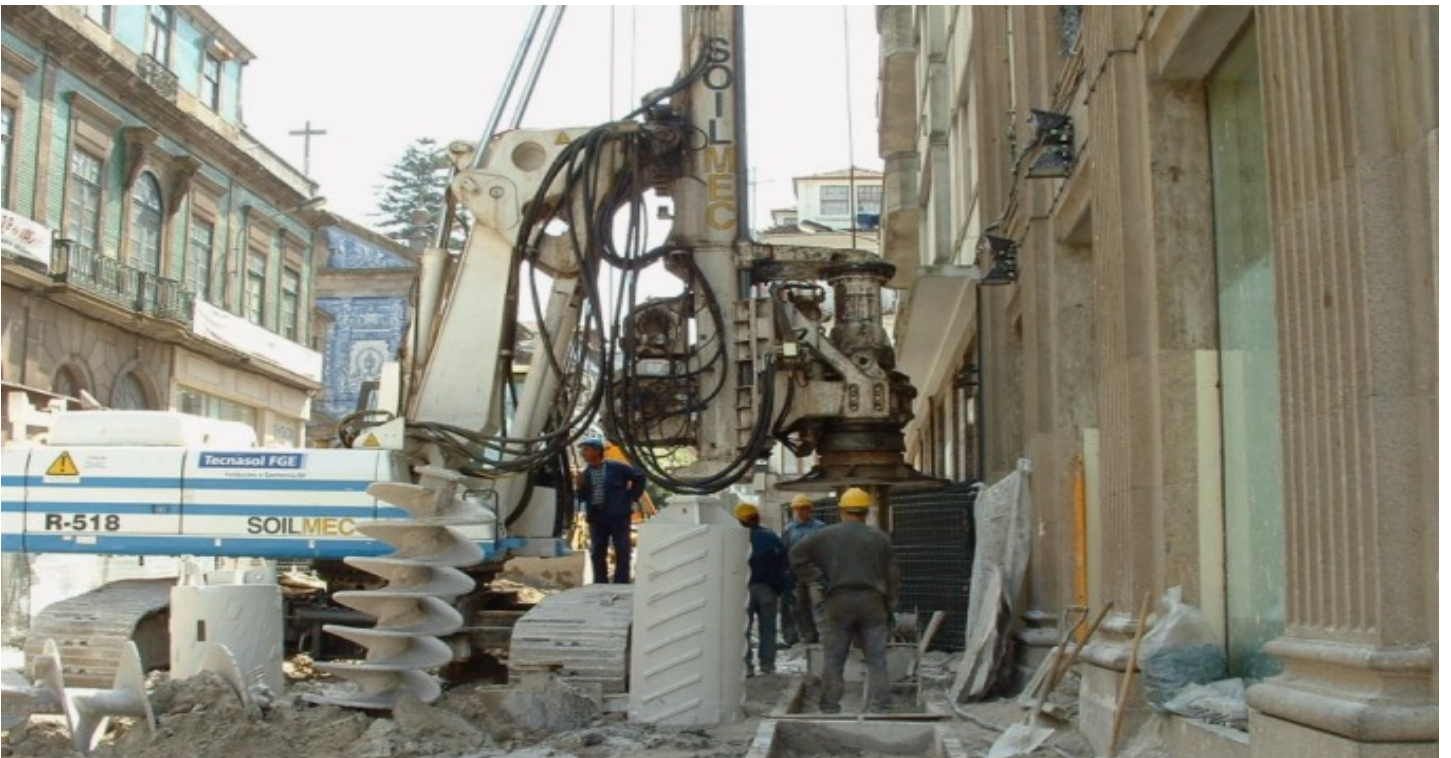
Bolhão Station - Porto Metro