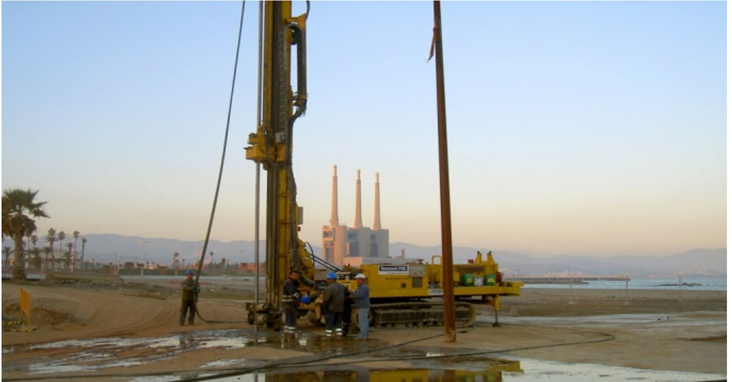
Port Mar Forum Building