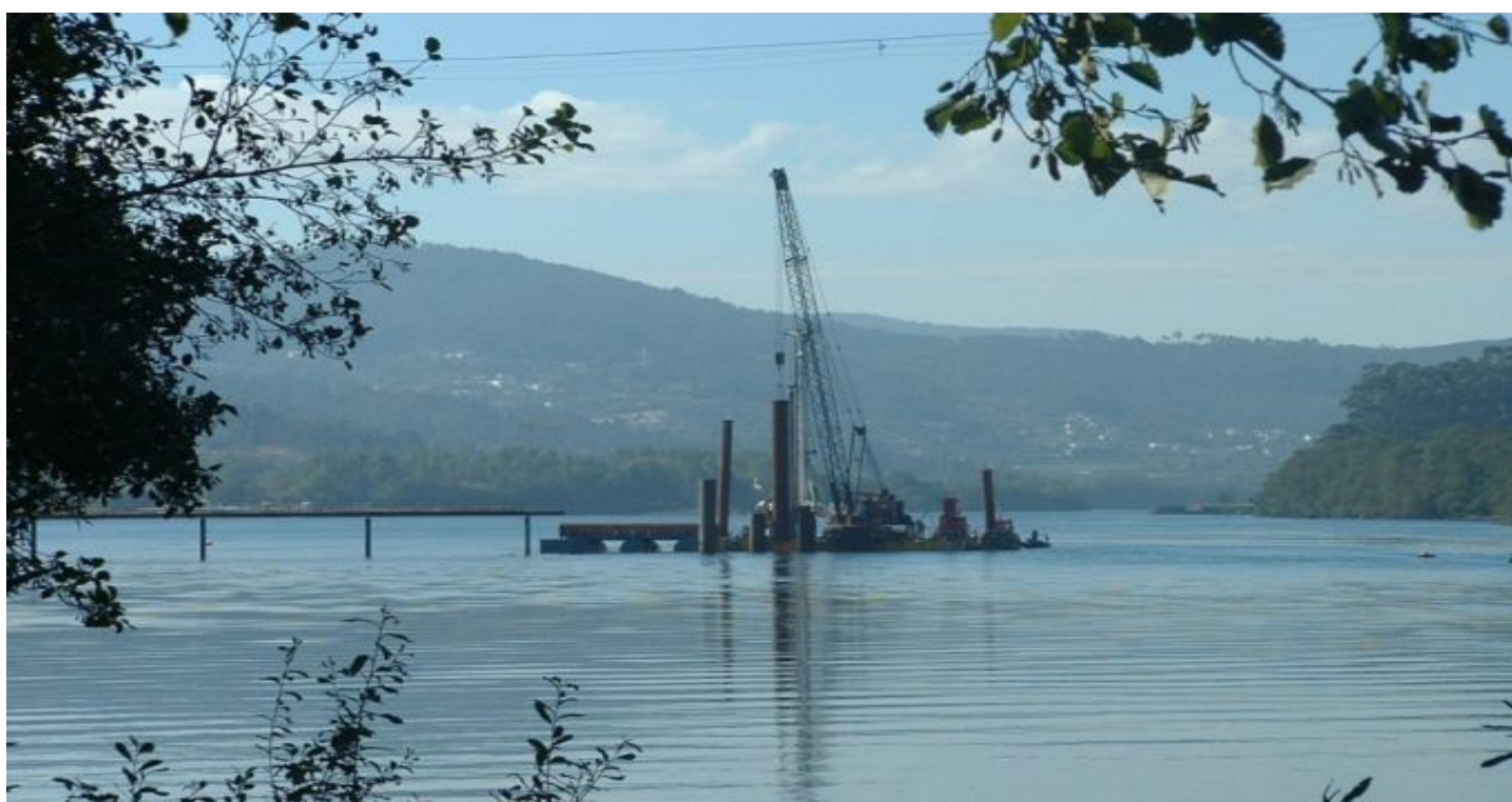
River Minho International Bridge