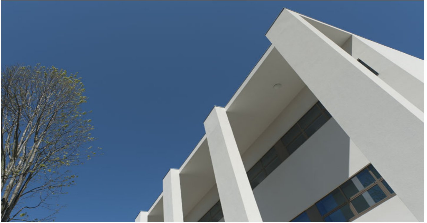
Marques Castilho School