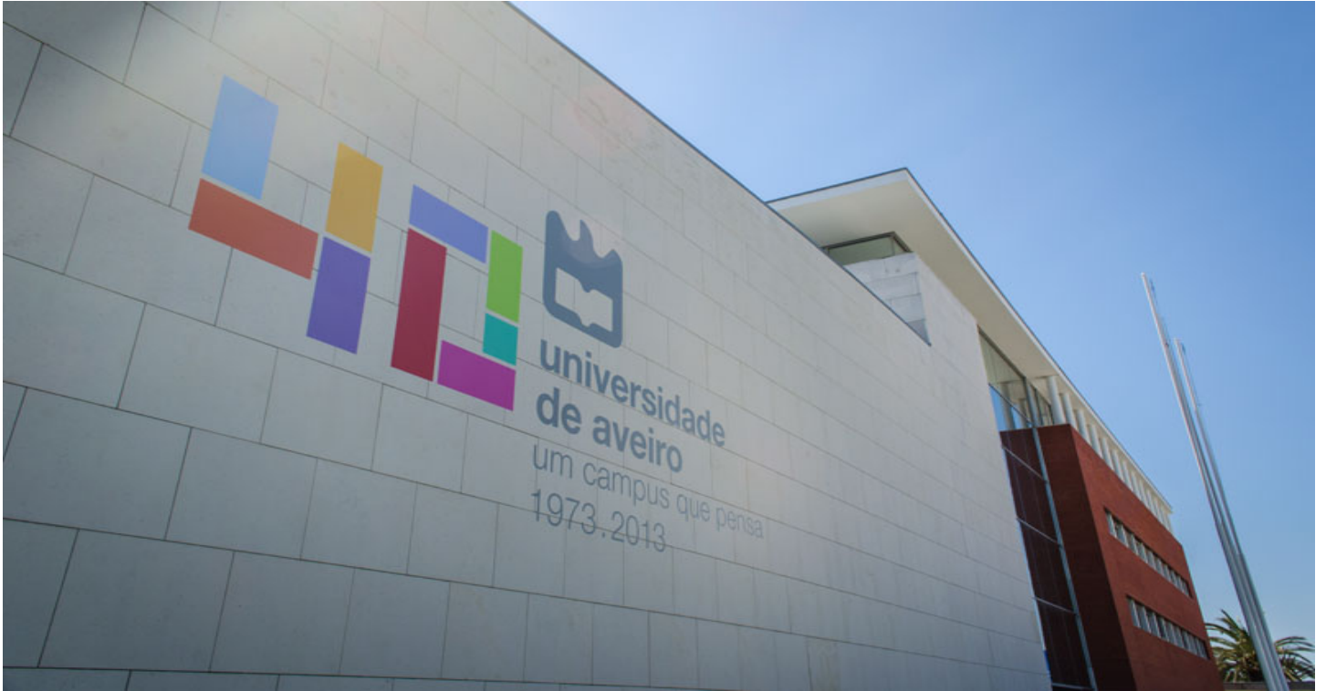
New Rectory of the University of Aveiro