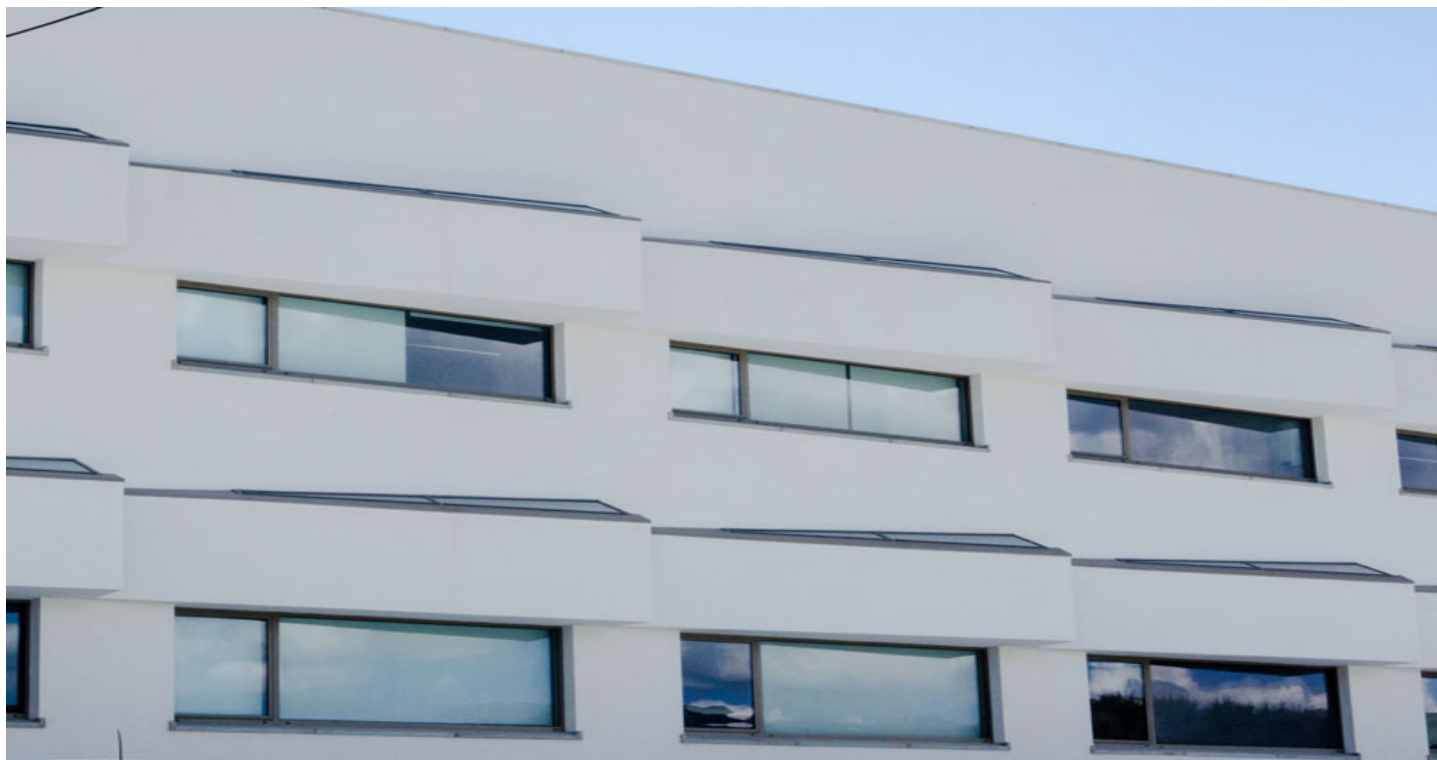
D. Egas Moniz High School and Resende Primary School