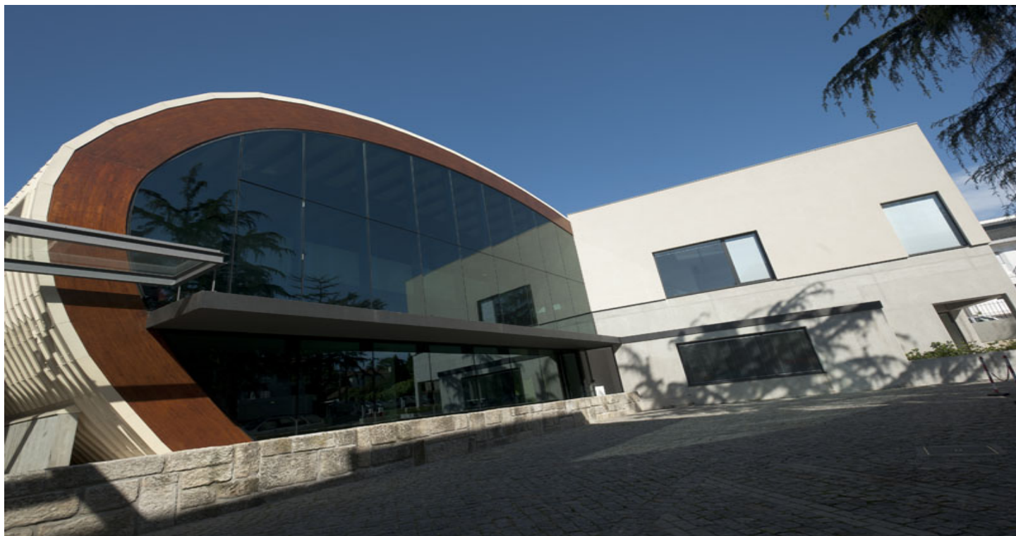
Colégio do Rosário (School)