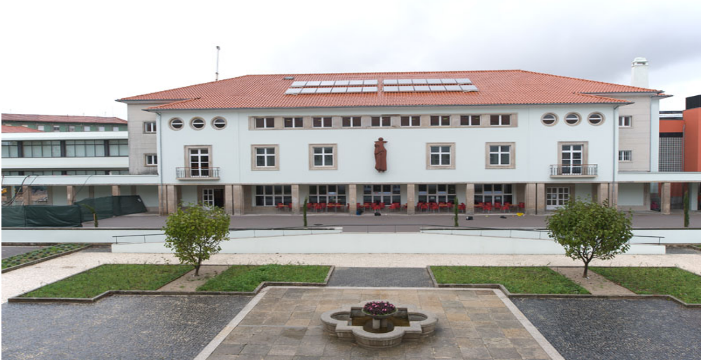
Carolina Michaelis High School