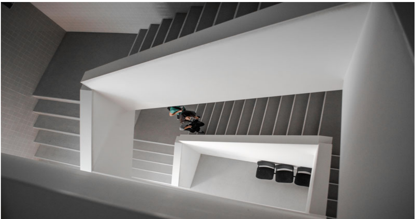
Marco de Canaveses High School