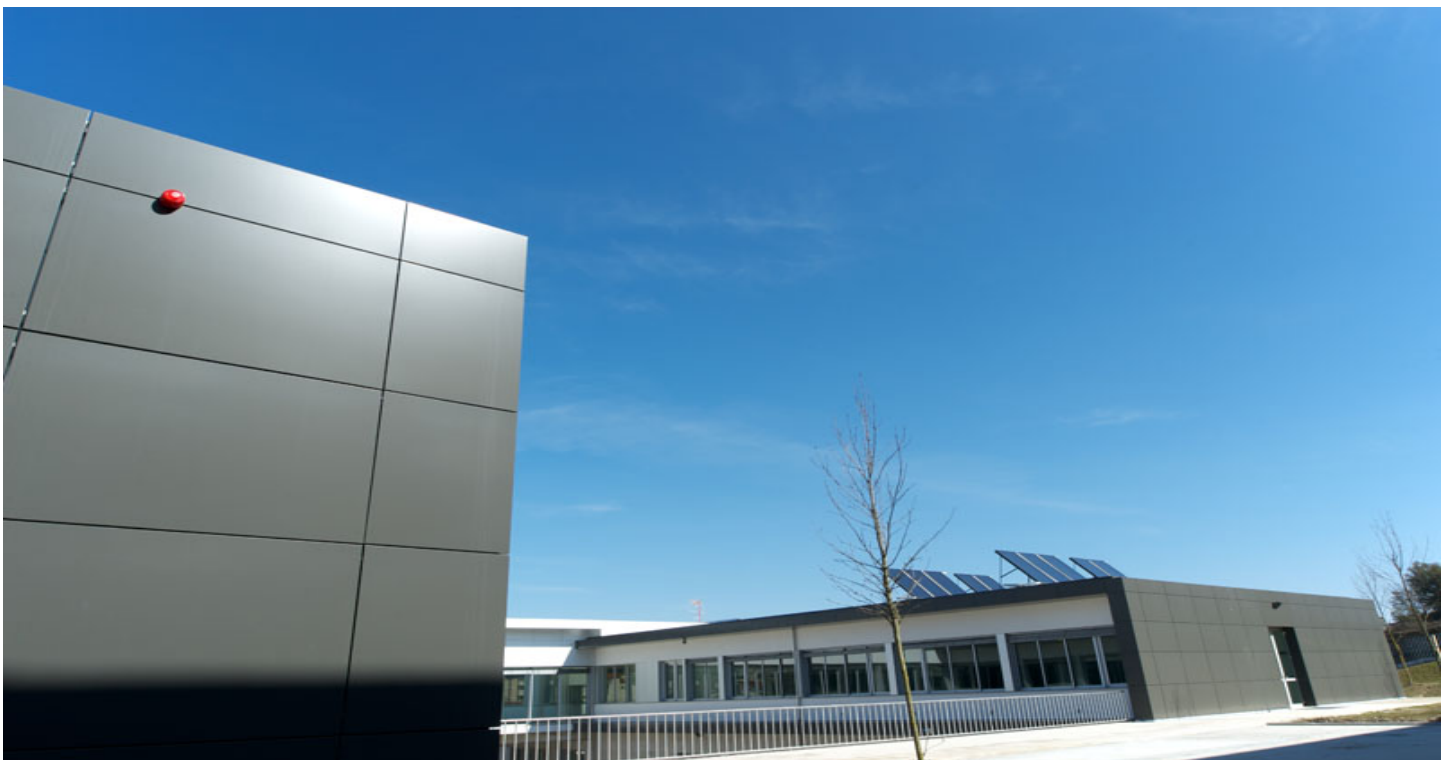
Centro Escolar de Bragança (Educational Centre)