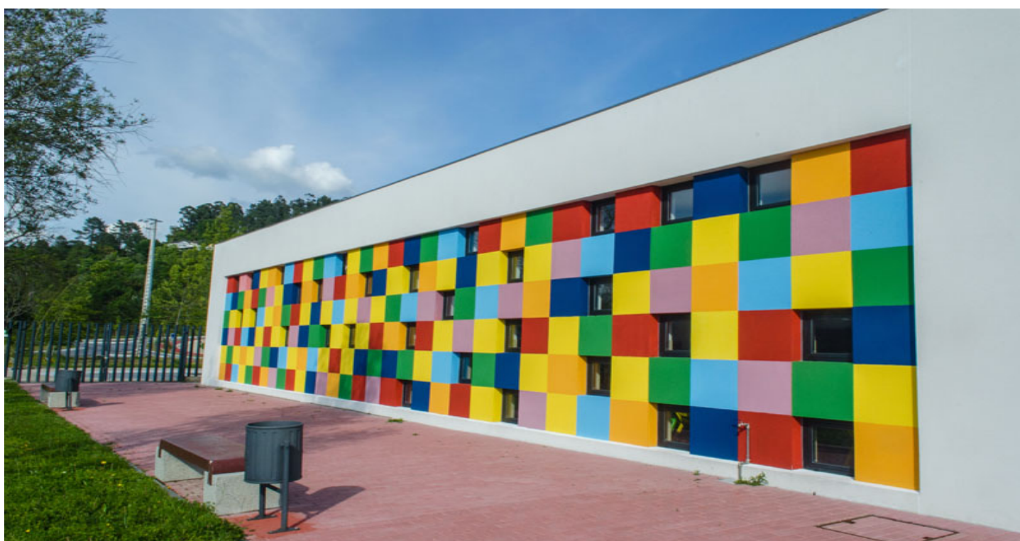
Centro Escolar de Caldelas (Educational Centre)