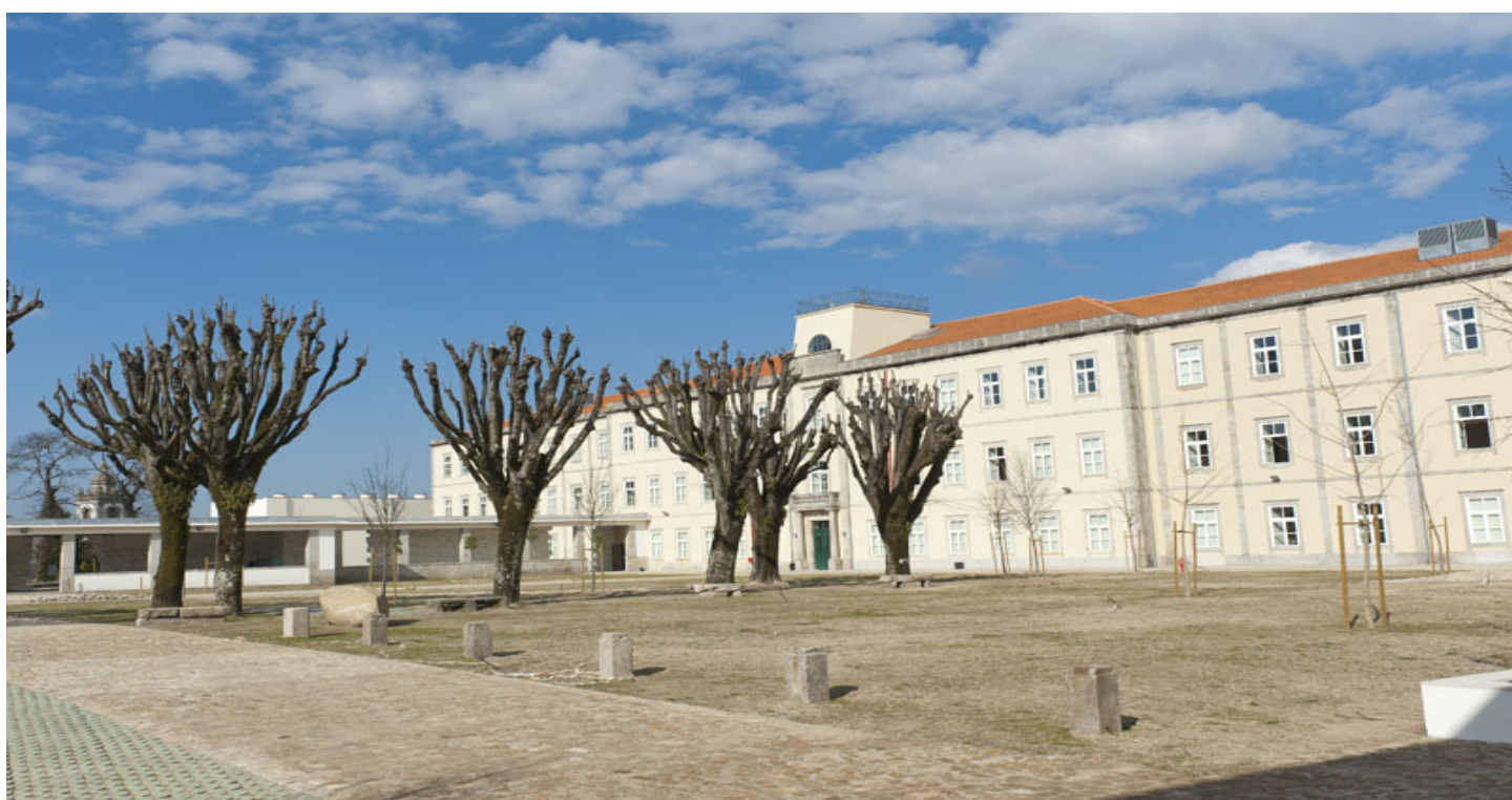
Sá de Miranda School