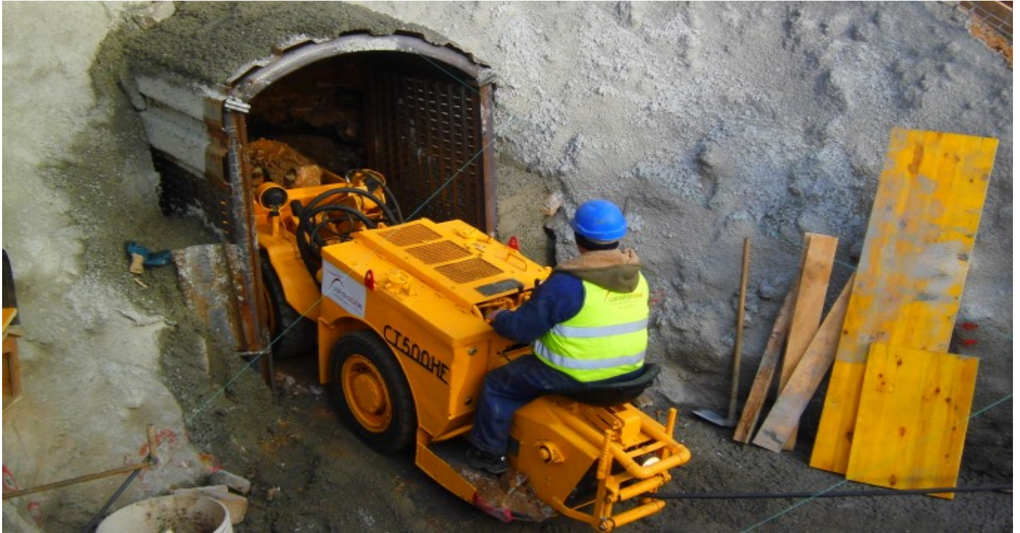
Mini tunnels in Barcelona