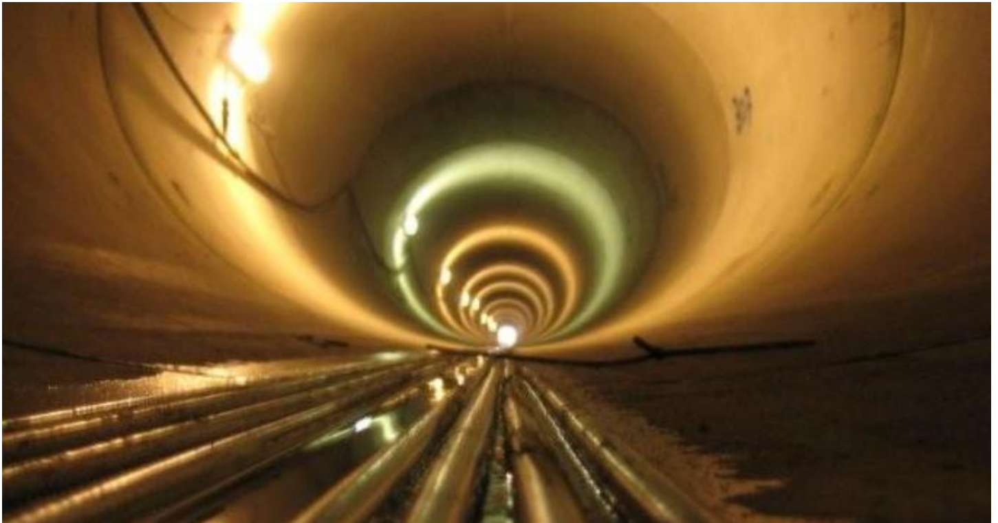
Mira Aquaculture Project