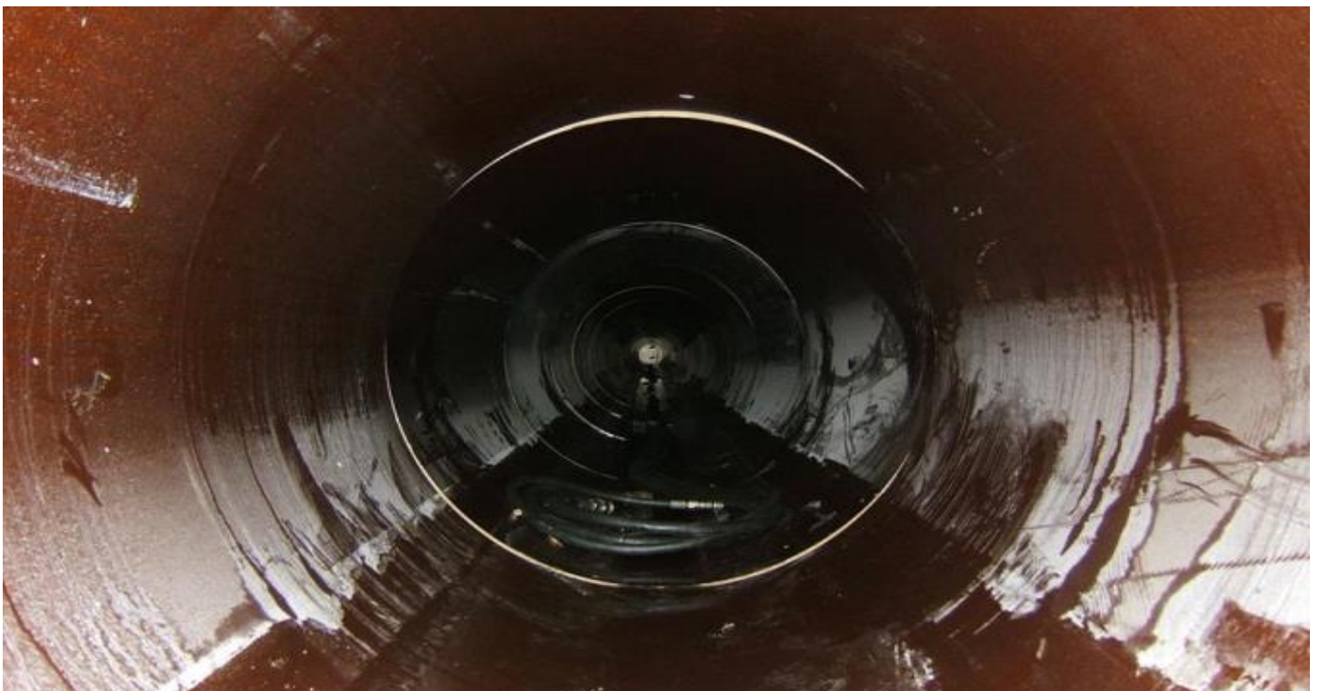
Interceptors, outflows and elev. stations V.F.Xira and Alhandra