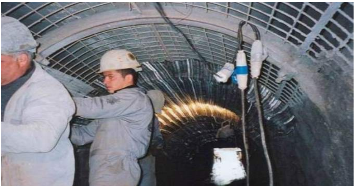
Mini Hydroelectric Plant tunnels