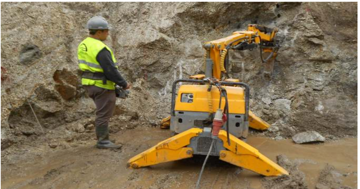
São Salvador Tunnel