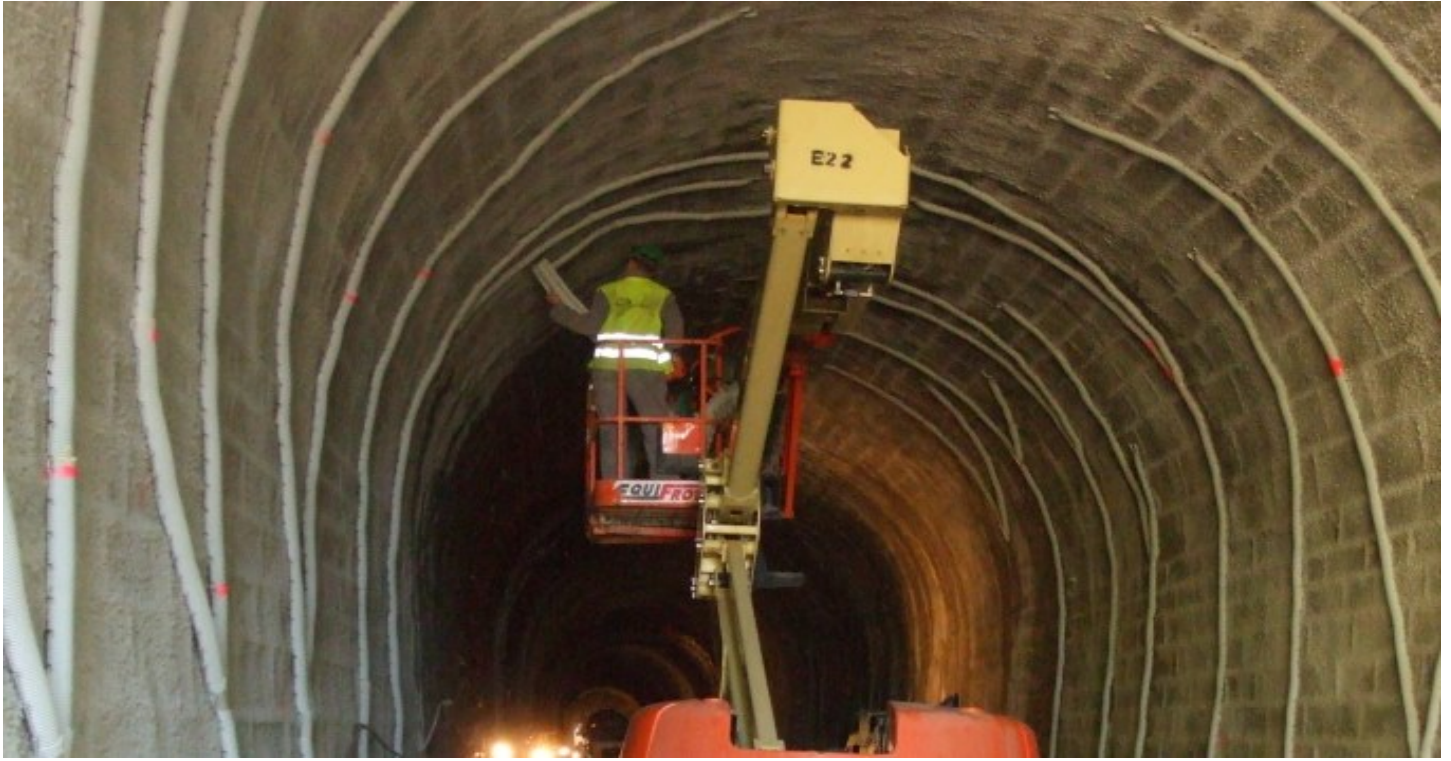
Sabugal tunnel rehabilitation and enhancement