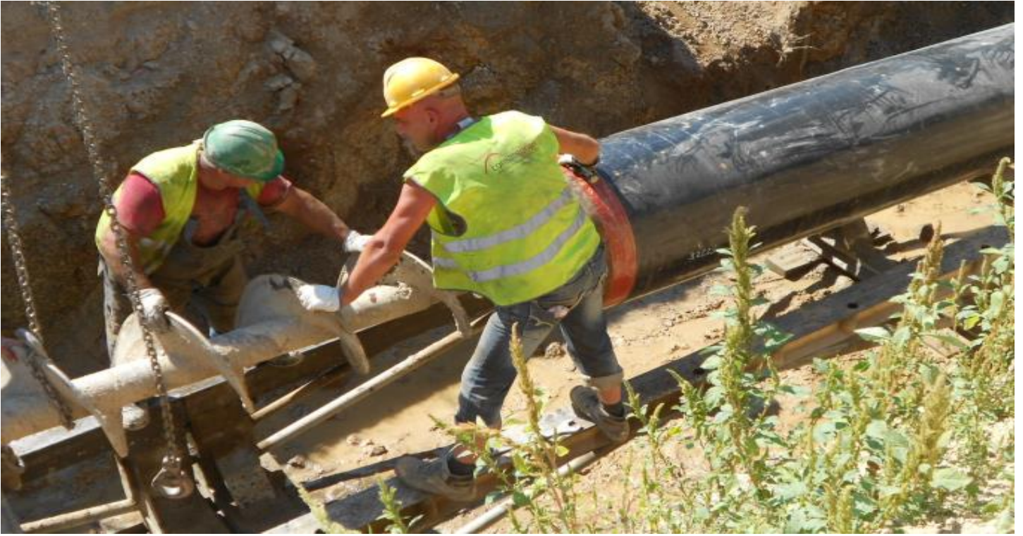
Mangualde Gas Pipeline