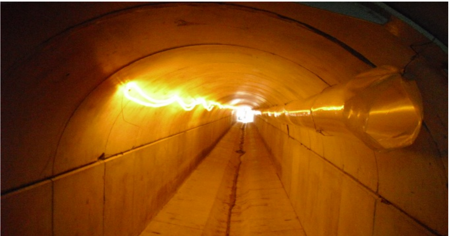
Metro do Porto