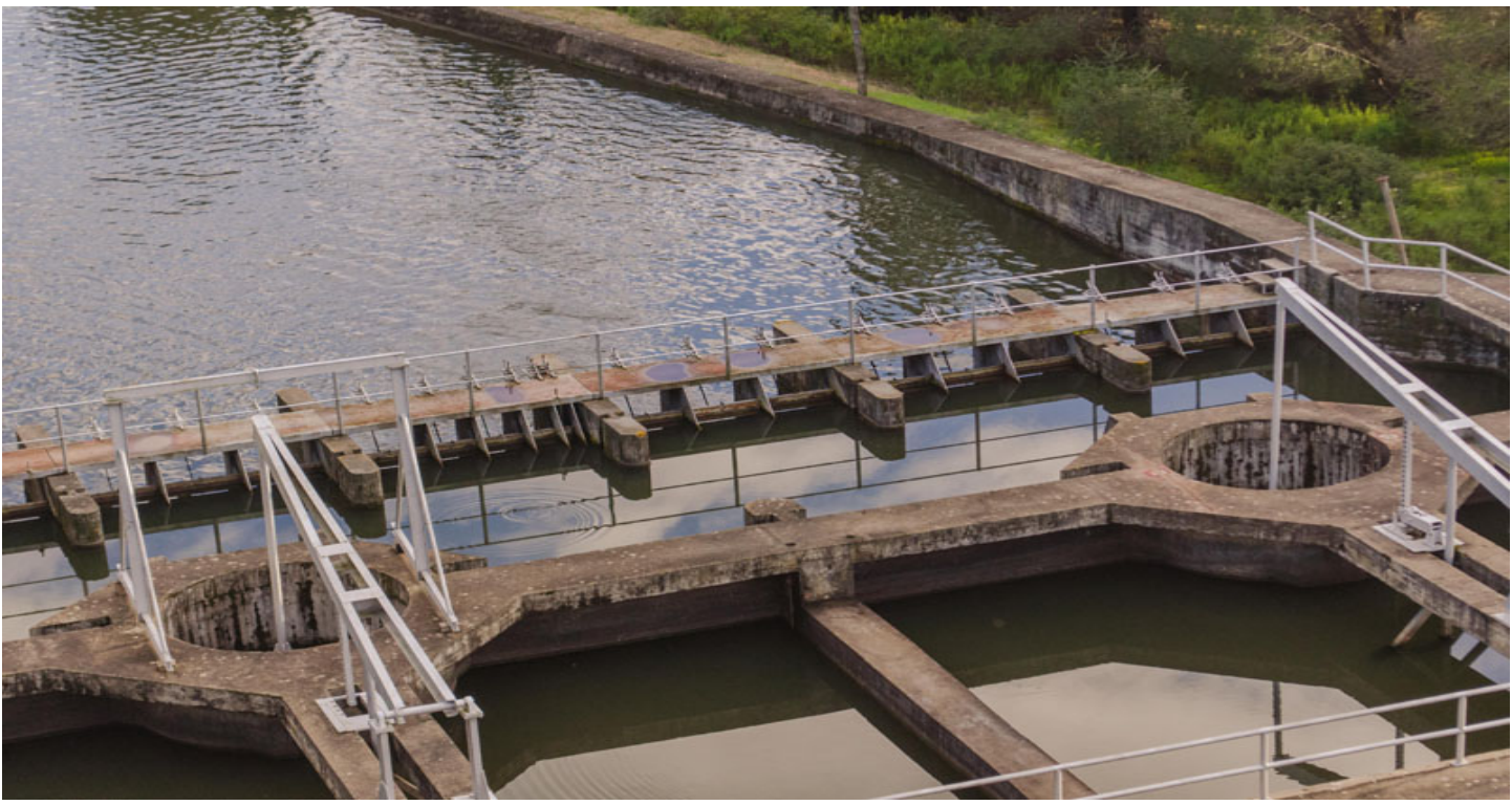
Albufeira de Odivelas (Reservoir) Segregation of Flows