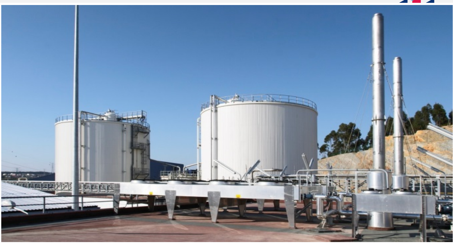
Organic Recovery Centre of Valorsul