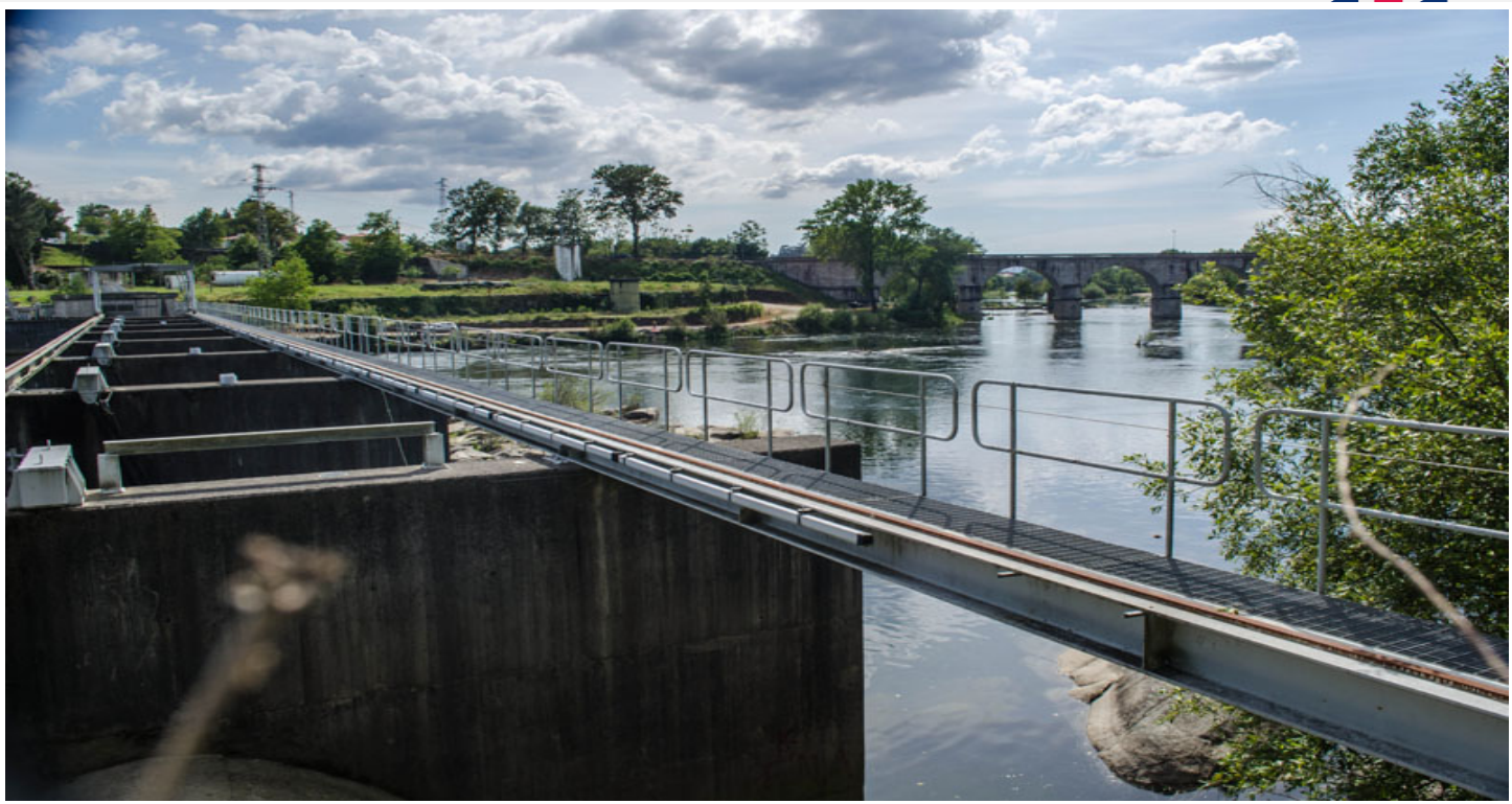
Cávado Homem Subsystem Interceptors